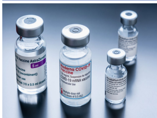
► Georgia has administered a total of over 1.8 million vaccines.

GEORGIA IS USING PFIZER, SINOPHARM, SINOVAQ AND ASTRAZENECA VACCINES