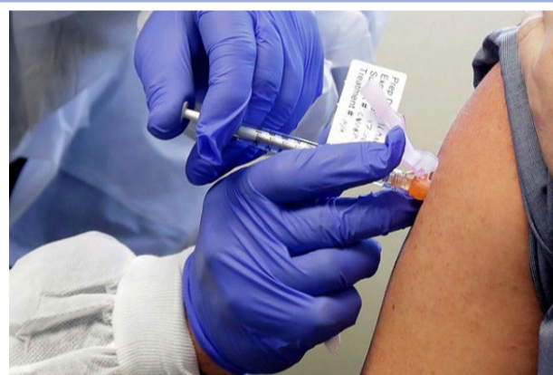
► Only about 30% of the population is fully vaccinated in Georgia.

for citizens of the country. The representatives of the Georgian health sector have long talked about vaccination in the country. For example, last month, the Georgian Health Minister said that there is no need for vaccination in the country to become mandatory.