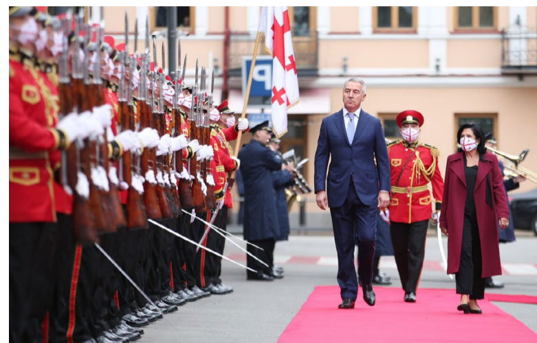
► President of Montenegro Milo Djukanovic arrived in Georgia for an official visit for the first time in the history of diplomatic relations between the two countries.

"Georgia is an important partner for Montenegro, especially