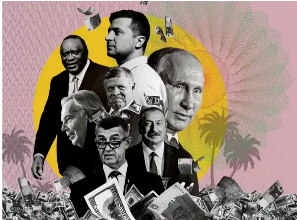
► The leaked materials of the Pandora papers also included Vladimir Putin and his entourage, the Aliyev family, Volodymyr Zelensky, and others. These people 'can funnel and siphon money away and hide it,' often through the use of anonymous companies.

Pandora Papers also includes leaked materials from 14 firms that help clients start companies in offshore zones. One of them is the company Alcolgal. The group says all the companies, at some point, listed Panama-based offshore service provider Alcolgal as an agent, which received an official letter from the Virgin Islands financial regulator in October 2011 asking about Finseck, a company founded by Ivanishvili. Alcolgal even replied that the company was related to the trust man-