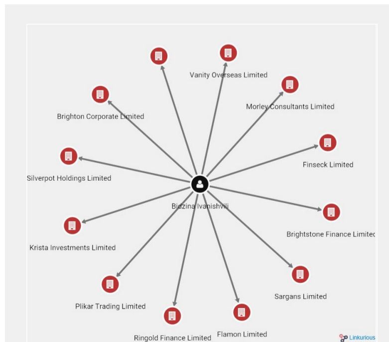
► Companies related to Ivanishvili.

"Exactly as well as in the neighborhood of these two facilities, there are many other terminals and railway stations, by the same logic we can conclude that the co-investment fund has an interest in the latter, which is illogical."