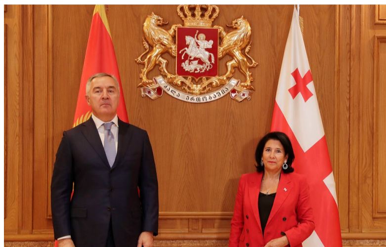
► Montenegrin President Milo Djukanovic and President of Georgia Salome Zurabishvili.

President Djukanovic reiterated Montenegro's support for the sovereignty and territorial