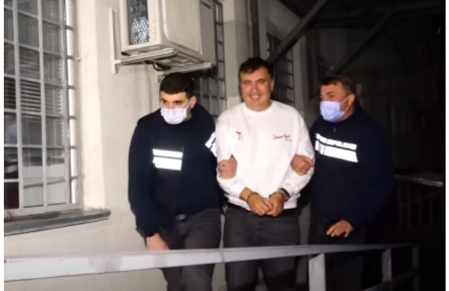
Georgia's 3<sup>rd</sup> president was arrested on Friday.