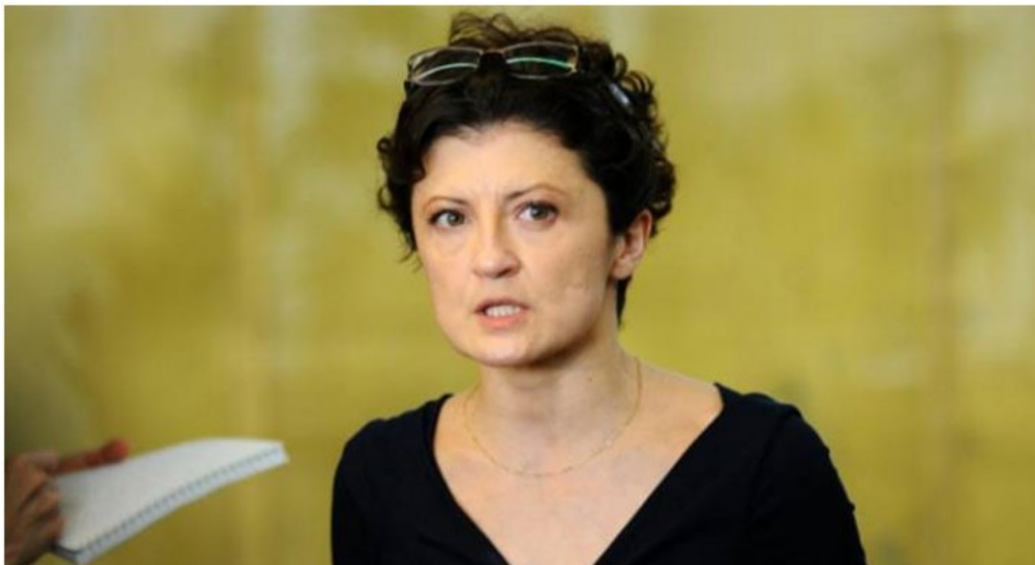
► The engineering study commissioned by the ministry contained conclusions on the current state of the Museum of Fine Arts, which said that the side of the venue facing the adjacent Gudishvili Street side 'might not be commercially viable'.