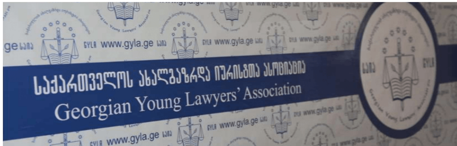
► GYLA assed the decision as a direct incitement to any crime that may be committed by law enforcement