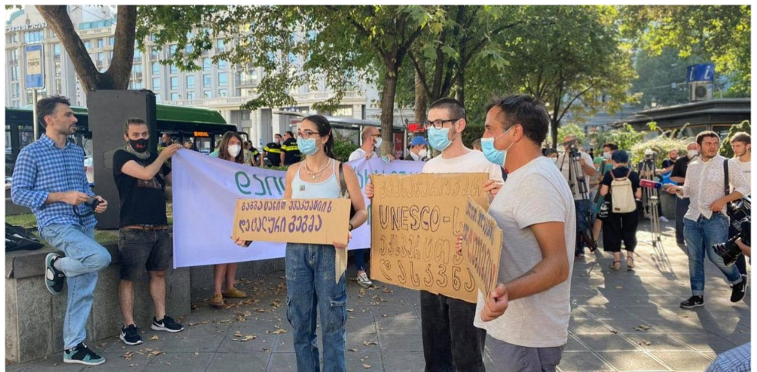
► The rally 'Save the Art Museum' was attended by civil activists, politicians and representatives of the cultural sphere.

Local offices of the International Council on Monuments and Sites (ICOMOS Georgia) and International Council of Museums (ICOM Georgia), as well as the Georgian National Committee of the Blue Shield have issued a joint statement last week which called the state authority's plan to evacuate all exhibits from the museum to neighbouring Georgian National Museum venues within 6 months impossible and unrealistic. The statement also noted that the preservation of the monument 'would only be acceptable through safeguarding its authenticity and integrity'.