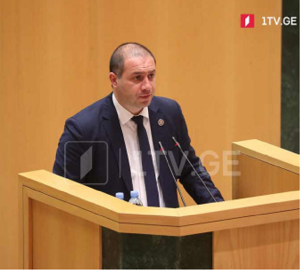
Mikanadze said that NGOs' reports on pre-election period circumstances are presumed to be based on suspicions, and they have confirmed that they cannot talk about violations in an affirmative form.

The commission selected the 41 most problematic polling stations, where cases of excess and lack of ballot papers were recorded, of which 3 were already recounted and thus 20 polling stations were chosen by random sampling method. The Investigative Commission held 16 working meetings, addressed 22 letters to various agencies, and received appropriate responses from them. According to Mikanadze, all processes were carried out unprecedentedly transparently and were maximally accessible to any interested person and the recount process was carried out in public, at all polling stations.