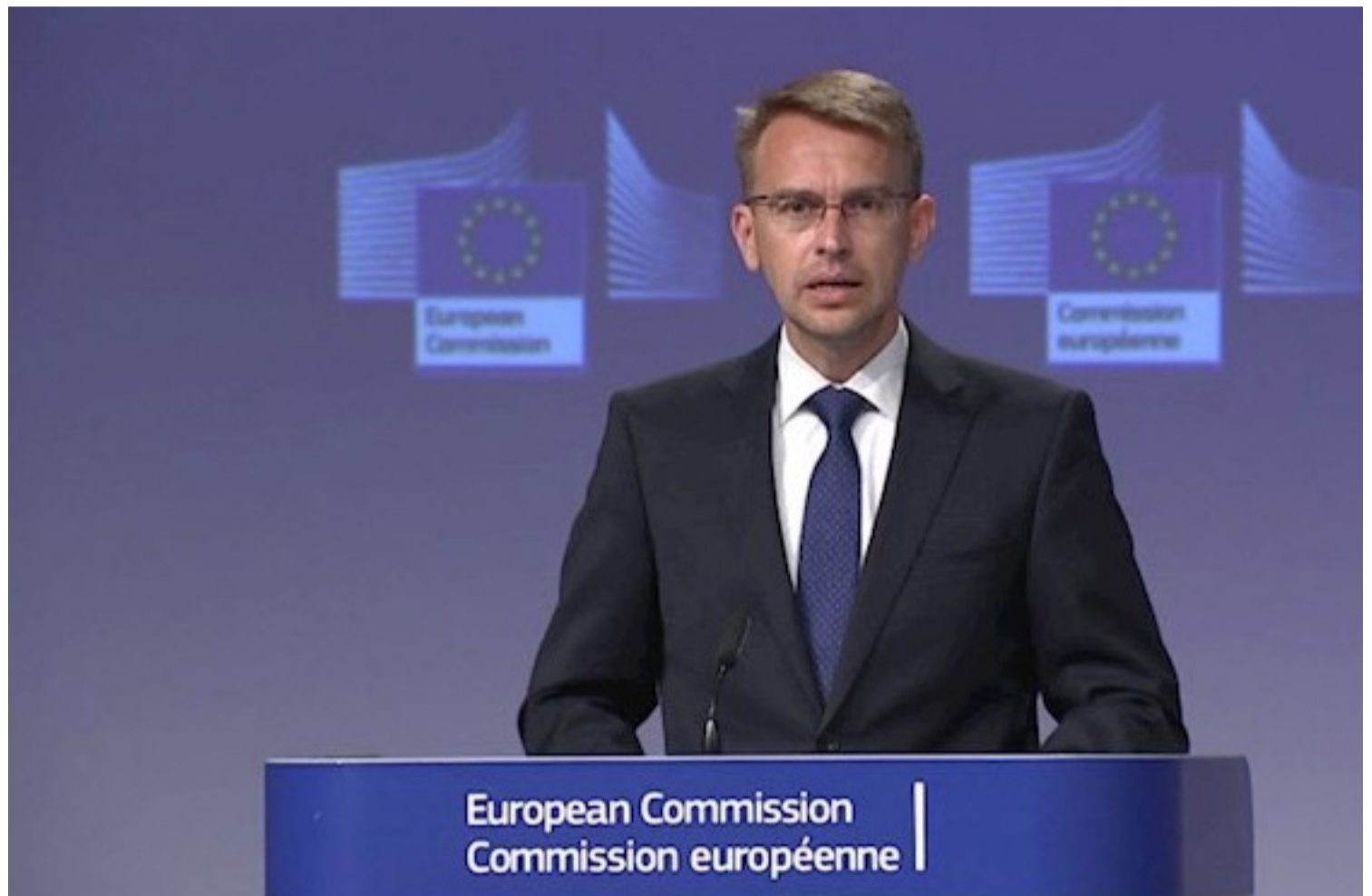
► According to the European Commission Spokesperson, Reviewing the selection process of Supreme Court judges in accordance with Venice Commission recommendations is one of the key preconditions for the disbursement of the second tranche of MFA to Georgia.