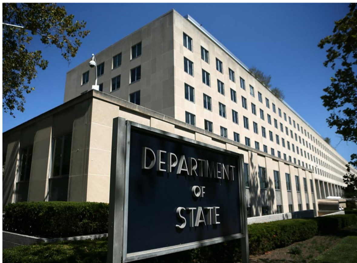
"We firmly oppose abuses against the LGBTQI+ community and, of course, in this case, the brutal violence against your former colleague, your now deceased colleague."

As of July 14, 21 people have been detained on allegations of assault, persecution, and interfering with the professional duties of journalists. 5 of them were part of the Lashkarava assault.