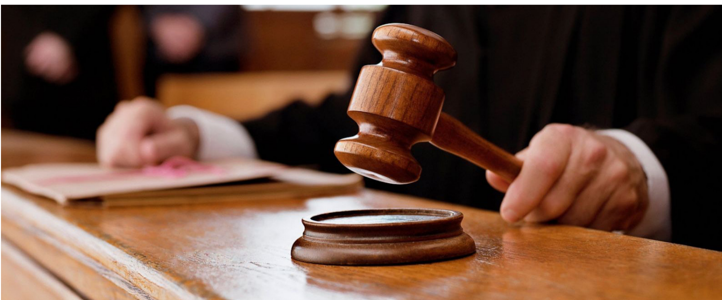
► In the recent report, OSCE/ODIHR expressed concern over the fairness and equality of the nomination process of the judges, EU spokesperson said.

In the recent interim report, OSCE/ODIHR expressed concern over the fairness and equality of the nomination process and stressed that the candidates were presented to the Parliament under the circumstances of low public trust in the independence of the judiciary.