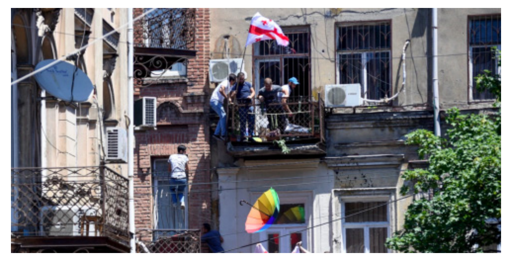
Lashkarava was injured on July 5 violent protests