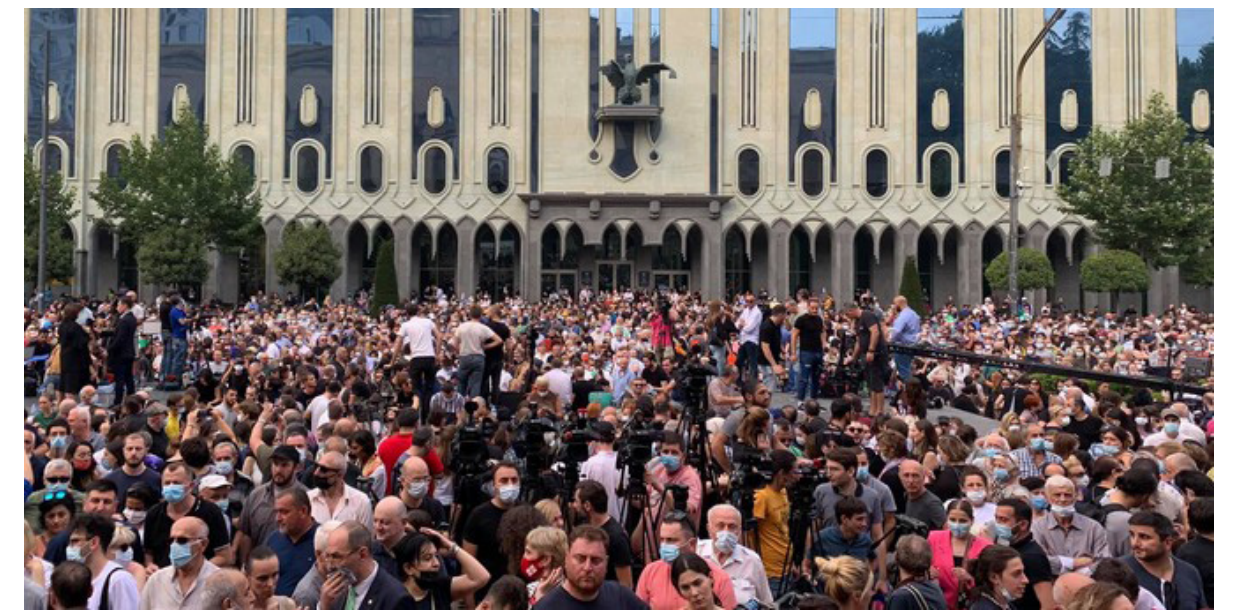
Representatives of almost all legit media outlets were present at the rally, including TV Pirveli, Mtavari TV, Imedi TV, Formula and many others.