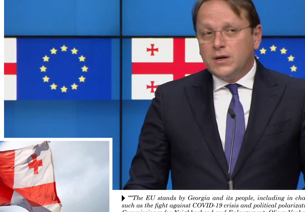
• ""The EU stands by Georgia and its people, including in challenging times such as the fight against COVID-19 crisis and political polarization," European Commissioner for Neighborhood and Enlargement, Oliver Varhelyi stated after a meeting with the PM of Georgia Irakli Garibashvili.