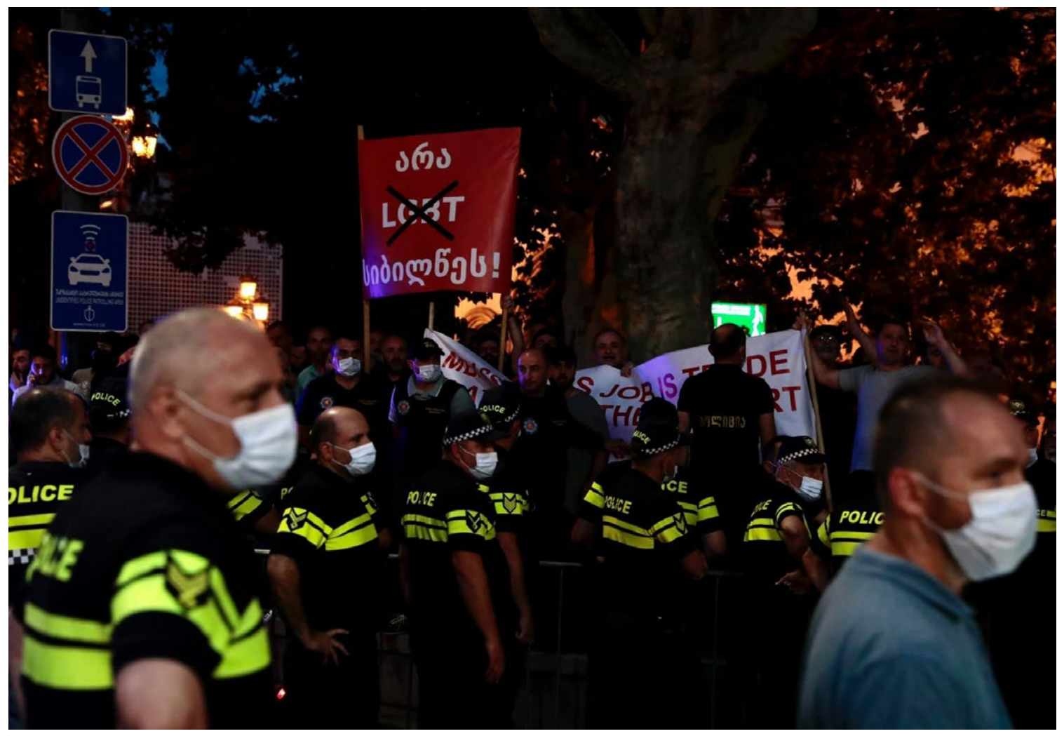
According to the Georgian Interior Ministry, 68 detainees have been released on parole, while 32 remain in temporary detention.