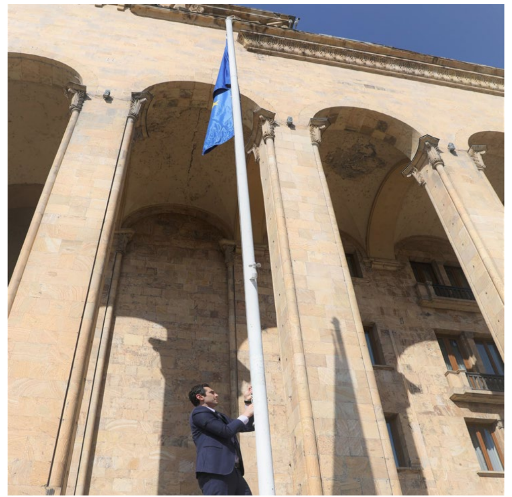
ightharpoonup Georgian Parliament Speaker Kakha Kuchava raised the European Union flag in front of the Georgian parliament again, after the radical violent groups took it down and burnt it.

Violent right-wing groups took over the peaceful protest and injured citizens and law enforcement as they threw rocks and iron bars at them. Following the hourslong tensions, after the For Freedom rally activists left and the police escorted the journalists, the radical protesters took down and burnt the LGBT, as well as European Union, flags. Yesterday, Georgian Parliament Speaker Kakha Kuchava raised the European Union flag in front