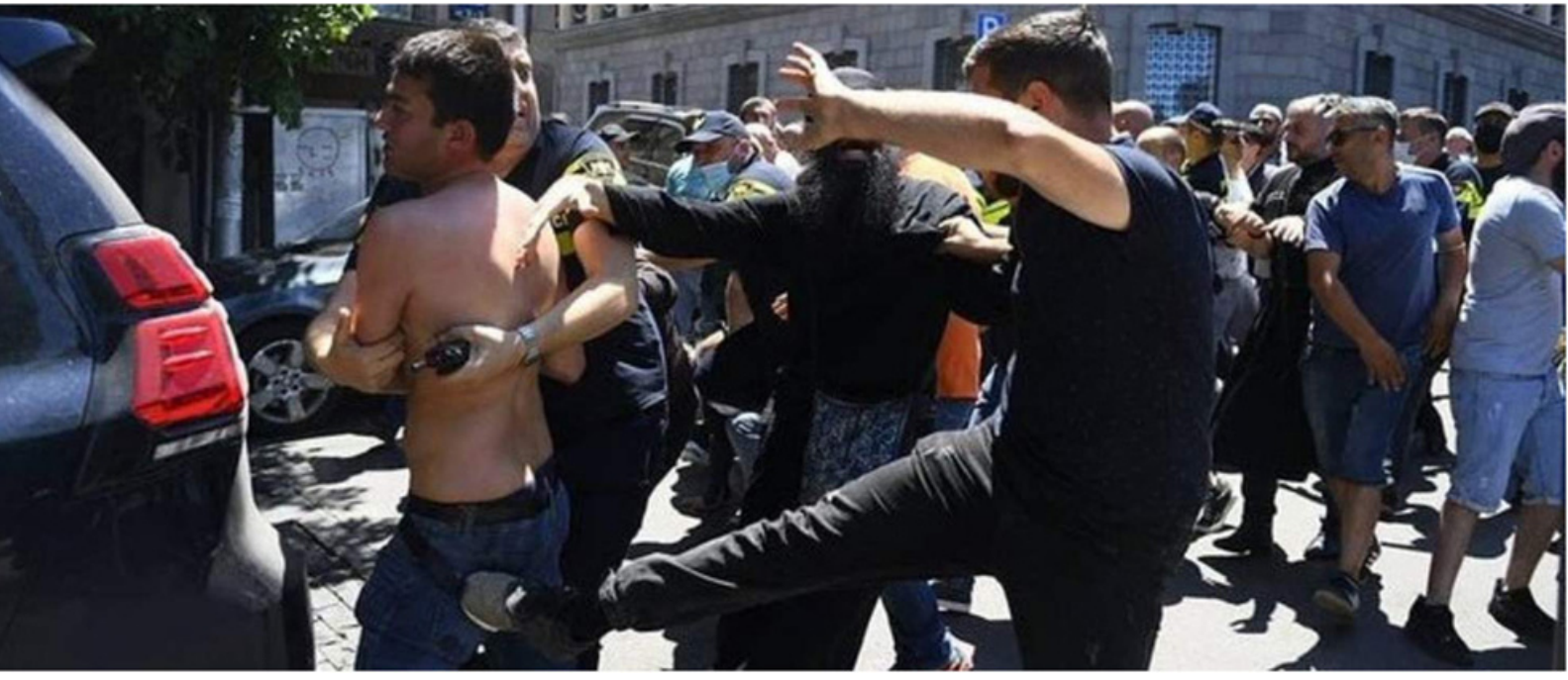
Several Western embassies in Georgia and international partners issued statements condemning the attack and calling on authorities to ensure freedom of expression and assembly.

"It is important that the investigative body investigates all episodes of violence and obstruction in a timely, effective and organized manner, including in identifying discriminatory motives. At the same time, the investigation should be interested in and give a legal assessment of how effectively the mobilization and actions of the police force were planned and executed to prevent the violent development