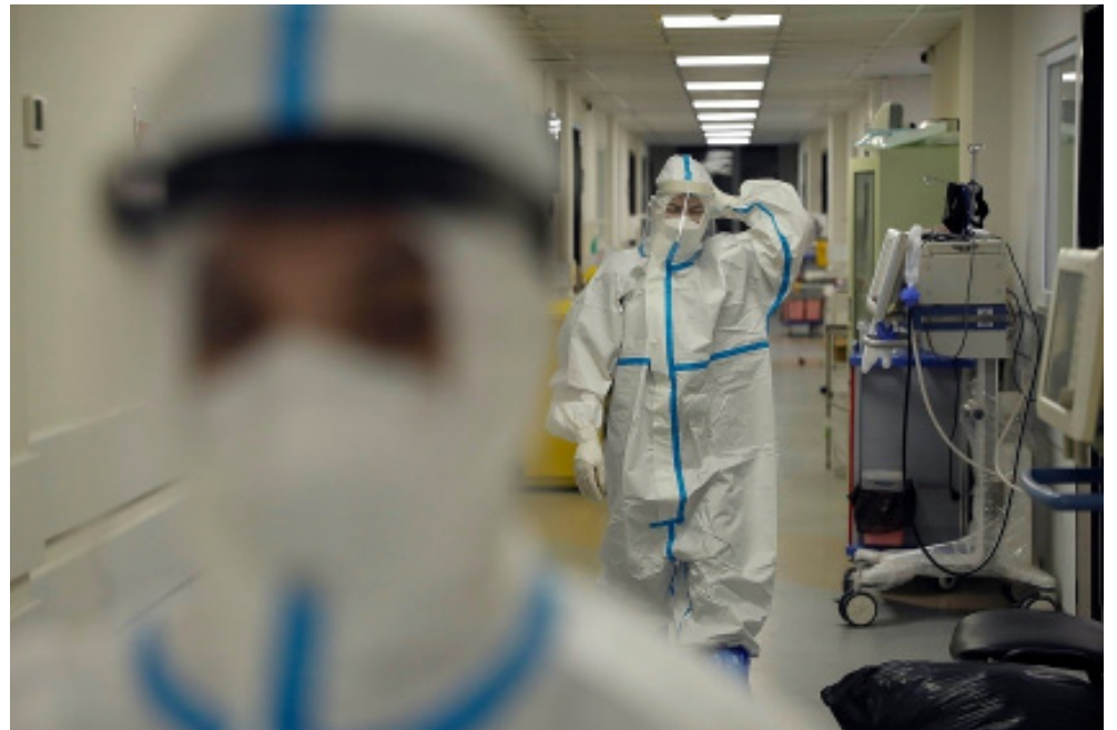
On Monday, Georgia reported 1026 new cases, 381 recoveries and 12 deaths.

On Monday, Georgia reported 1026 new cases, 381 recoveries and 12 deaths. As of July 5, there are a total of 369,886 confirmed cases, among them, 355,127 people recovered and 5,373 died. So far, 267,727 people have received coronavirus jab in Georgia.