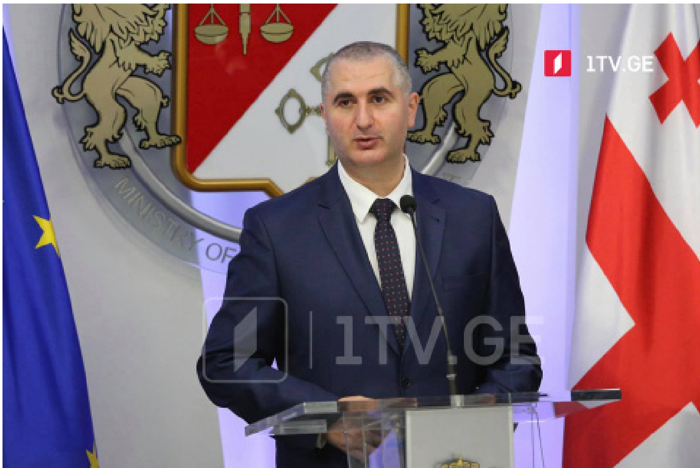
Draft amendments to the current budget will be discussed at the parliament this week.

The Minister also informed that these parameters are based on the baseline scenario of economic development (GDP growth of 7.7%), but along with the budget, there is an optimistic scenario, the probability of which is quite high. In such case, economic growth will exceed 10% and will reach ₾ 58.8 billion in nominal terms, while the budget deficit and debt ratio to GDP will be further reduced to 6.2% of GDP and 53.1% of GDP, accordingly.