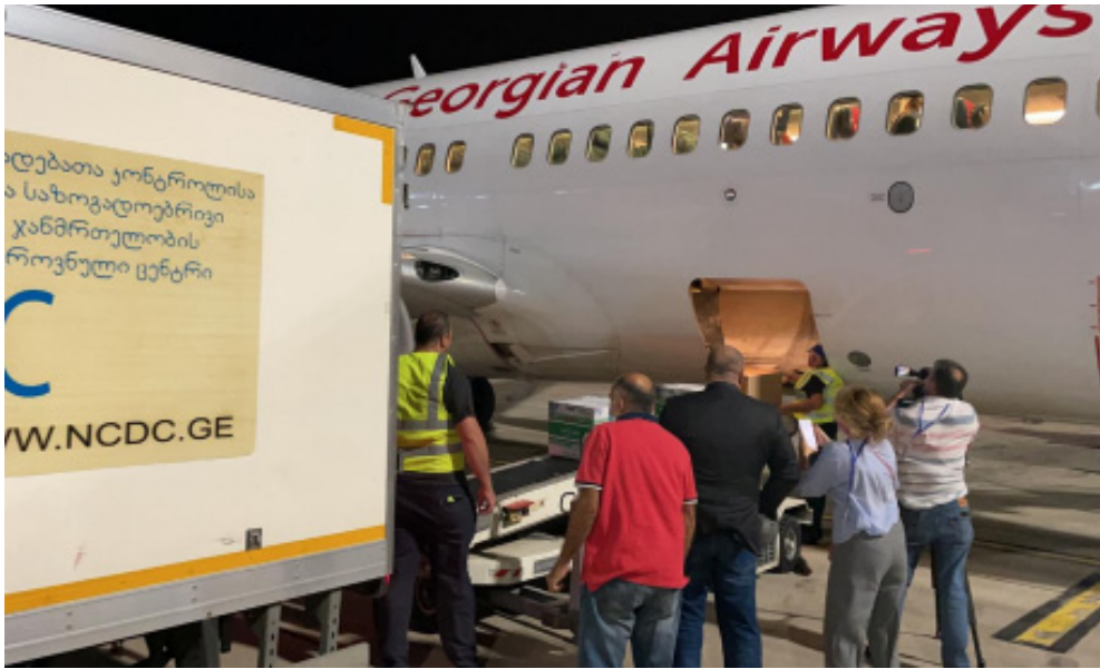
On Monday, 5,000 doses of AstraZeneca coronavirus vaccines granted by Austria landed in Tbilisi.