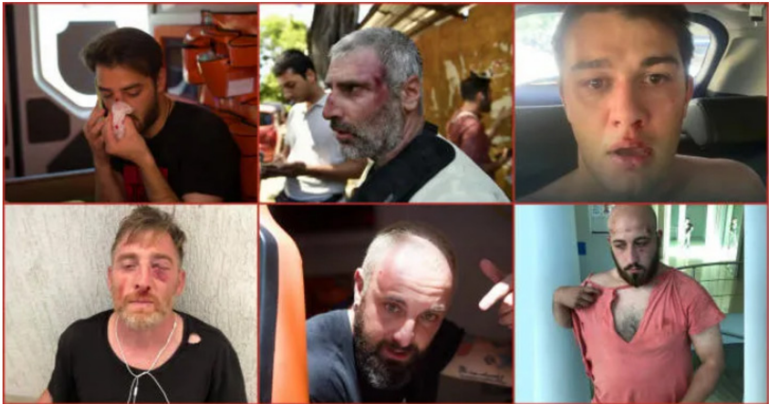
International community calls on the Georgian government to hold the attackers accountable for their actions.

The international partners expressed concern about "the failure of the government leaders and religious