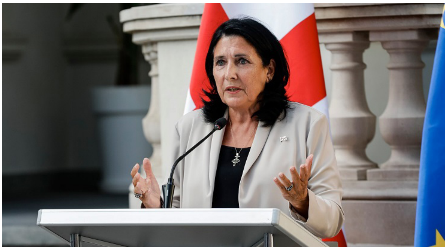
"Violence is unacceptable. I condemn today's events and any form of violence over the difference of ideas or gender identity. Everyone has the constitutional right to express their opinion," Georgian President Salome Zurbashvili stated.

officials to condemn violence." According to the statement, participation in peaceful gatherings is a right guaranteed by Georgia's Constitution. "Those who incite or threaten violence or commit violent acts... should be prosecuted to the full extent of the law," the statement reads.