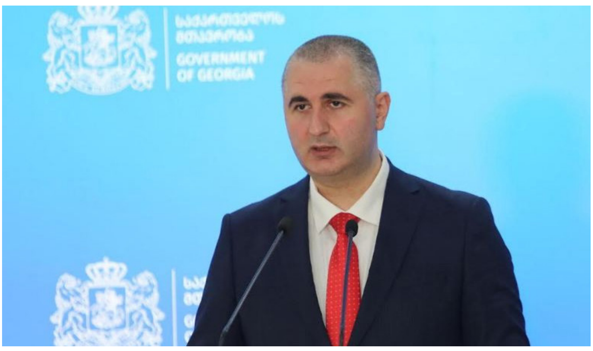
According to the finance minister, 25.8% in May indicates double-digit annual economic growth.