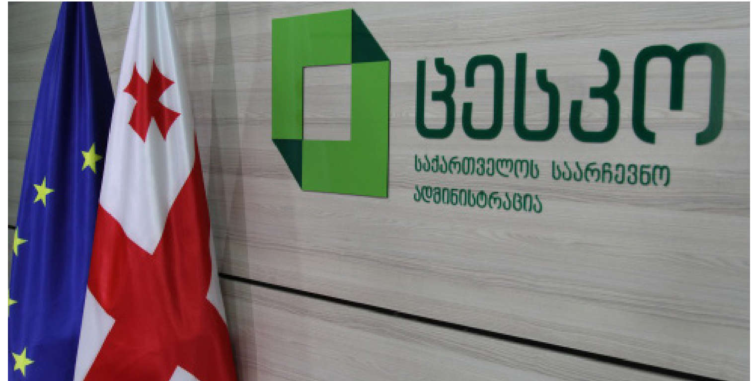
Tamar Zhvania was appointed on the post in 2013 and re-appointed for the second term in 2018.