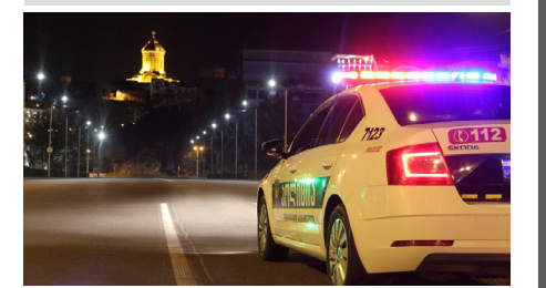
FULL STORY ON Page 2

Government lifts nationwide curfew, mass vaccination to start in Georgia