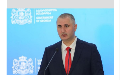
FULL STORY ON Page 3

Geostat: Georgian economy grew by 11.5% in 2021