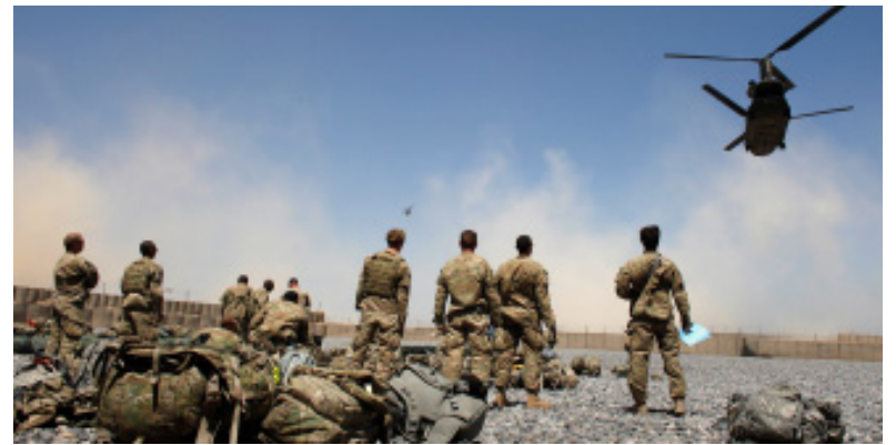
The decision to withdraw troops from Afghanistan was made in April 2021.

In April 2021, the allies decided to start withdrawing troops by May. The Resolute Support mission (RSM) in Afghanistan was launched in 2015 and involved more than 16,000 personnel from nearly 40 NATO member and partner countries. Georgia has been part of the NATO-led mission since 2004 and became the largest non-NATO member contributor with 860 soldiers in total. Thirty-two Georgian soldiers have been killed and many injured since the beginning of the RSM.