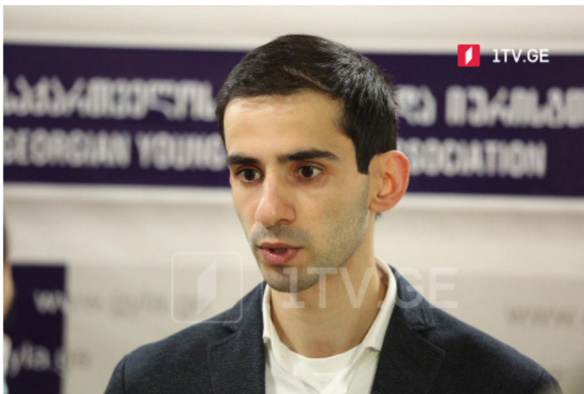
"Systemic changes are needed to reduce the clan's influence in both the court and the council," GYLA chairman said.