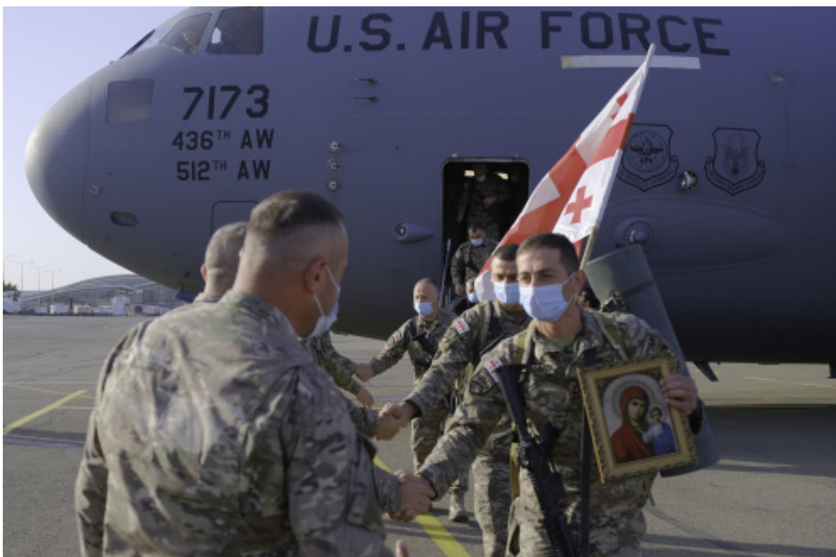
After joining the NATO-led Resolute Support Mission in 2014, Georgia became the largest non-NATO member contributor with 860 soldiers.