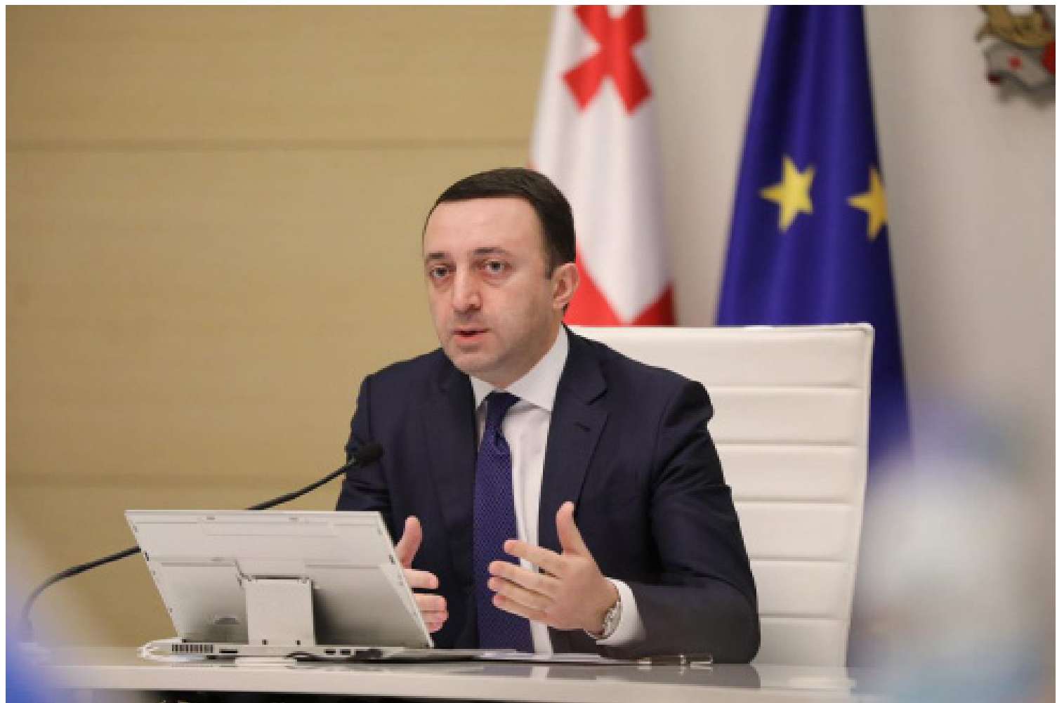
The commission created at PM Irakli Garibashvili's request will focus on developing a unified state approach and strategic view of the country's de-occupation, unification, and peaceful conflict resolution.

The press service reports that numerous meetings, dialogues, discussions, and consultations will be held this year, both on an interagency level and with the engagement of civil society "to develop under the common nationwide process a state vision of a peaceful and unified Geor-