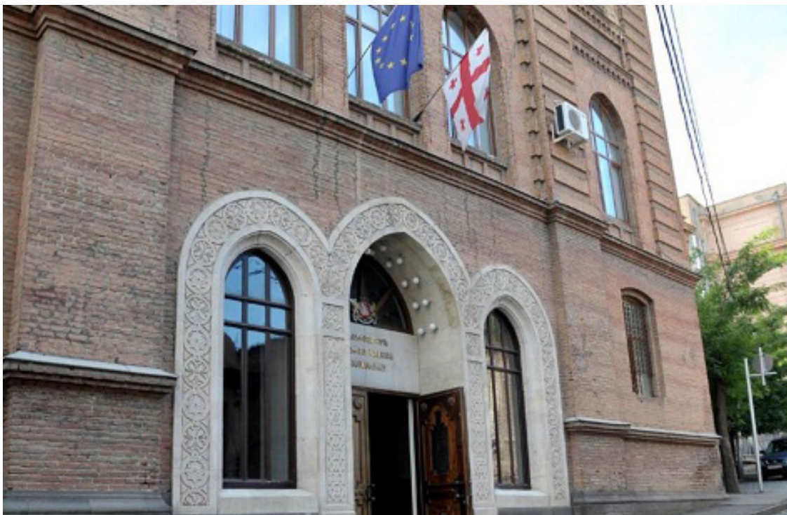
The commission will be led by the Ministry of Foreign Affairs.