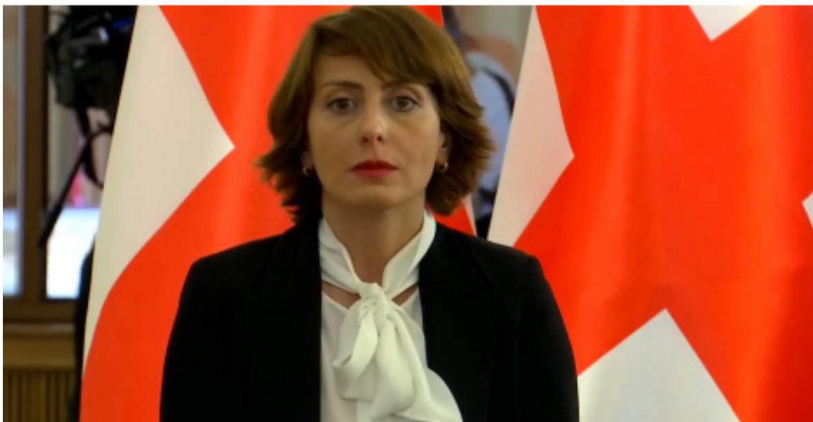
The UNM has initiated the establishment of a commission of inquiry into the "clan" court.

Establish gender, regional, and instance quotas (as defined by law, but need to be clarified) when electing judge members of the Council;