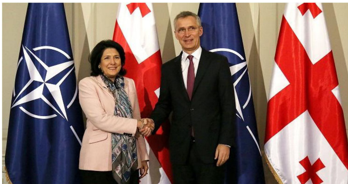
"Welcome the renewed and strong commitment by NATO to Georgia's territorial integrity, to the security and stability of the BlackSea and to the OpenDoorPolicy," President of Georgia wrote. Photo from March 2019.

"In accordance with its international commitments, we call on Russia to withdraw the forces it has stationed in all 3 countries (Ukraine, Georgia and the Republic of Moldova) without their consent."