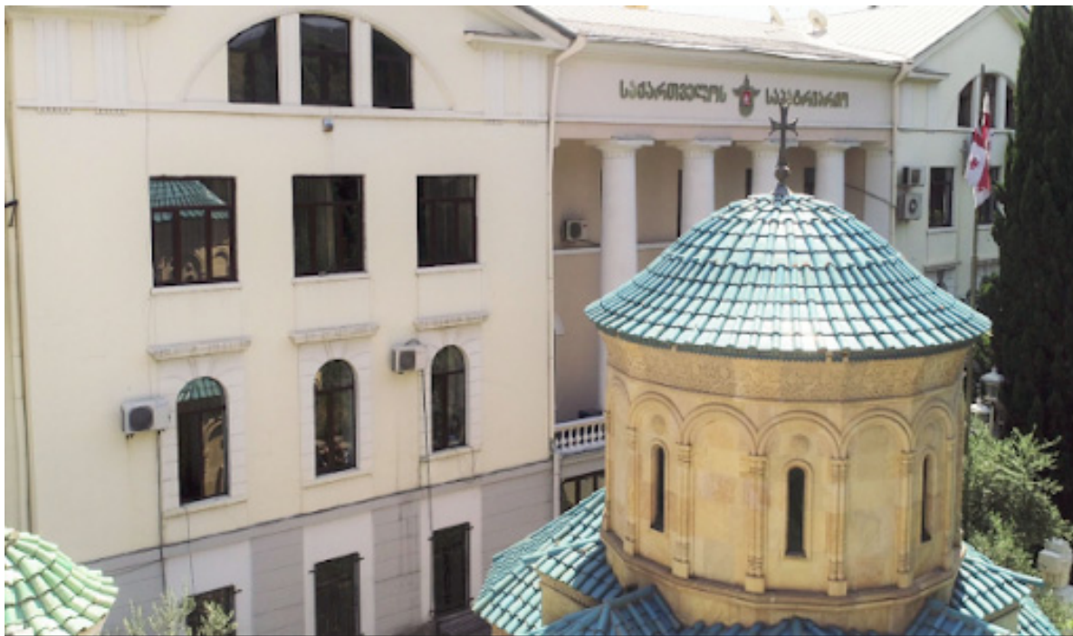
A special meeting at Patriarchate of Georgia was attended by Health Ministry representatives, as well as members of Holy Synod and international partners of Georgia

She talked about this after a special meeting at the Patriarchate of Georgia. According to her, every side involved in the talks, including the Patriarchate, the Ministry, as well as international partners said that the interests of the children are of