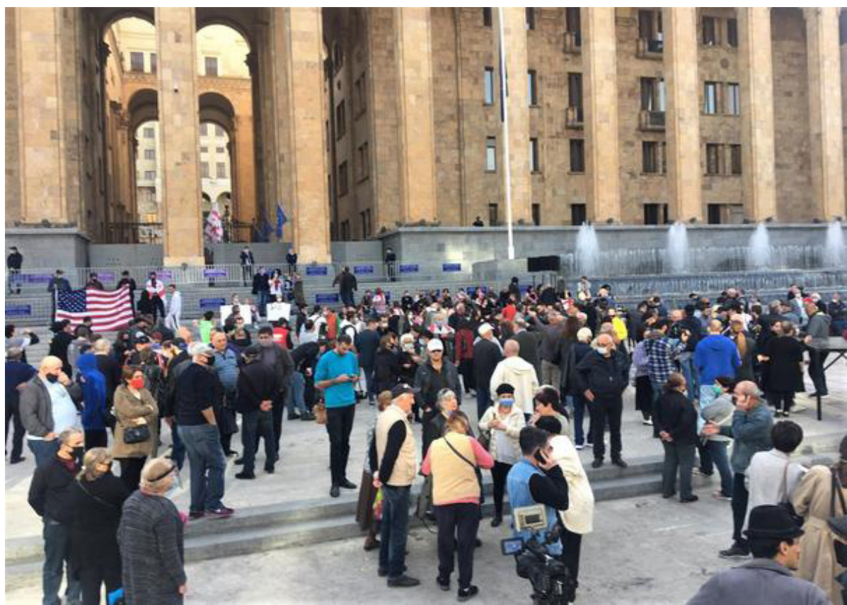
Another rally was held in front of Parliament organized by civil society

The scandal around the Ninotsminda boarding schools erupted after the representatives