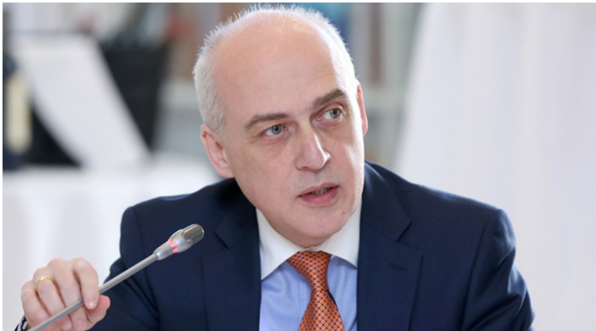
According to Foreign Affairs Minister of Georgia, Davit Zalkaliani, Georgia being on the agenda of the summit is very important