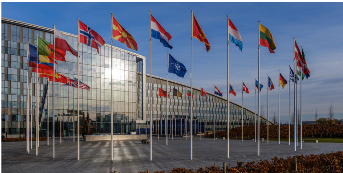
PM Garibashvili says that Georgia expects that the steps taken by the country will be properly assessed and appreciated during the summit

In parallel with the Brussels Summit, on June 14, the Prime Minister of Georgia Irakli Garibashvili will take part in the Brussels Forum - a panel called - Investing in resilience, where he will discuss hybrid threats and Georgia's experience in dealing with them. In addition, the meeting will also emphasize the need for consolidated efforts and support from international partners to address these threats.