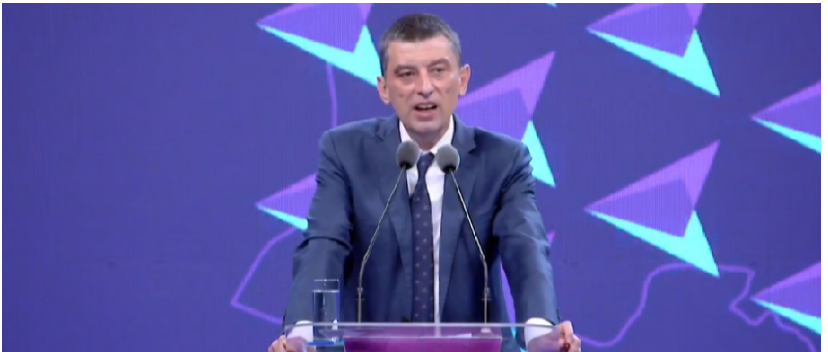
► Gakharia presented his party, For Georgia, on May 29.

Gakharia left his position on May 18. At the time, the former PM said that the decision was made because of the difference in opinion between him and the team about the case of Nika Melia, the chairman of the United National Movement. After presenting For Georgia, Gakharia told reported that Melia should have been arrested, however, the problem was the form of the arrest.