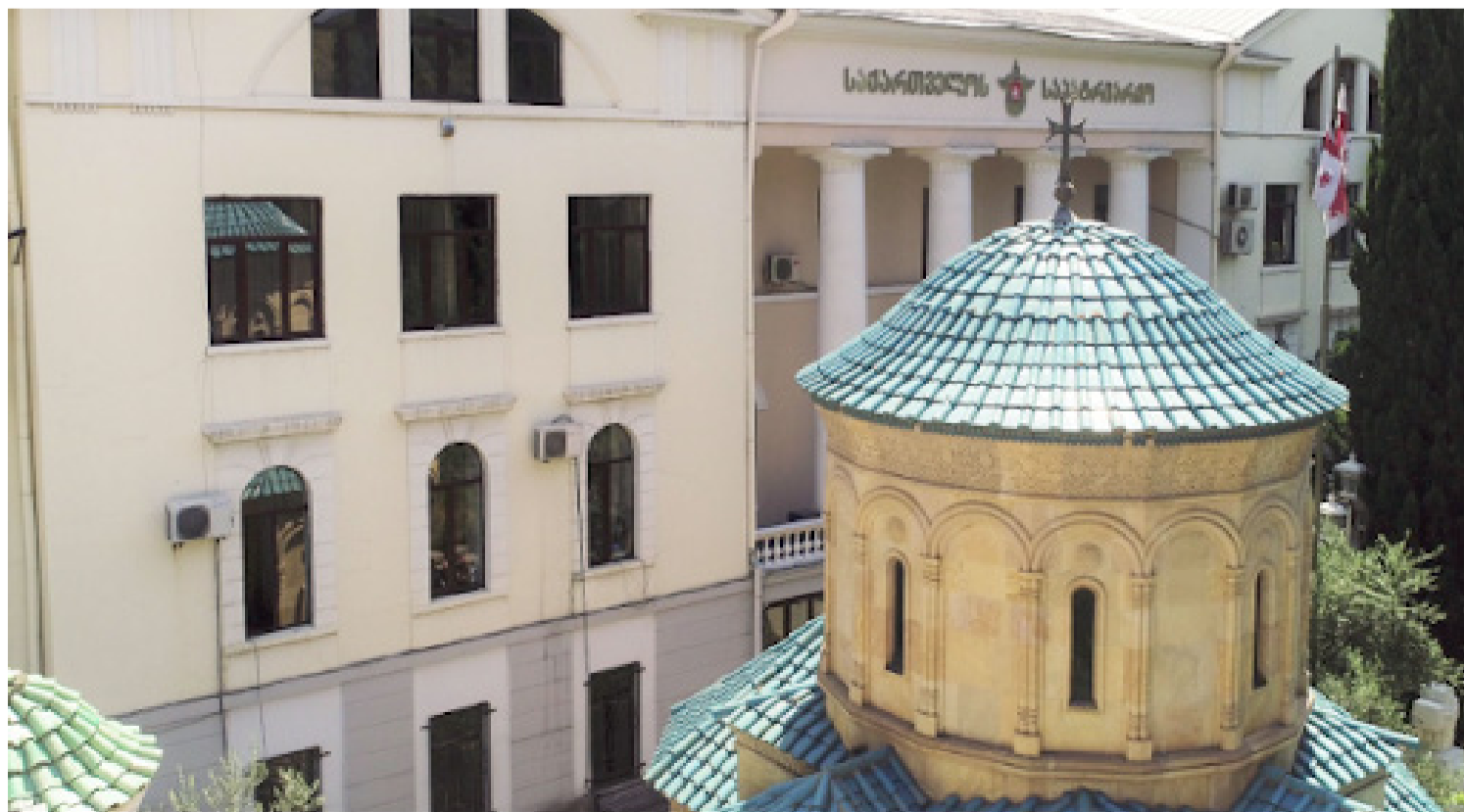
► Tbilisi City Court has decided to remove children with disabilities from the Ninotsminda boarding school on June 5

The situation escalated on April 15, when the representatives of the Public Defender of Georgia were denied entry into the boarding school after several beneficiaries spoke about the physical, psychological as well as sexual violence taking place in the Ninotsminda boarding school.