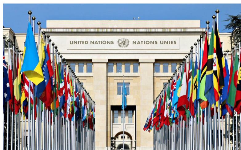
► The United Nations General Assembly has declared the years 2021 through 2030 the UN Decade on Ecosystem Restoration.

The United Nations General Assembly has declared the years 2021 through 2030 the UN Decade on Ecosystem Restoration. This theme underlines the urgency of action needed to address multiple harms to the natural environment mainly caused by human activity.