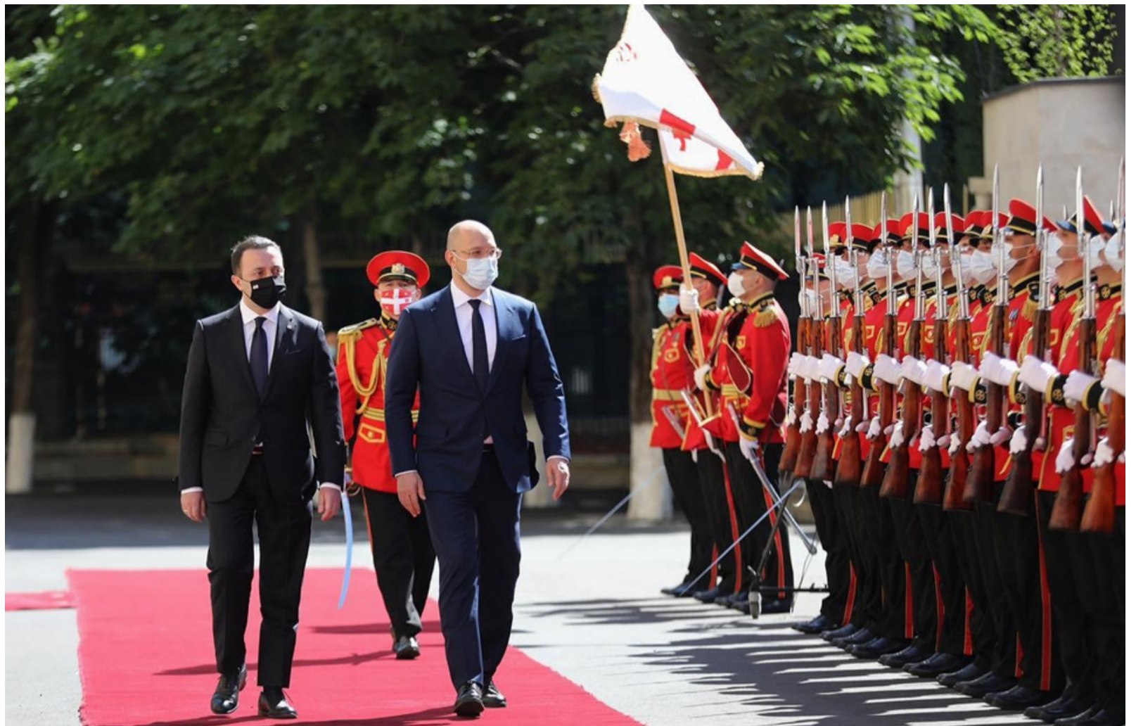
► The 10th session of the Georgian-Ukrainian Joint Economic Cooperation Commission will be held at the end of the year.

The sides discussed the main directions of bilateral cooperation between Georgia and Ukraine. It was noted that trade and economic relations between the two countries are expanding, and to further increase trade turnover, it is important to make full use of the potential for economic cooperation. The importance of strengthening ties in the field of tourism and transport was also stressed. Ukrainian PM stated that the relations between the peoples of Ukraine and Georgia are gaining more momentum, which is an important signal for business and citizens of the two countries.