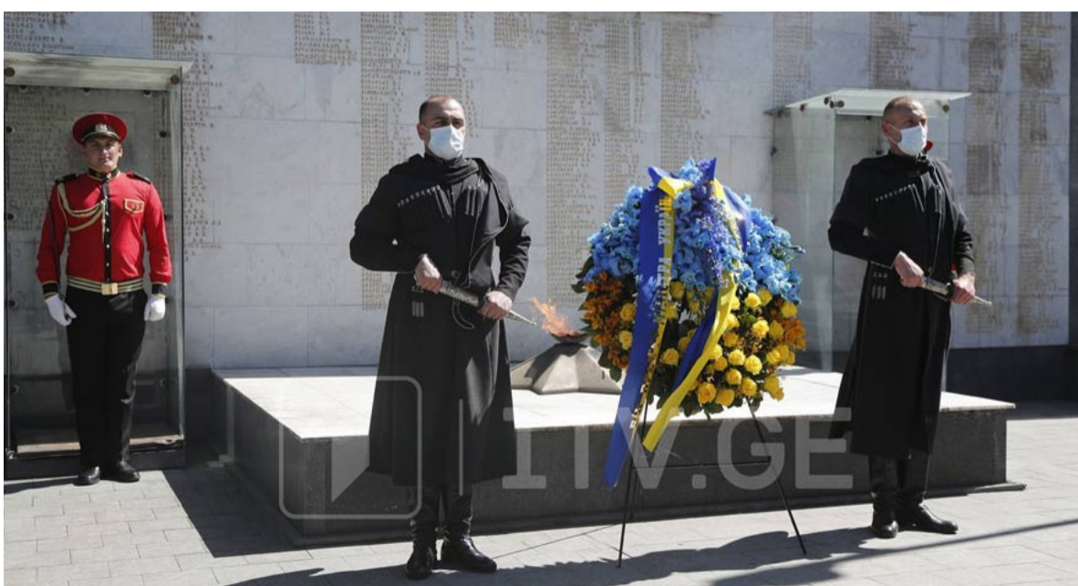
► Ukrainian delegation honored the memory of the heroes who died for the unity of Georgia and laid a wreath at the memorial on Heroes’ Square.

“I am convinced that the entry of our countries into the European Union and NATO is only a matter of time,” Ukrainian PM said.