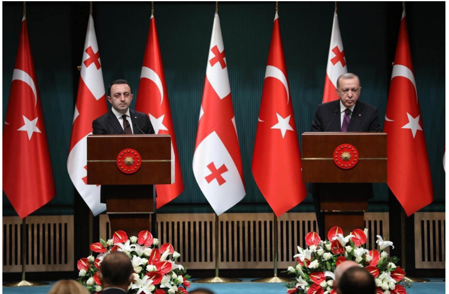
"Turkey sees Georgia as the key to regional cooperation," Erdogan announced.

Turkish president also underscored that in the field of energy, as well as in all other spheres, Turkish investments have been made in Georgia, the volume of which is $214 million. "We have implemented great, important projects with Georgia, which completely changes the face of the region. One such strategic project is the Southern Gas Corridor, on which we have created this platform.