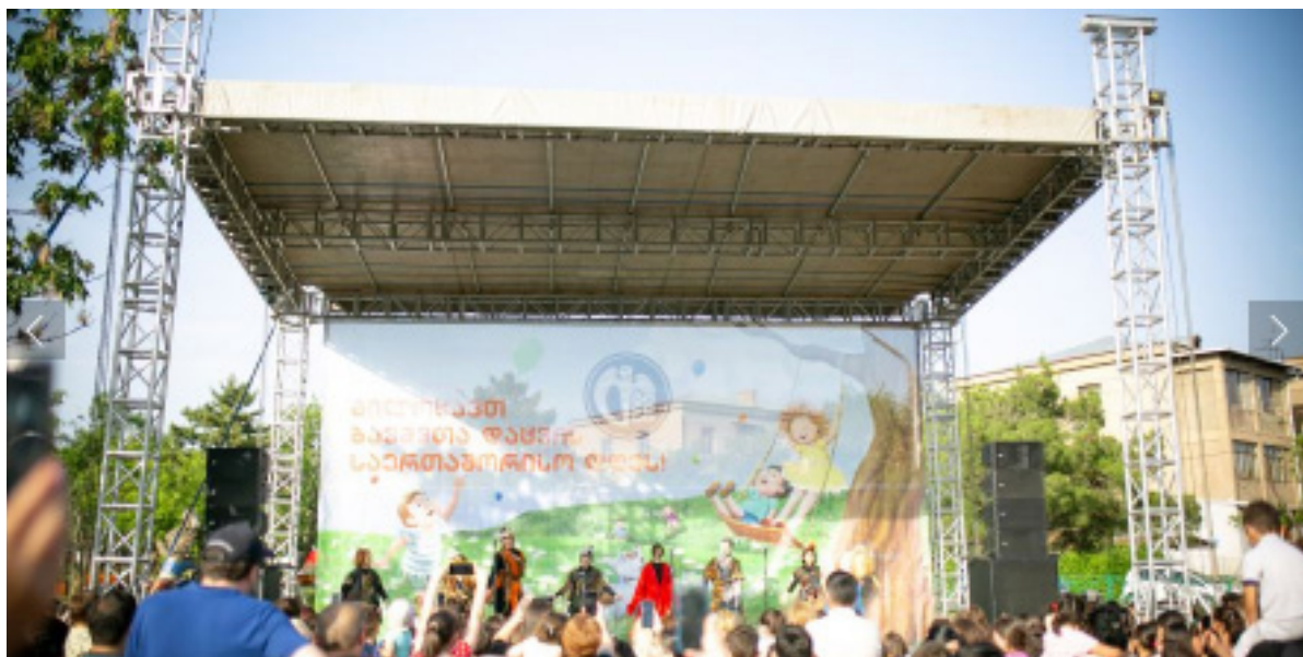
City hall organized a special event for children in Mziuri Park.