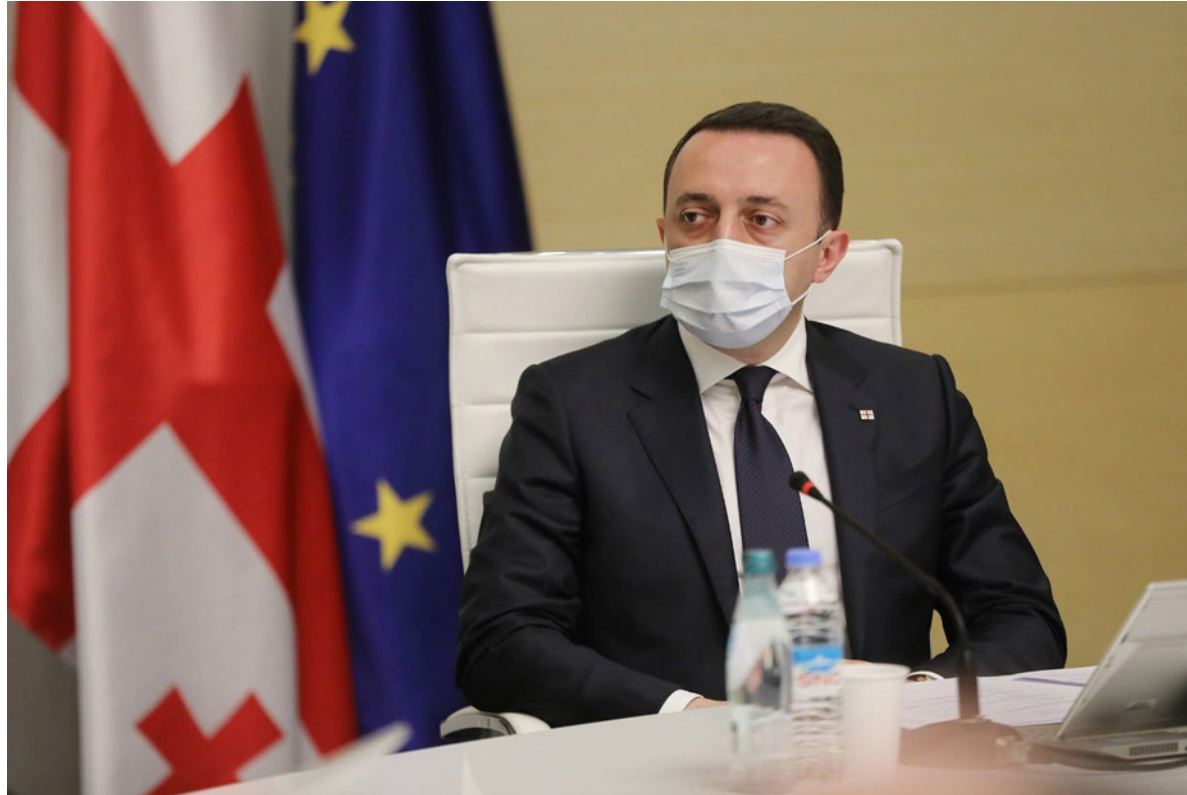
► "April's economic growth is the result of the right policy of the government, there are very positive attitudes and expectations in business," PM said.

Executive Director of Geostat emphasized that compared to the previous year, there was an upward trend in all respects - "There was growth in construction, metallurgy was activated, the production of construction materials and cement has increased, the output of the financial and insurance sectors also increased (51%), trade became more active, Auto imports have grown by 86% compared to the previous year, and re-exports have increased 6 times, which