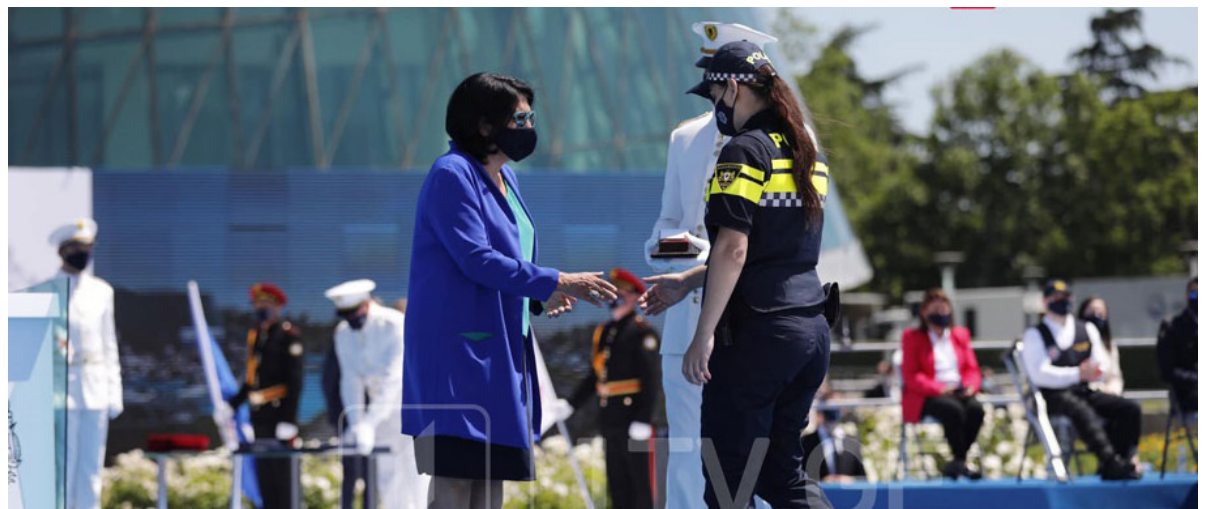
President Salome Zourabichvili awarded three female police officers for their efforts to fight against domestic violence.