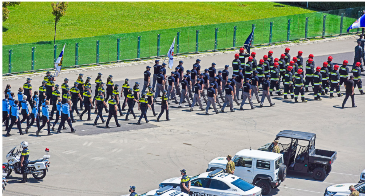
Units of the Ministry of Internal Affairs performed solemn marching at the event dedicated to the professional day of the police.

On behalf of Georgian police, the Interior Minister expressed gratitude to the international partners for their contribution to the capacity building of the Ministry. Gomelauri noted that for the successful implementation of visa-free travel with the EU, the cooperation with the European Border and