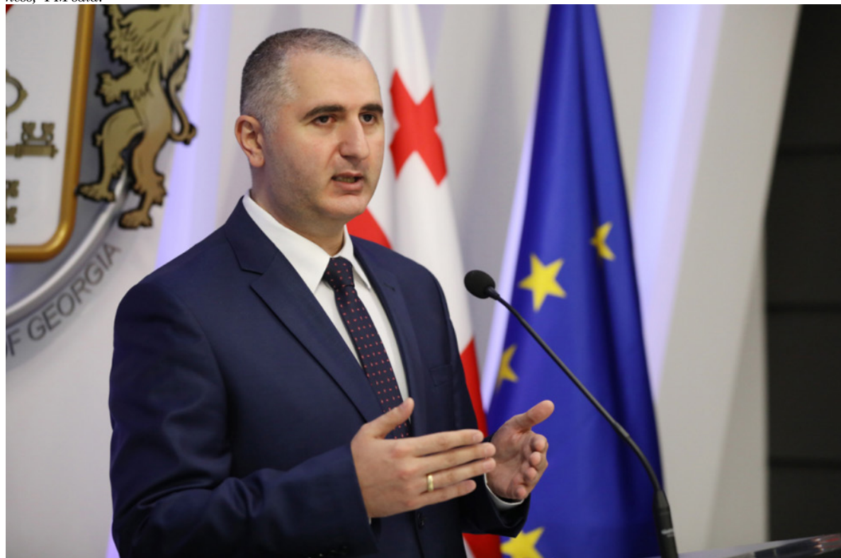
► The updated forecast will improve the current account deficit and the dynamics of government debt reduction will be faster.