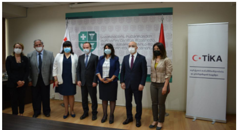
There are numerous training and workshops planned