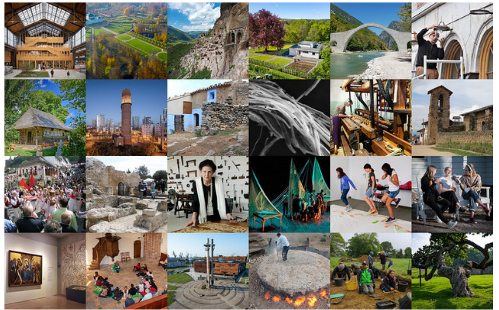
In 2021, the European Leading Award was given to 24 projects from 18 European countries in seven different nominations.

According to Europa Nostra, the successful pilot project which has formed the basis of the Rock Cut Heritage Safeguard