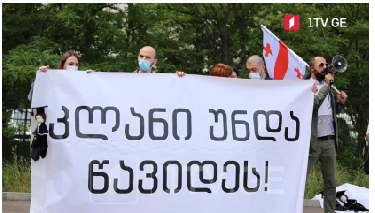
The conference of judges took place against the background of a protest demanding the postponement of the voting. "The clan must leave," reads the banner.

The conference of judges took place against the background of a protest rally held at the Supreme School of Justice. Protesters were demanding the postponement of the voting as they claim the government intends to 'strengthen the clan'. Opposition MPs, as well as Ambassadors, have urged to halt the election of High Council of Justice members and judges of the Supreme Court before the implementation of large-scale judicial reforms as considered with the EU-mediated agreement signed in April 2021. Opposition MPs have stated that the High Council of Justice, which selects and ap-