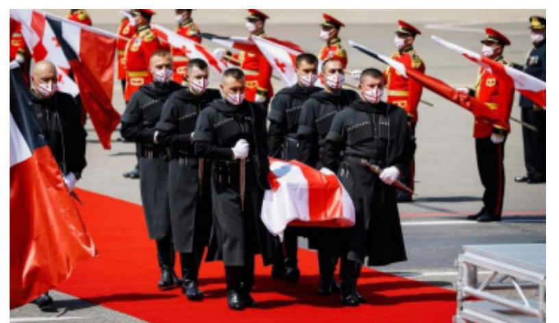
Kvinitadze's remains were laid to rest at the cemetery next to those of Kakutsa Cholokashvili - Deputy Defence Minister of the 1918-1921 Georgian republic - after a public funeral ceremony was held at the Holy Trinity Cathedral and a ceremonial flyover by Georgian Defence Forces' aircraft over the Freedom Square.

Dozens of foreign states and leaders have congratulated Georgia on its 30th anniversary of independence. The list includes the US and European top leaders, France, China, Poland, Czech Republic, Bulgaria, Iran, Kyrgyzstan, Moldova, the United Arab Emirates and other foreign states.