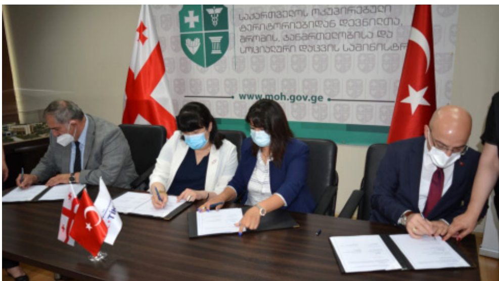
The memorandum was signed between the Ministry of Internally Displaced Persons from the Occupied Territories, Labor, Health and Social Affairs of Georgia, the Georgian Association of Transplantologists, and TIKA

Within the framework of the Memorandum of Understanding, in cooperation with the Ministry and with the support of the Turkish International Cooperation and Development Agency (TIKA), Turkish and Georgian colleagues will start working together on topics such as curriculum refinement, internships with specialist centers/clinics and other specialist organizations. Implementation of educational programs, the establishment of a national coordination system, and so on.