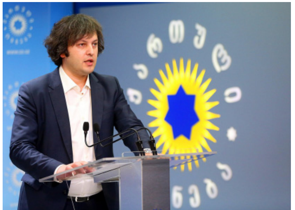
Kobakhidze accused former Prime Minister Gakharia of lying while talking with reporters

Soon after resigning, Gakharia said that he had no intention of quitting politics, and announced that he would be coming back soon. As of now, his plans remain unknown.