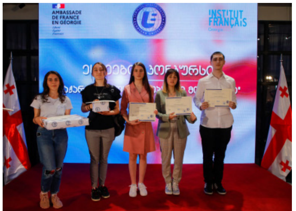
The competition was organized by the European University and the Embassy of France in Georgia