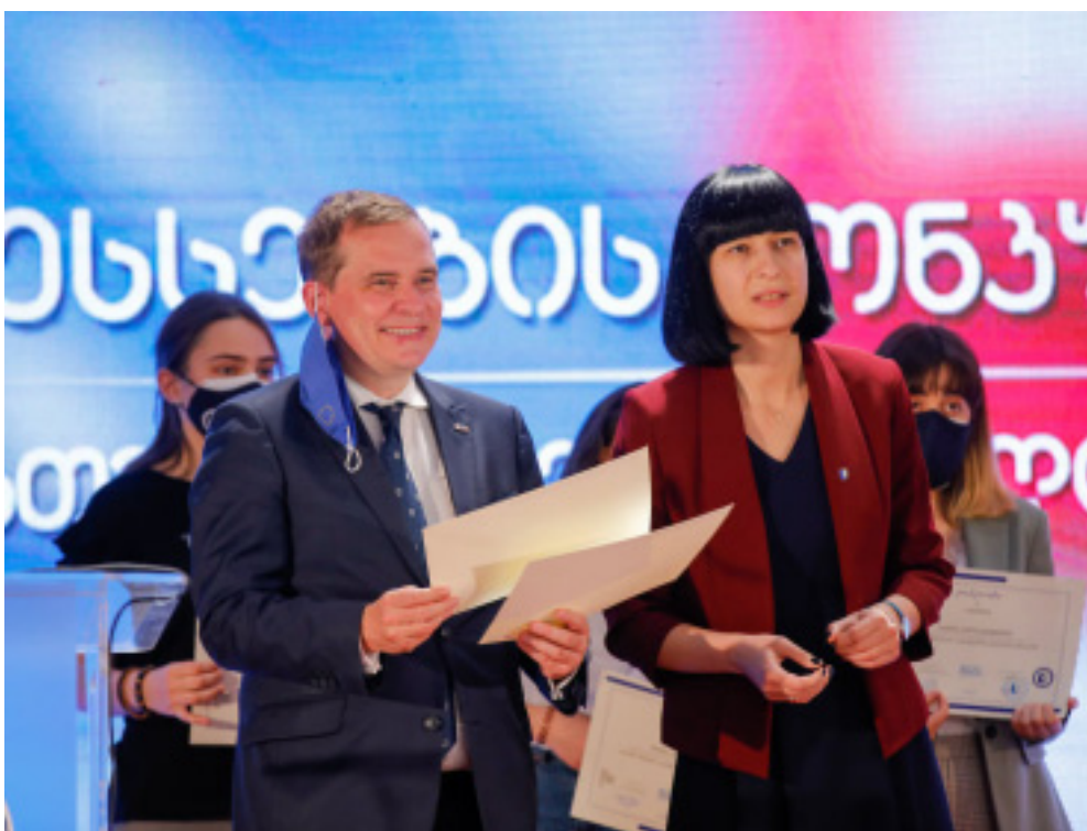
Ceremony was held at the European University in Tbilisi