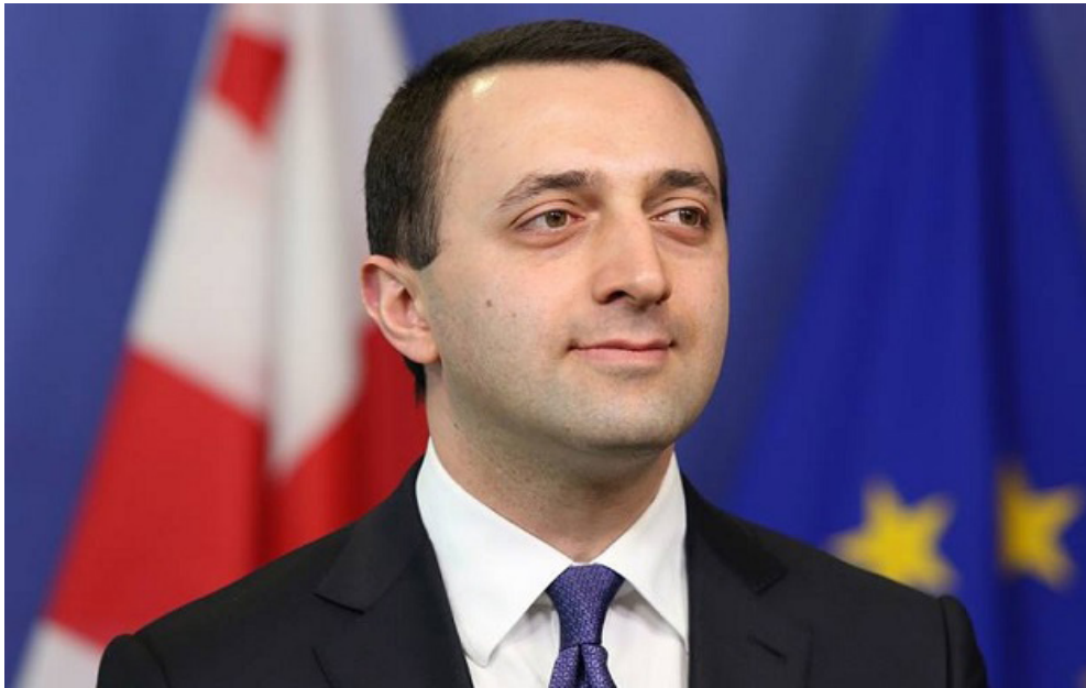
PM Garibashvili said that they discussed the ongoing events in the country and the upcoming elections