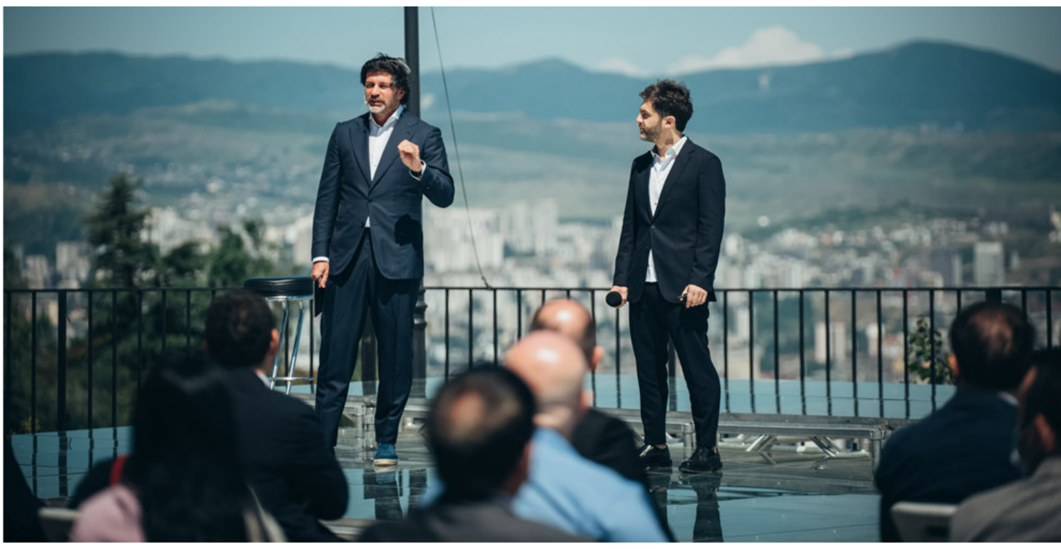
Tbilisi Mayor Kakha Kaladze, who is also the General Secretary of the Georgian Dream party, has not yet informed the public on whether he will run for a second term in the autumn self-government elections.

Kaladze also spoke about the environmental challenges and noted that the maintenance and development of green spaces in the city is one of the main priorities for the municipal government. According to Kaladze, as a result of the efforts made by the government of the