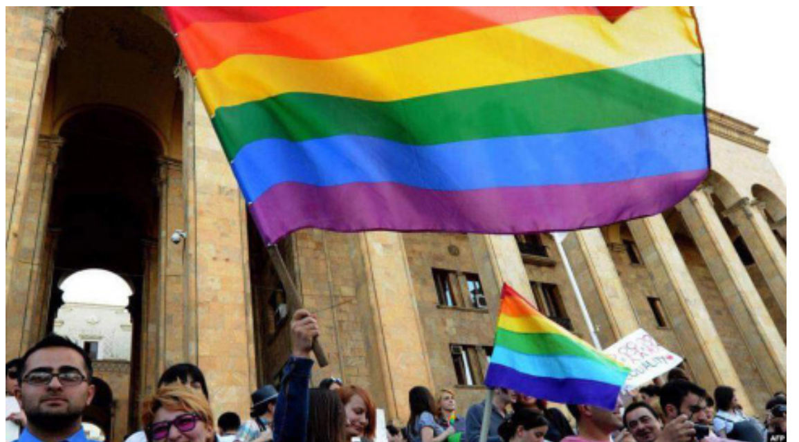
The signatory parties agree to use all available means to eradicate discrimination and violence.