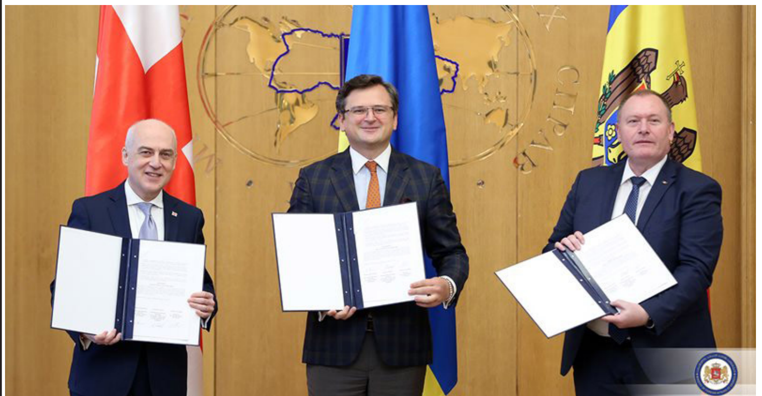
The memorandum aims to further strengthen cooperation between the three countries for common European goals and EU membership.