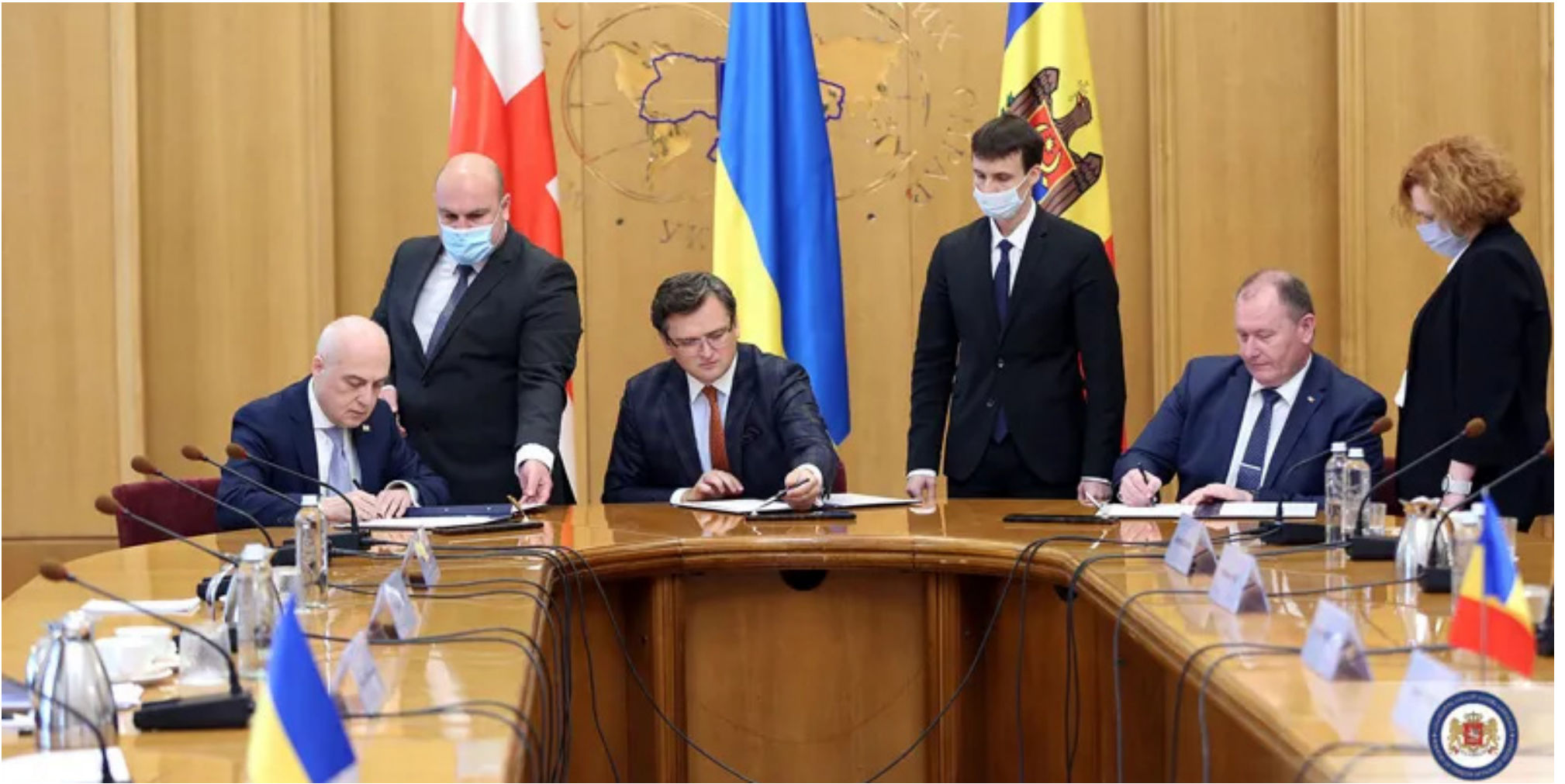
Foreign Ministers of Georgia David Zalkaliani, Ukraine Dmitry Kuleba and Moldova Aureliu Chokoy signing the memorandum on establishing Associated Trio.