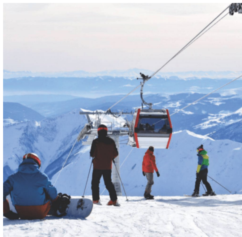
► Free seasonal tickets for mountain lifts issued to employees and their VIPs is problematic, according to the Audit Office.

According to the audit report, the company signed contracts for projects worth €159 million while there were no construction permits issued for these projects. The audit states it is problematic when a state-owned company carries out unauthorized construction. According to the conclusion, the construction