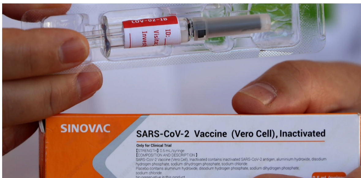
► Georgia is also awaiting other vaccines, including additional doses of AstraZeneca

As of today, Georgia is vaccinating the Georgian population with two vaccines - Pfizer and AstraZeneca. Recently, registration was opened for Sinopharm for anyone above 18. The Georgian population will start receiving the Sinopharm vaccine starting on May 4. As