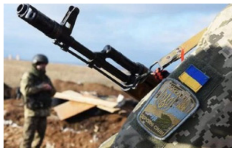
In April, demonstrations by pro-Russian groups in the Donbas area of Ukraine escalated into a war between the Ukrainian government and the Russian-backed separatist forces of the self-declared Donetsk and Luhansk People's Republics.