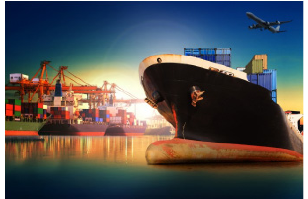
In the first quarter of 2021, Georgia purchased goods worth $ 1.9 billion from around the world.

In the first quarter of 2021, copper ores and concentrates ranked first in the top 10 exports of commodity groups with $