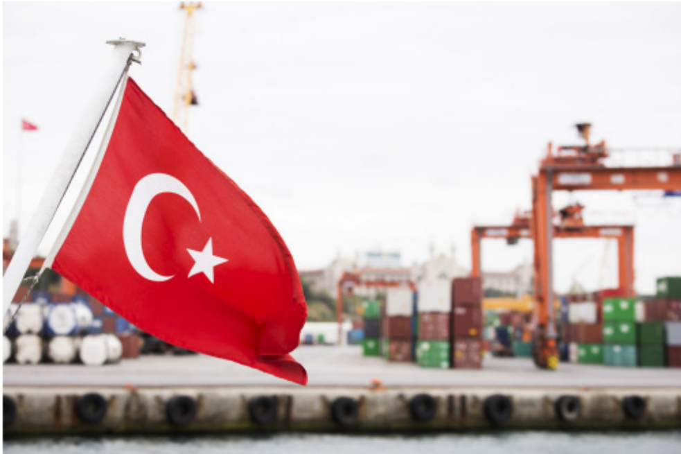
In January-March, the share of EU in Georgian Exports was 19.1%, the share of CIS countries - 44.7%.