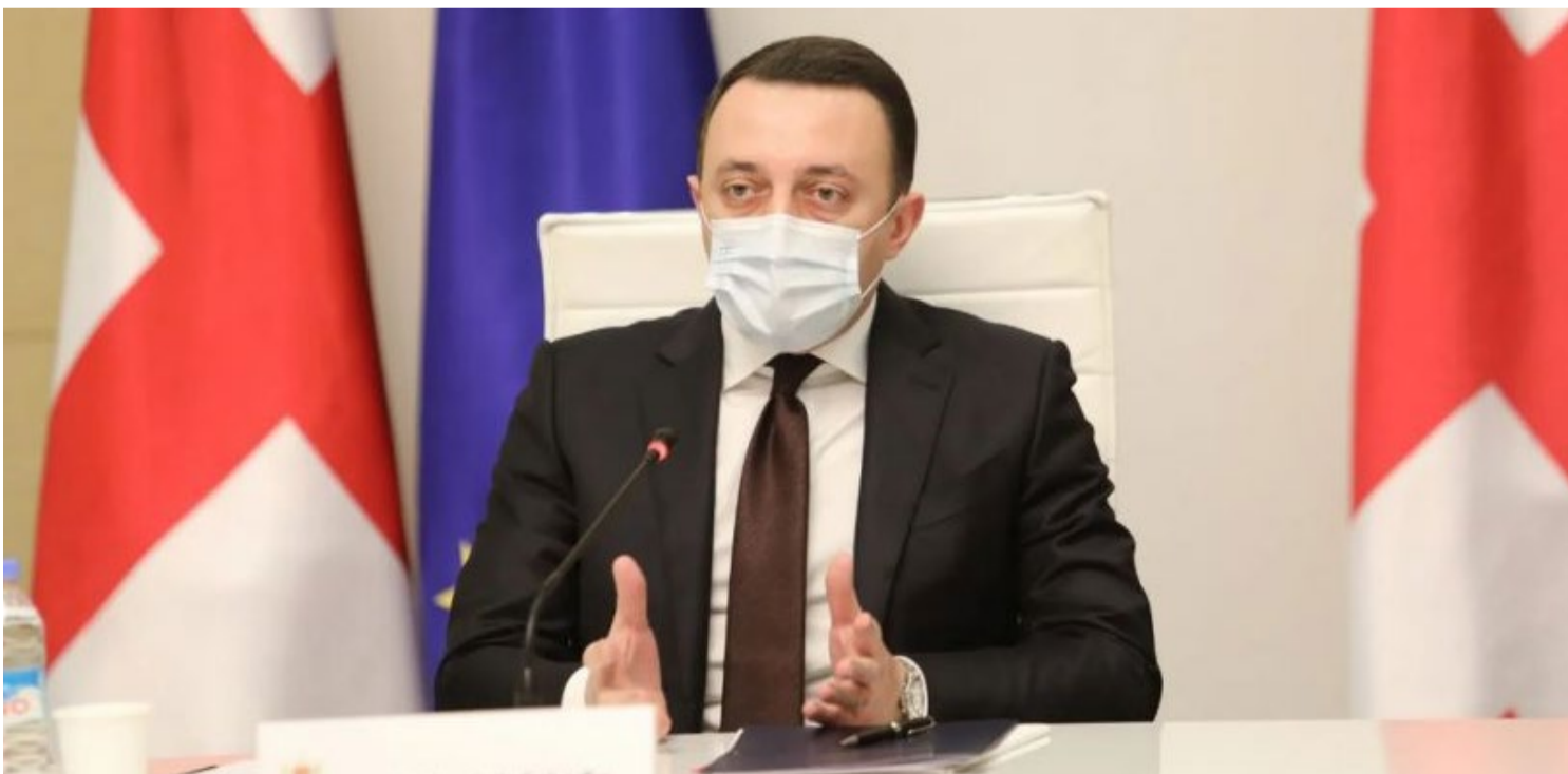
►► Georgian PM Gharibashvili said that everything should be done to avoid the third wave of Covid-19 in the country

761 new cases of Covid-19 were confirmed yesterday which takes the total confirmed cases in the country to 286,406.