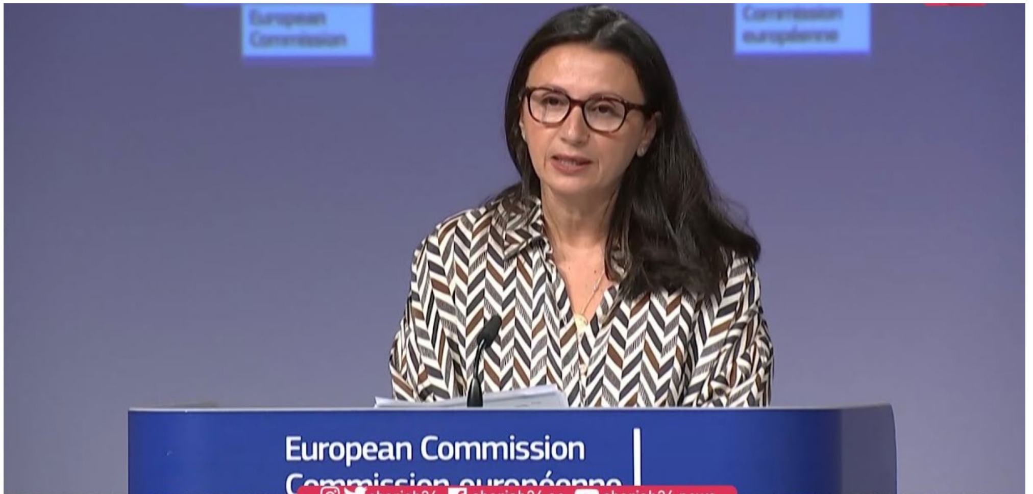
► The European Union's External Action Service decried Georgia's "hastily designed and adopted" changes to the selection process of the Supreme Court Judges.