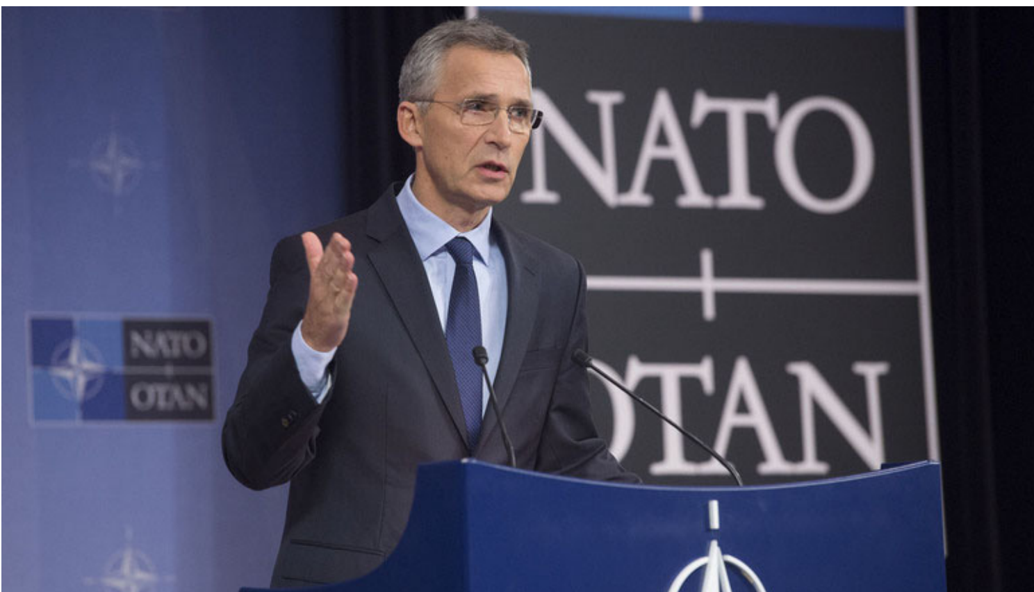
"Russia is responsible for aggressive actions against NATO-allied member states through cyber, interference in our domestic political processes, and so on," said NATO Secretary-General.

According to NATO Secretary-General, Russia is violating international law and is acting aggressively towards its neighbors, Georgia and Ukraine. Stoltenberg stressed that the relationship between NATO and Russia has been difficult for some time now, which is a result of "Russia's behavior, violating international law, using military force against neighbors – Georgia and Ukraine." He emphasized that Russia and the Russian president are responsible for the aggressive actions against NATO-allied member states through cyber interference in NATO's domestic political processes.