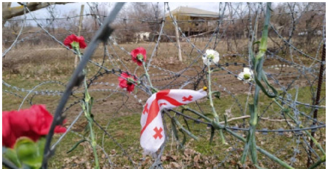
Only several relatives were allowed by the occupation forces to cross the occupation line and attend the burial of Data Papa.