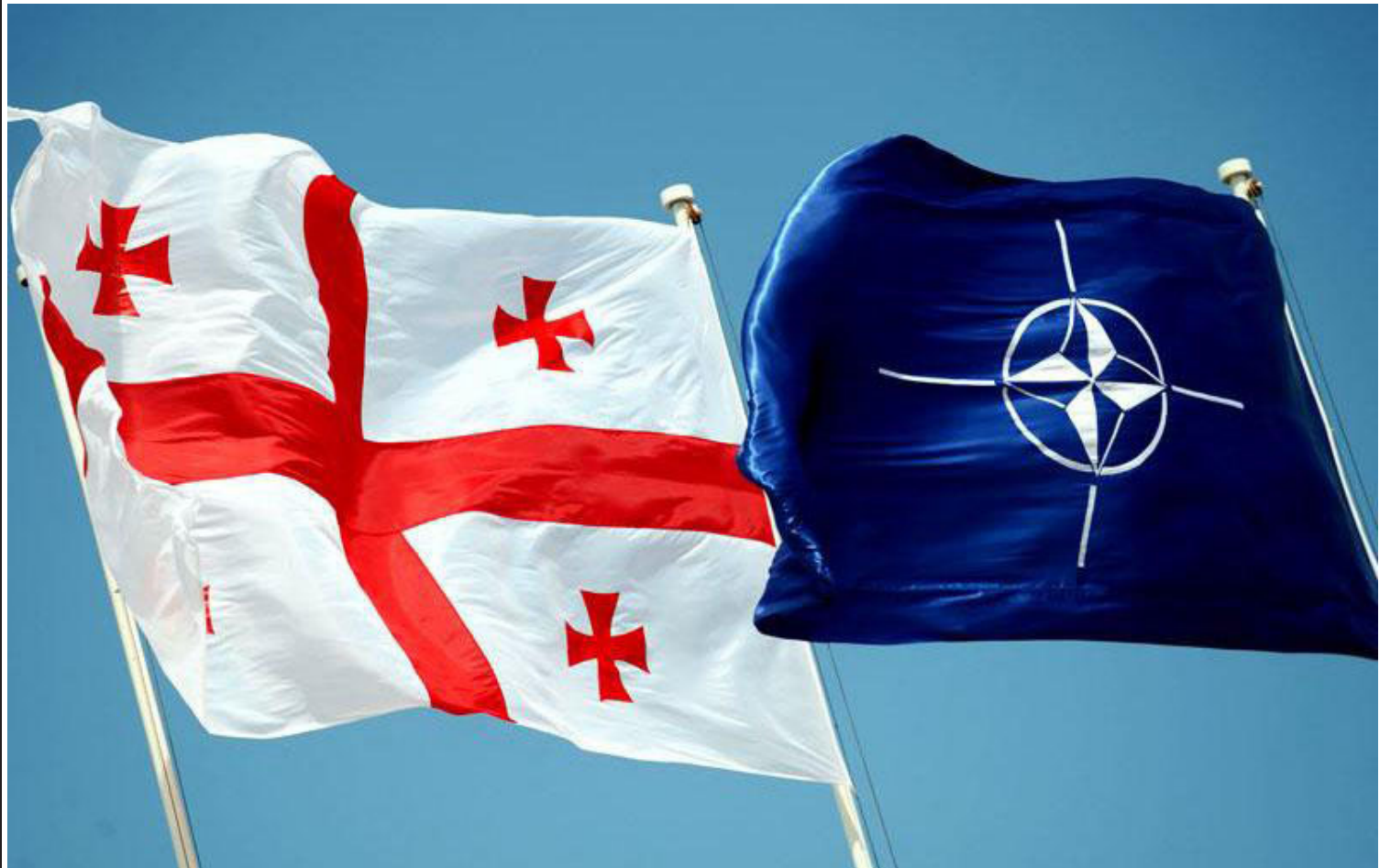
NATO Sec-Gen Jens Stoltenberg stated that NATO remains committed to supporting Georgia's aspirations to join the Alliance.