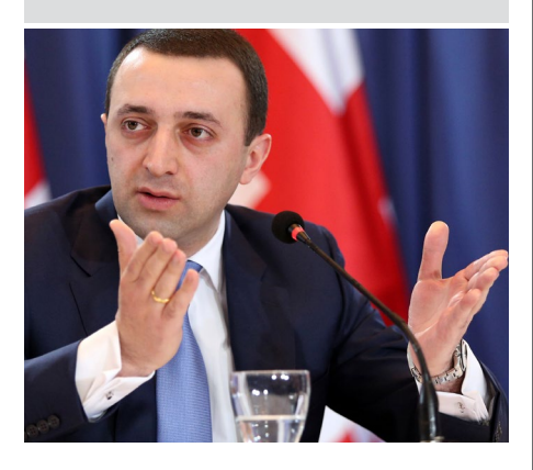
FULL STORY ON Page 2

PM Garibashvili urges all sides to come to the agreement as soon as possible