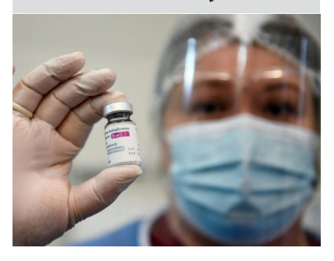
FULL STORY ON Page 3

Akhaltsikhe nurse allegedly develops anaphylactic reaction after to Covid jab