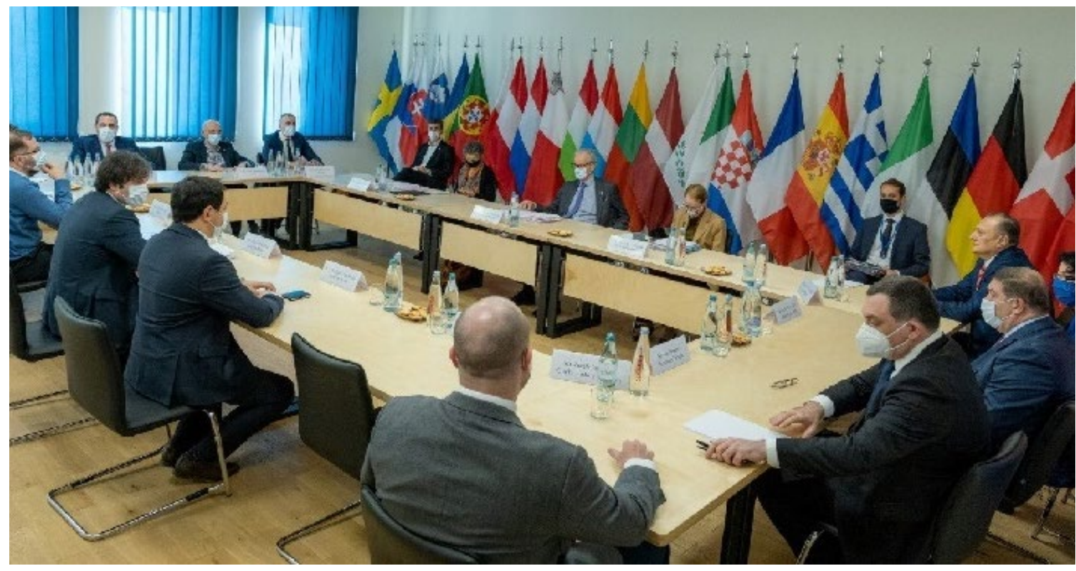
No agreement has been reached.

by the President of the European Council, Charles Michel, and include the issues of political prisoners and early elections.