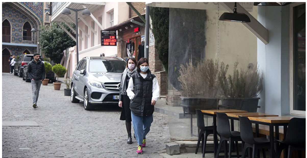
The first case of the Covid-19 was reported in the country on November 26, 2020