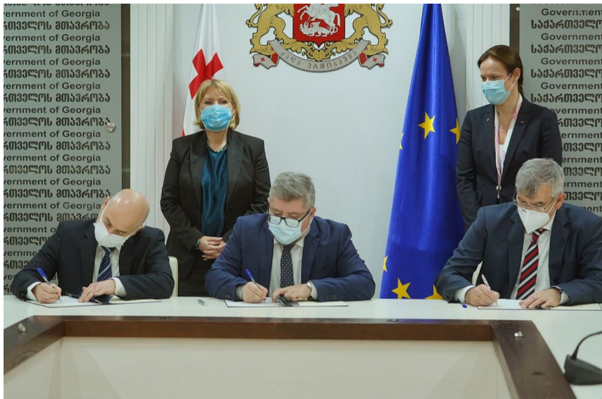
► OMV Petrom is the largest oil and gas company in Romania and the largest in Eastern Europe. In 2012, OMV PETROM, together with ExxonMobil, discovered DOMINO-1, one of the largest gas fields in Romania, on the Black Sea exploration block Neptun.

The project involves the extraction, acquisition, and processing of geological and geophysical data for oil and gas in the Black Sea Continental Shelf (area 5,282 sq. Km) for a period of 25 years. The company that won the tender will carry out 2 and 3-dimensional seismic exploration works, and at the last stage, drilling will begin. The cost of the drilling stage depends on the results of the studies. The cost of a similar project - the discovery of a domino field in Romanian territorial waters, which is con-