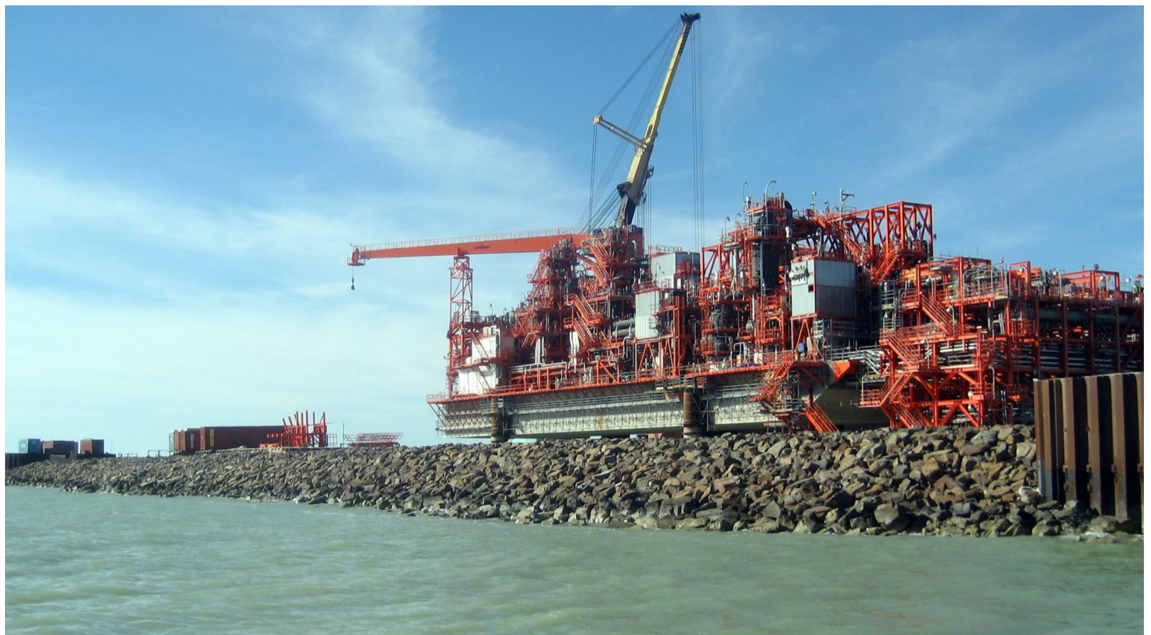
► JSC Georgian Oil and Gas Corporation, as a national oil company, partners with operator companies in planning operations and oversees and controls operations.

In Georgia, the average annual production during the last ten years is 43.6 thousand tons. In addition to the state-owned Oil and Gas Corporation, the oil will be extracted by 6 investor companies: Niotsminda Oil Company; Schlumberger Rustaveli Company (Georgia) Limited; Frontera Resources Georgia; VPI Georgia; Satskhenisi Georgia; Norio Gorge Georgia.