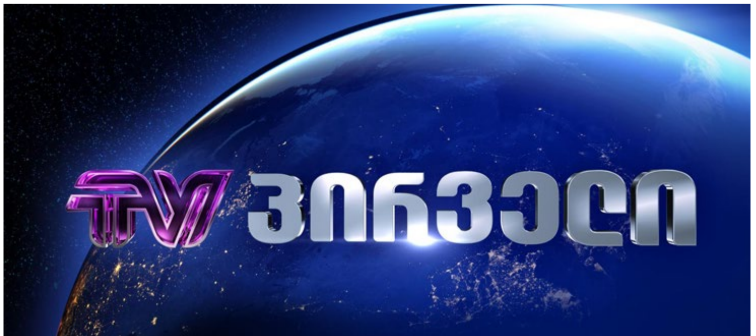
After the Court's decision people decided to gather at the TV Pirveli office and support the channel

According to the Prosecutor's Office, as part of the ongoing investigation into the case, all necessary investigative and procedural actions will be carried out to determine the legality of obtaining and distributing the record.