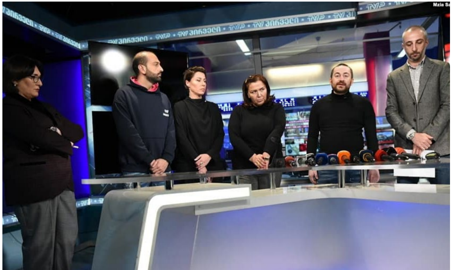
Representatives of TV Pirveli say this is a direct attack on them.