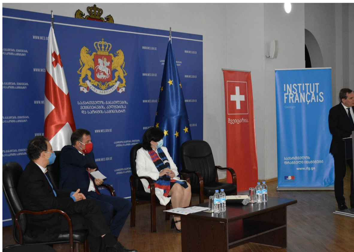
March 20 is International Francophonie Day and is celebrated around the world