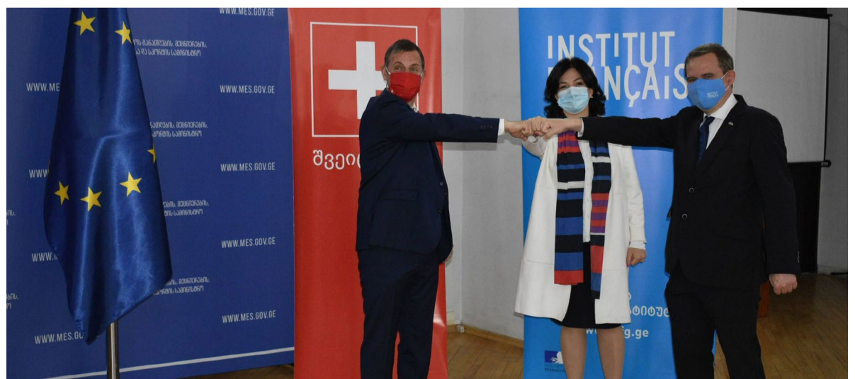
► The month of Francophonie allows encourages further discovery of the French culture

Francophonie 2021 traditionally hosts competitions for pupils and students with a variety of prizes for winners.