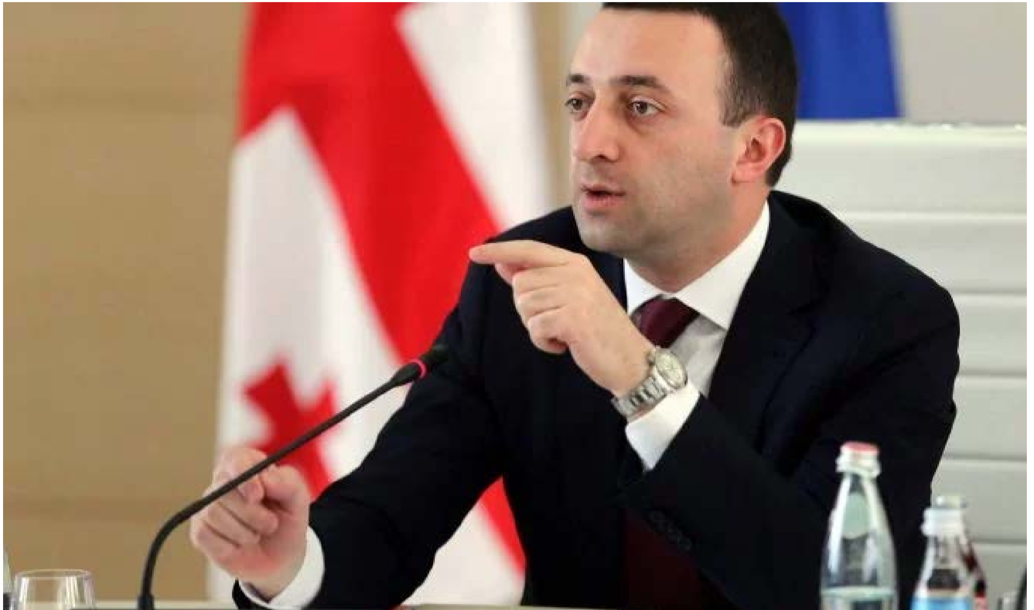
► Irakli Gharibashvili served as the Georgian PM between November 2013 and December 2015.