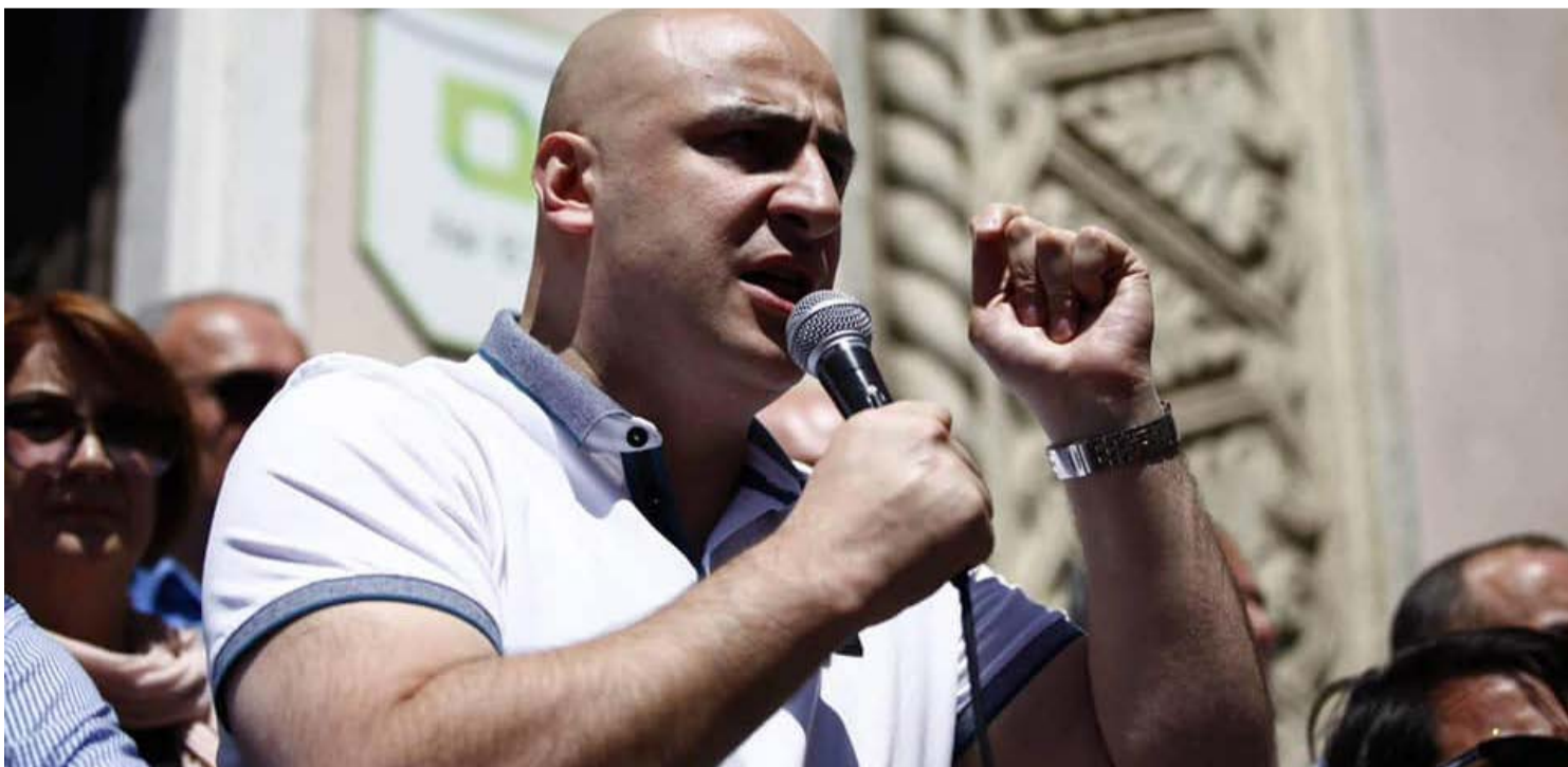
► Melia noted that Gakharia's decision means that he is admitting that the government of the country is ready for 'bloodshed and violence'.

The Parliament has to choose a new Prime Minister and cabinet in two weeks, if they fail to do so, in four weeks, the President will be able to break up the parliament and call for snap elections.