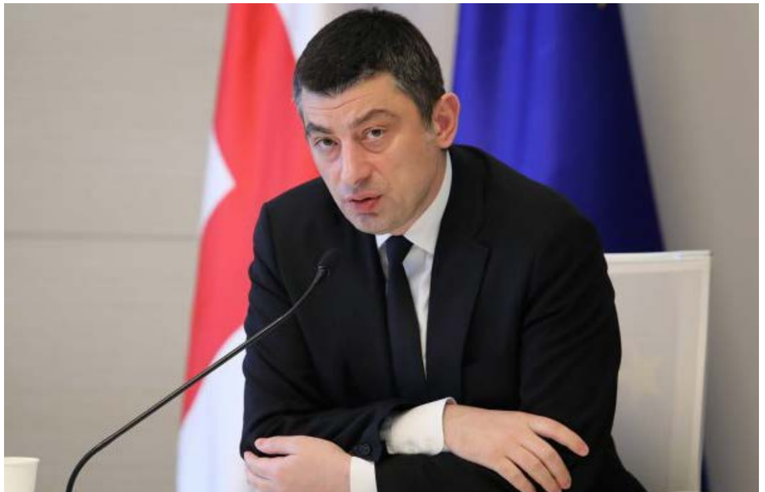
► Giorgi Gakharia has resigned as the Prime Minister of the country

FORMER PM RESIGNED OVER THE ISSUE OF MELIA'S SENTENCING.