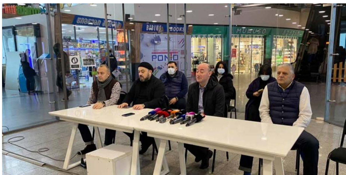
► "We request a prompt working meeting with epidemiologists, the government's economic team and experts with the direct participation of the Prime Minister to discuss and to find ways to quickly pull the country's economy out of the current crisis."

Representatives of various businesses emphasize that the epidemic situation has significantly improved with the joint efforts of doctors, businesses, government agencies and the population, and it is important