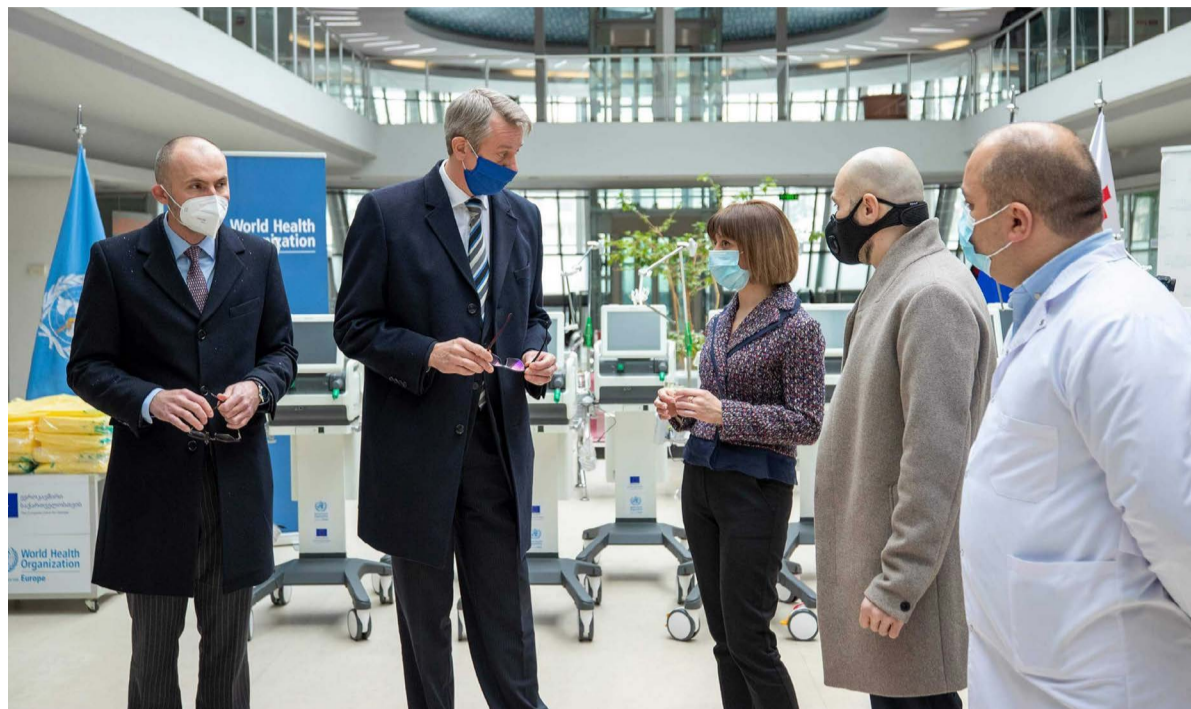
► Providing medical equipment to COVID-19 hospitals in Georgia is a part of the joint support provided by the EU and WHO.