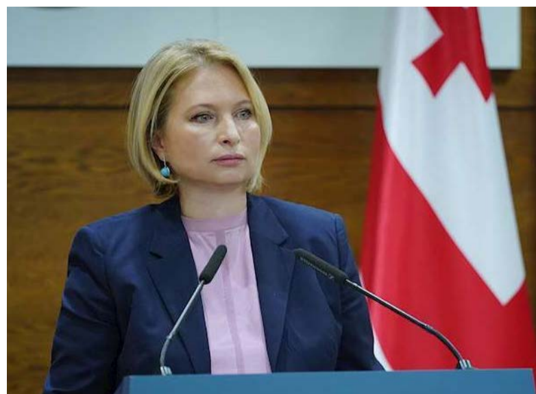
► "We understand their concerns, they want to open not only open but also indoor spaces, lifting weekend restrictions, but their first enemy is the pandemic," Turnava commented.

5. Opening of mountain resorts from 22 February. Despite the literally ending winter season, hotels and locals will be able