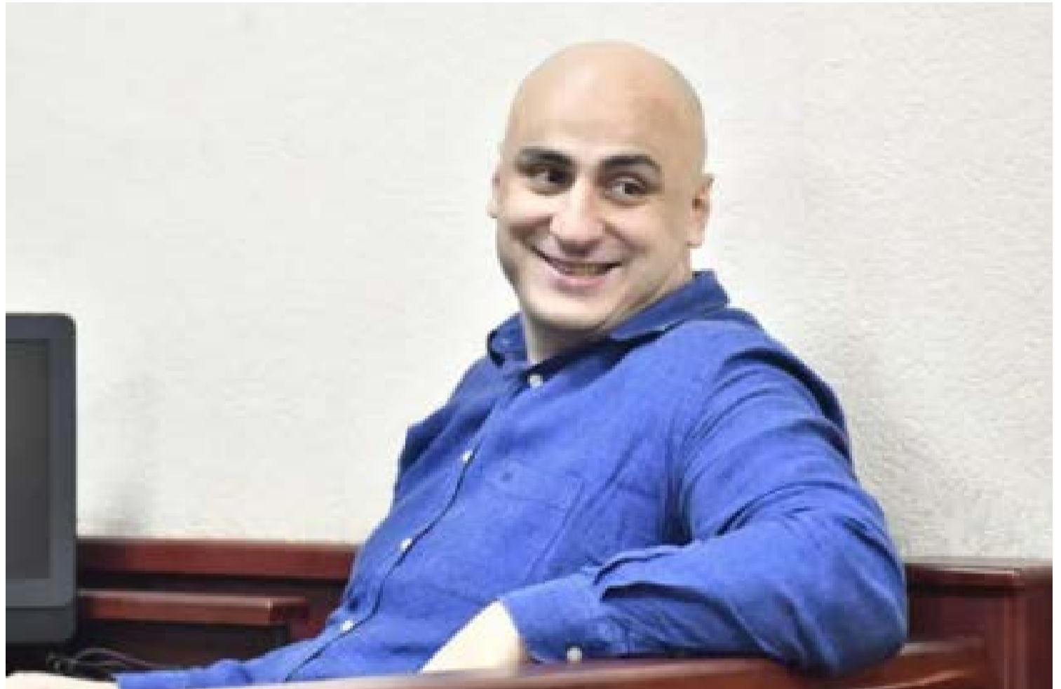
► Nika Melia, Chairman of the United National Movement, did not attend his trial and spent the night in the party office with several opposition party members and UNM supporters.