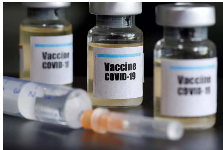
► Georgia is expecting the first doses of vaccines to be delivered at the end of February.