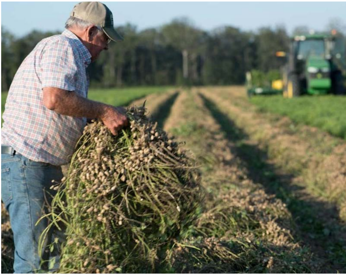
► Temporary seasonal employment is carried out within the framework of the agreement between Georgia and Germany.