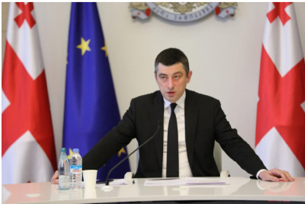
PM Gakharia wrote about the Fitch Ratings' statement on his personal Twitter account