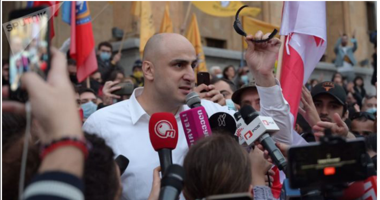
The representatives of the opposition parties plan to meet on February 15 and discuss the ongoing events together