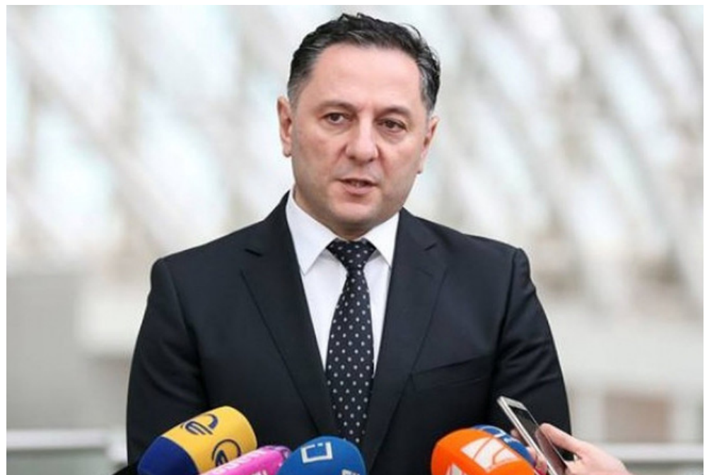
Internal Affairs Minister says everyone is equal before Law