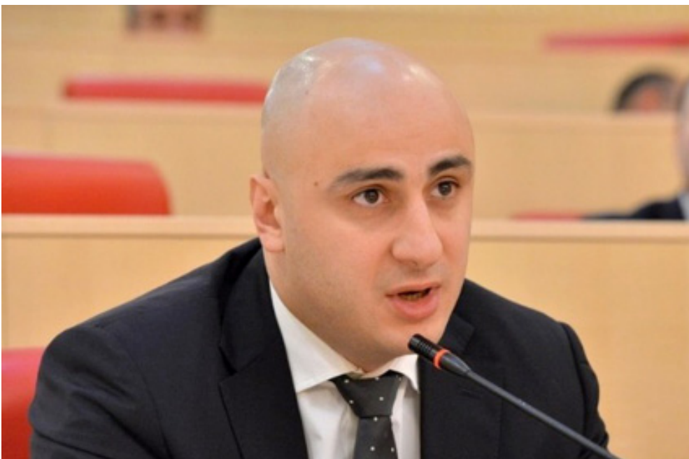
The Prosecutor's Office of Georgia appealed to the Parliament of Georgia on February 12

After that, the Prosecutor's Office appealed to the Court to increase the bail to ₾ 100,000. According to the ruling of the Tbilisi City Court of November 3, 2020, the bail previously imposed on Nika Melia was increased to ₾ 40,000 and he was given 50 days to pay the bail. Melia was also banned from crossing the state border without the prior notice and consent of the prosecution.