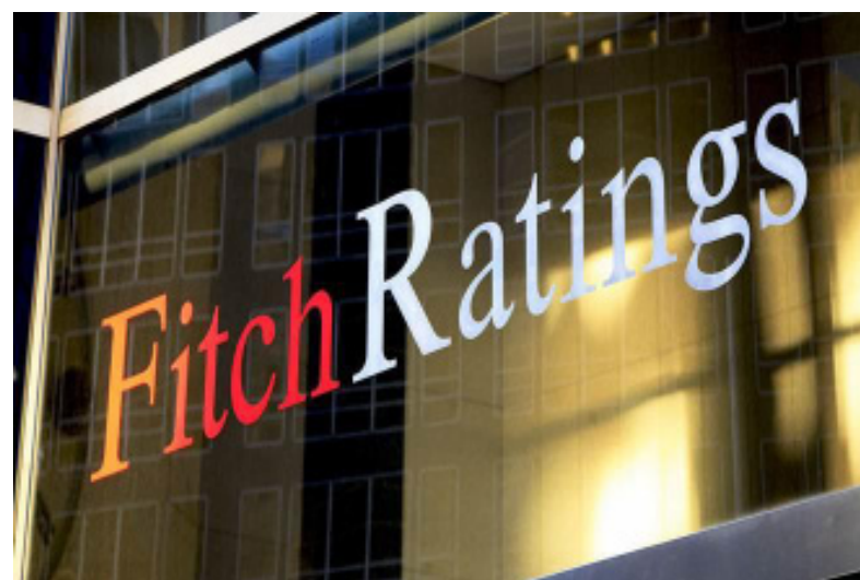
The statement reads that a consistent and credible policy framework makes the country relatively resilient to different types of shock

Fitch Ratings is an American credit rating agency and is one of the three biggest credit rating agencies, the other two being Moody's and Standard & Poor's. It is one of the three nationally recognized statistical rating organizations designated by the U.S. Securities and Exchange Commission in 1975.