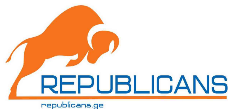
► "We are in a boycott mode, we are not going to work in this parliament and we will call this initiative voting for the future."

The Georgian Dream did not support the abolition of the mandate of 51 opposition MPs, including the Republicans, in a February 2 plenary vote. One of their demands is to call early parliamentary elections.