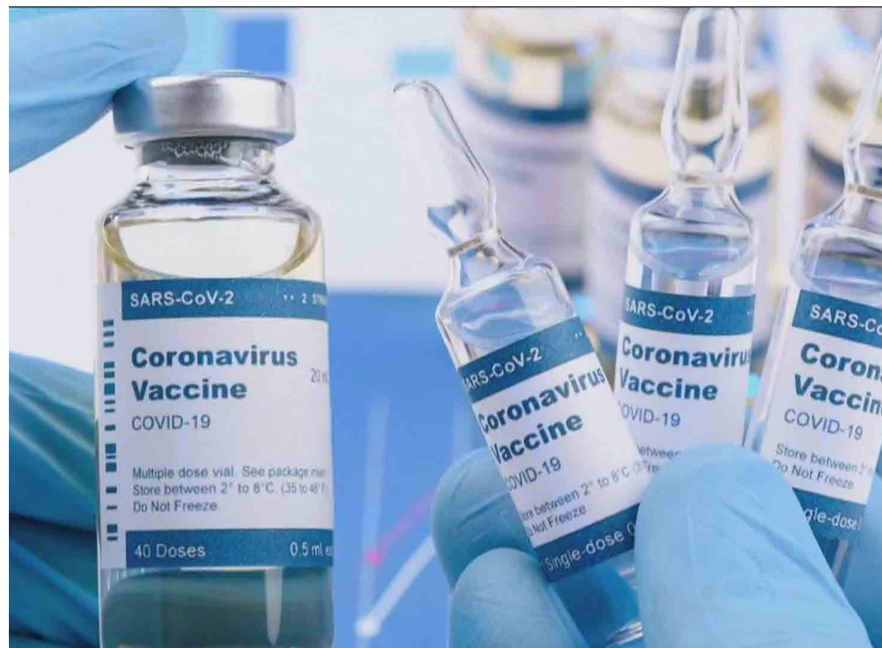
► EU Ambassador emphasized the importance of proper and efficient vaccination campaign