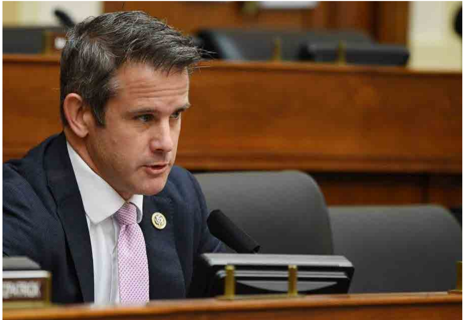
► Adam Kinzinger