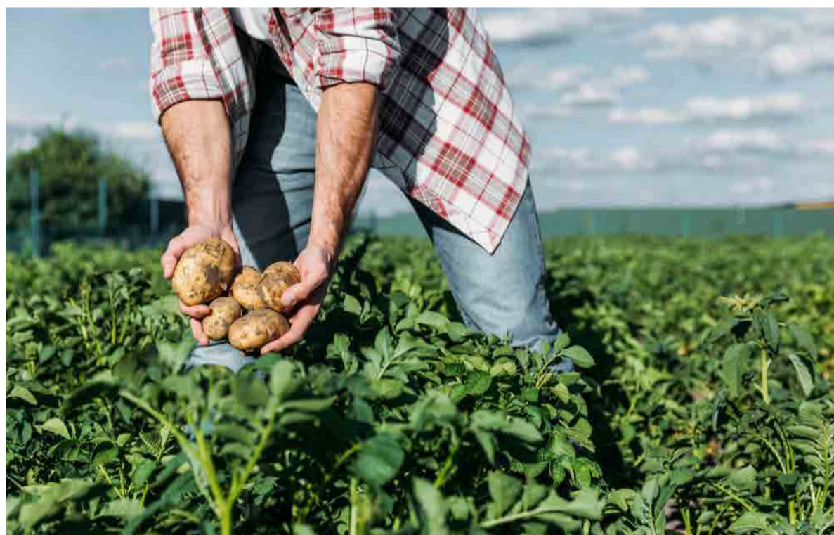
► Seasonal works will start in Germany from April 1.