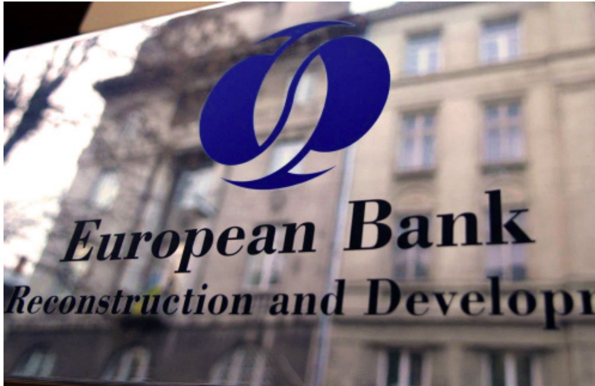
The bank supported a new record of 2,090 trade finance transactions worth €3.3 billion under its Trade Facilitation Programme

In Ukraine, the EBRD combined investment with policy engagement with a €450 million loan to the state road agency