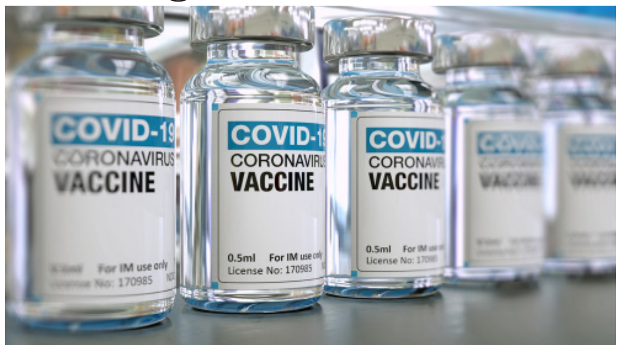
It is still unknown which vaccine will be used in Georgia

The Pfizer-BioNTech vaccine is used in the United States, the United Kingdom, Canada, and the European Union. It is also approved by the World Health Organization.