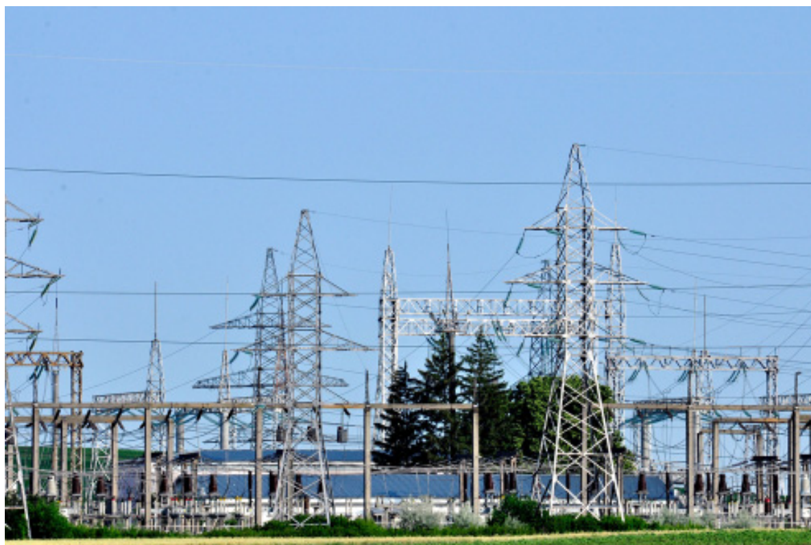
In the Caucasus, the Bank financed over US$ 400 million worth of investments in the energy sector

Ukravtodor, supporting the government in the development of national road infrastructure and the fight against corruption. The Bank's public-private partnership (PPP) advisory activities led to the commercial close of two port PPPs at Olvia and Kherson in Ukraine.