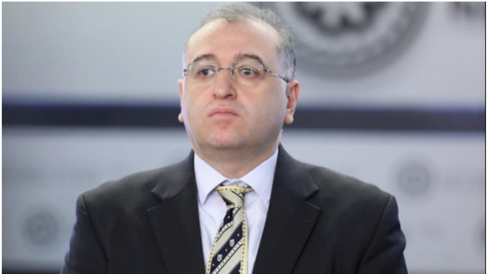
During spring, National Bank cut the capital buffers to increase the liquidity for commercial banks.

The decisions that were made by the NBG have released as much as 1.6 billion GEL to the banking sector. The sum was used by the commercial banks to create some type of reserve for future losses. During the crisis, banks will use the funds to finance the overlooked debts.