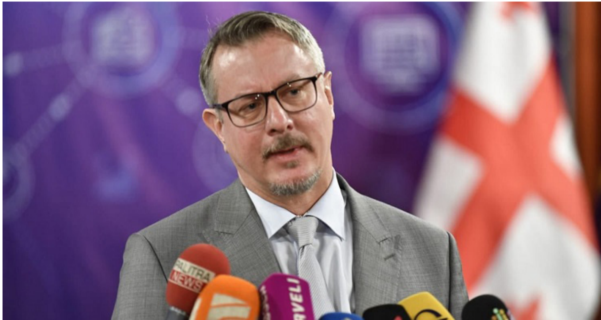
The EU Delegation published an interview with the EU Ambassador about assistance to Georgia