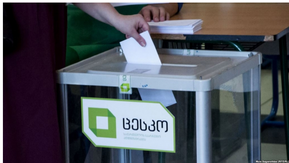
ISFED published the statement on December 11

The talks between the political parties will continue in the future as well.