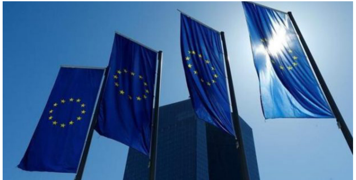
Georgia has also received medical equipment from the EU to fight against the virus

“We try to help people directly on the front lines of the pandemic. Our assistance is distributed to 9 laboratories in Georgia, the Emergency Coordination and Emergency Care Center, as well as more than 4,000 ambulance crew drivers and doctors, to assist them in their duties. In addition, we provide training on safe working rules, stress management, and other similar issues, which is very important,” noted the ambassador.