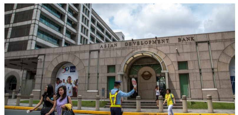
Promoting safe, equitable, and effective access to vaccines is a top priority for ADB’s COVID-19 response efforts

APVAX promotes safe and effective vaccines to be accessed in a fair manner. For a vaccine to be eligible for financing, it must meet one of three criteria. It must be procured via COVAX, prequalified by WHO, or authorized by a Stringent Regulatory Authority. Additional access criteria, such as a vaccination needs assessment, a vaccine allocation plan by the developing member, and a mechanism for effective coordination among de-