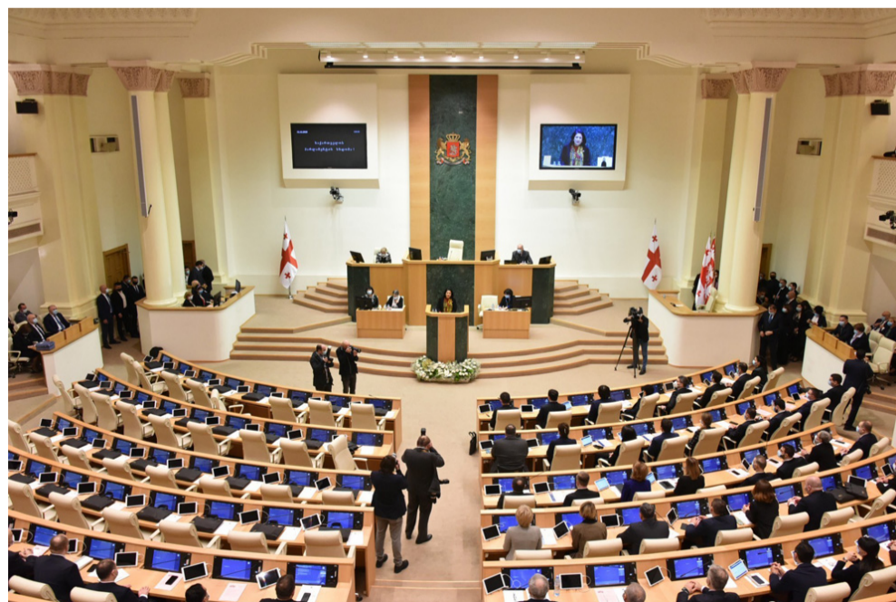
On December 11, the 10th convocation of the parliament of Georgia holds the first session following the elections