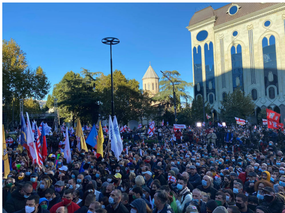
The opposition's remains

The parliamentary election in Georgia was held on October 31. Over the last month, representatives of the opposition have been calling for snap elections.