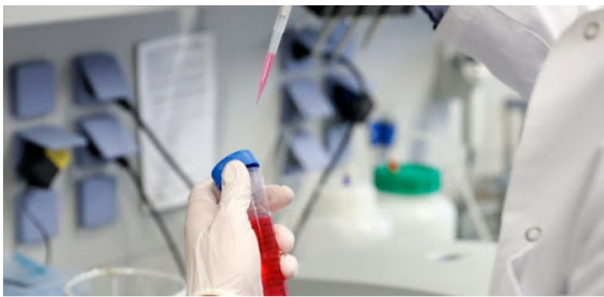
Most of the cases are being reported in Tbilisi and Imereti

reported 162,475 cases of Coronavirus. Out of these, 133,511 have already recovered. On the other hand, the number of people dying because of Coronavirus complications is increasing fast as well. The number is now at 1504. On Sunday, 42 deaths were reported.