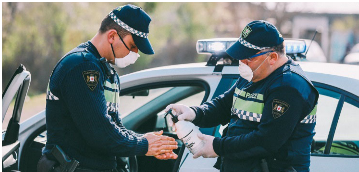
The number of current active Covid-19 cases in Georgia is 27,434