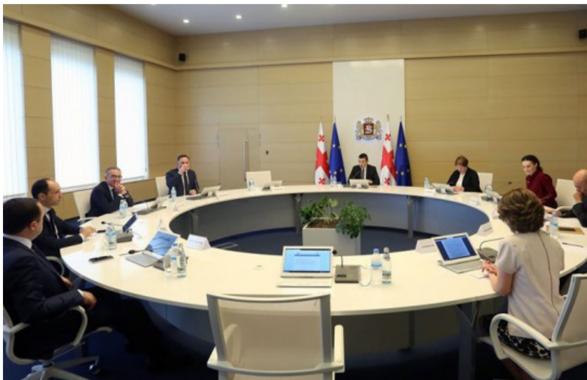
► Income tax exemption will be extended for six months.

According to him, the self-employed, under the imposed restrictions, will receive one-time assistance of €300 and will help them to defer state bank liabilities. This program will only apply to those citizens whose right to work has been temporarily suspended. We are mainly talking