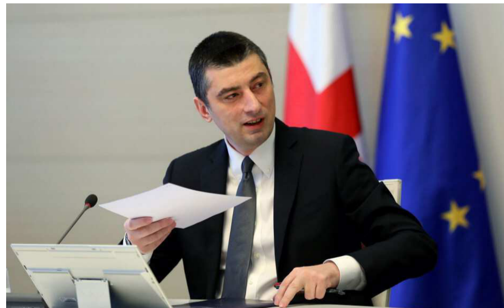
► "The economic price of these restrictions will be 0.7% -0.8% of GDP, no more."

Movement of persons from 21:00 to 05:00 both on foot and by transport, as well as being in public space, will be restricted till January 31. Exceptions will be New Year's Eve - December 31 and Christmas Eve - January 6. Regular intercity transportation of passengers, including by rail, bus, and minibus will be prohibited as well. There are no restrictions on cars (including taxis).