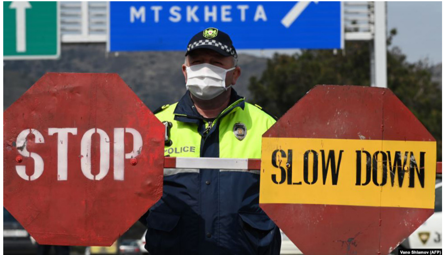
► From February, when the first infection was confirmed in Georgia, a total of 118 690 cases were recorded.