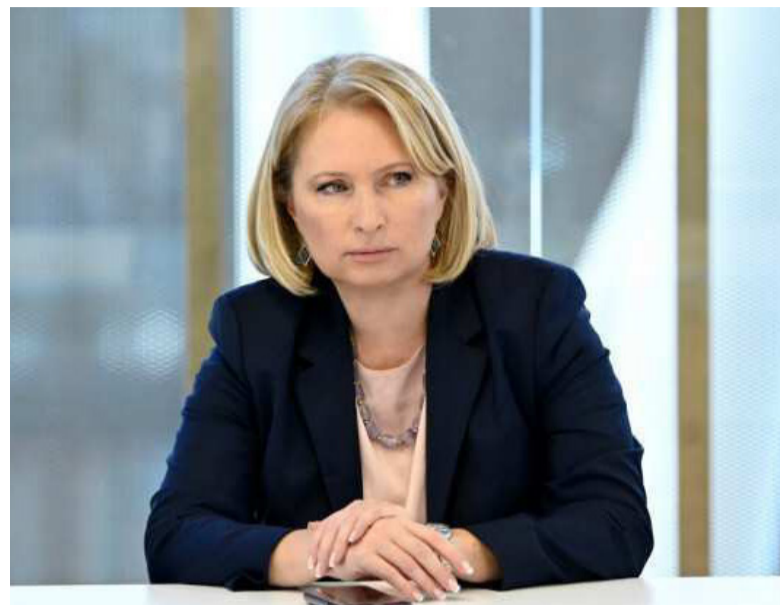
► Natia Turnava

fully provided from the budget and we have enough funds for that. I hope that the next parliament will quickly consider next year's budget and this will be reflected partly in this year's budget, partly in next year's budget; As for issues such as pension savings, pension reform, pension