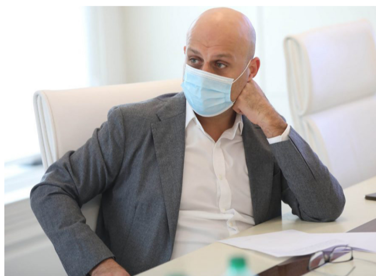
► "Timely activation of the parliament is significant for legislative changes to support social and business."

Extension of income tax exemption program for 6 months. In the first wave of the pandemic this program provided for full