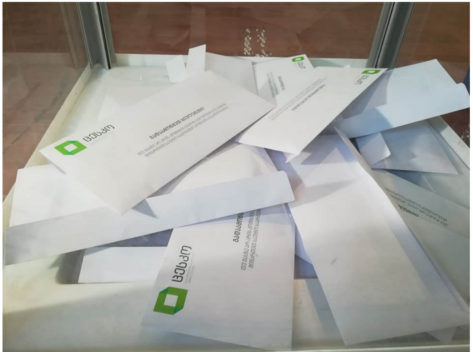
The second round of 2020 elections was held on Saturday, November 21