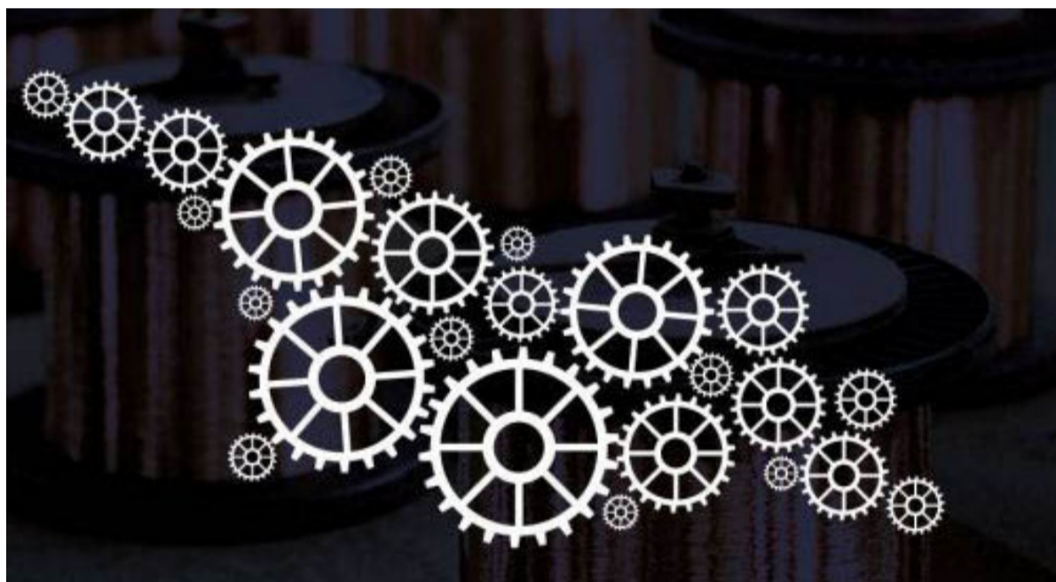
The program aims to help the country increase direct foreign investment in Georgia

The Enterprise Georgia program aims at supporting entrepreneurs and increasing export potential in the country.