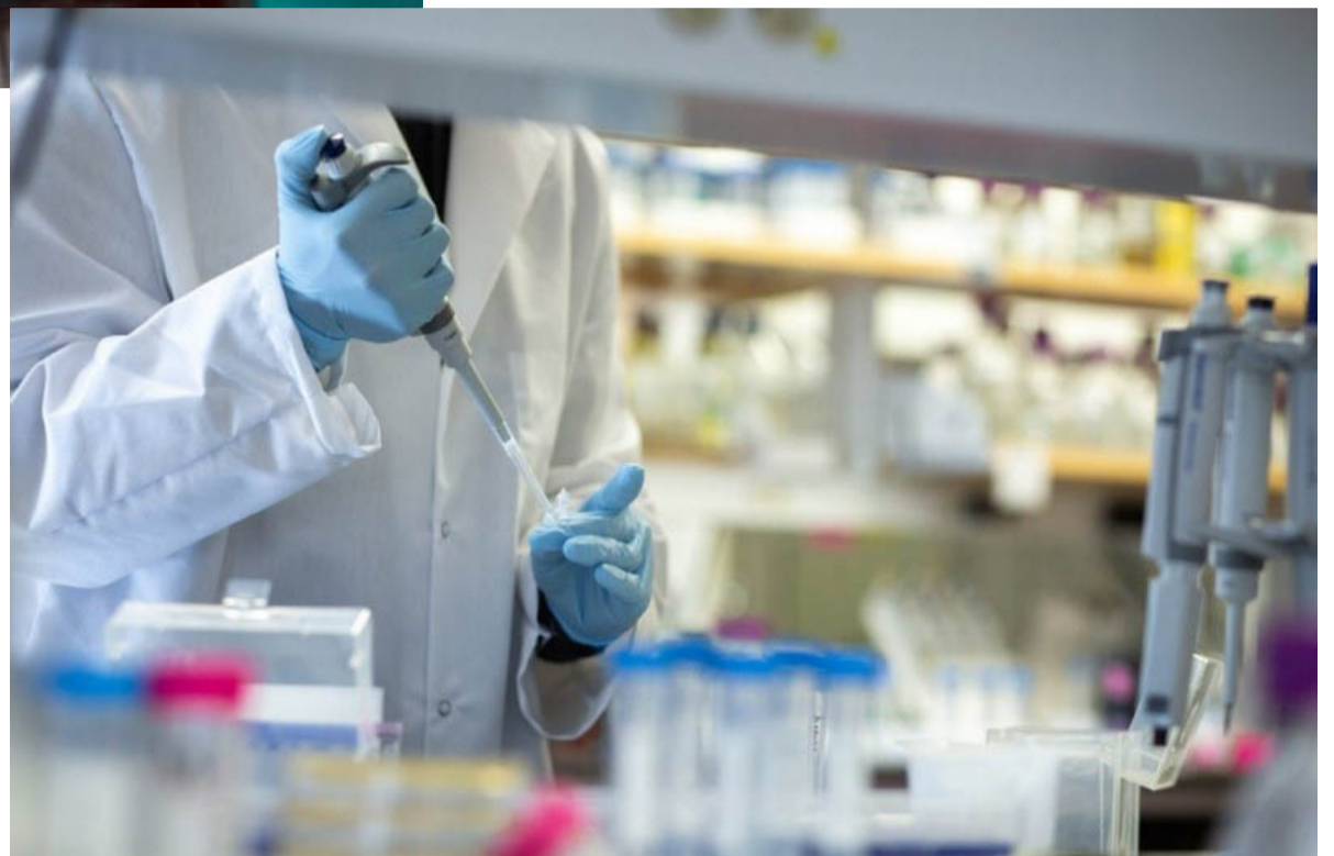
976 people have died of coronavirus in Georgia

Prime Minister Giorgi Gakharia stated several times that the government is ready to adopt more restrictive measures to take control over the spreading of the virus. He said that the restrictions would not be as strict as it was in Spring.