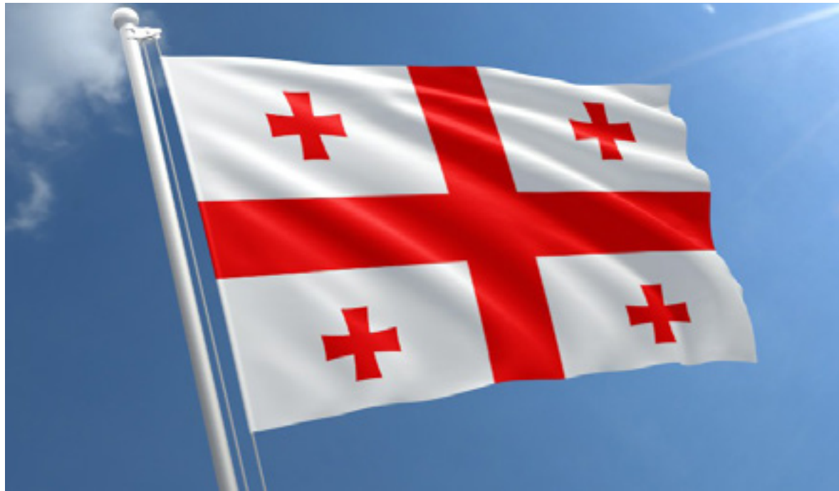
► Over the past decade, Georgia has moved up the ranking by 11 places compared to 2009.

According to the Prosperity Index 2020, Georgia is one of the most compelling recent examples of progress in addressing challenges. The report reads that the levels of extreme poverty in