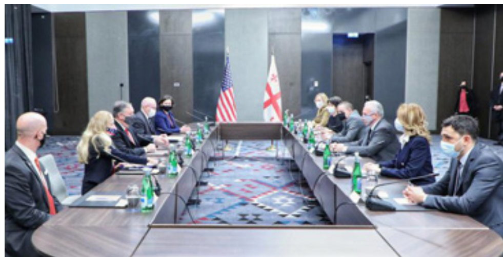
► Mike Pompeo left Georgia after he met with non-governmental organizations.

subjects of strengthening security in Georgia and the region.