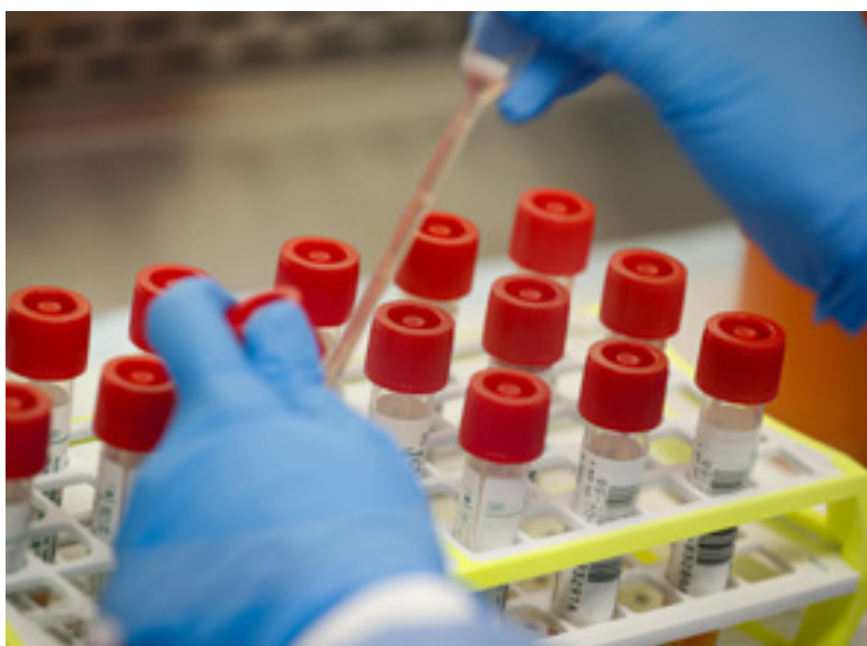
► According to the recent data, in total, Georgia has reported more coronavirus cases than China.