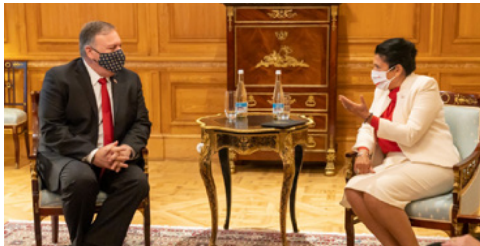
► The President noted that the friendship between the two countries, which spans three decades, has never been called into question as it is based on shared values - democracy, the rule of law, and, most importantly - freedom.