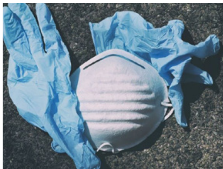
► The government does not plan to impose a full lockdown but considers tightening the restrictions.

of recovered patients to 71 468. Given that there are a total of 86 369 cases confirmed in China, based on the recent data, Georgia has reported more coronavirus cases than China. As of yesterday, 17,086 individuals remained infected