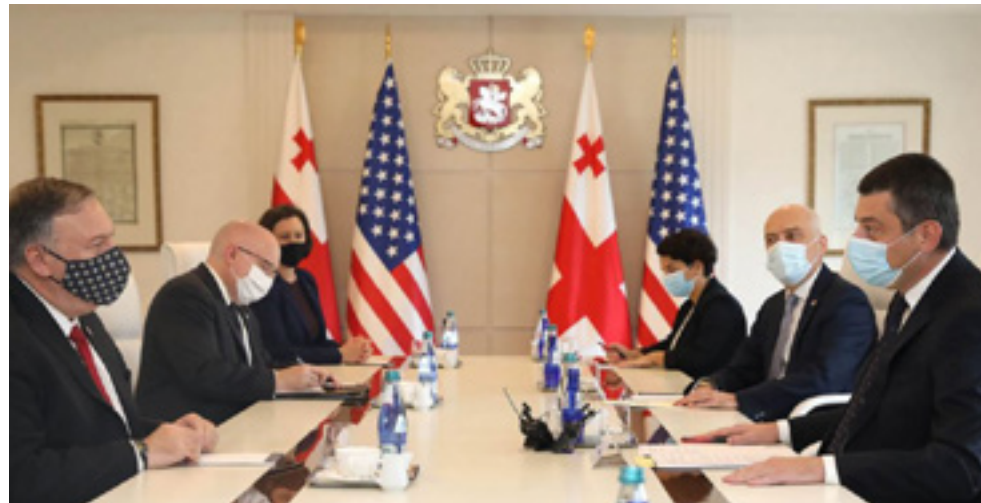
► Mike Pompeo reaffirmed the US's commitment to Georgia's territorial integrity. "When we talk about more US involvement, we mean more US support for Georgia in terms of NATO integration and strengthening defense and security," Zalkaliani said.