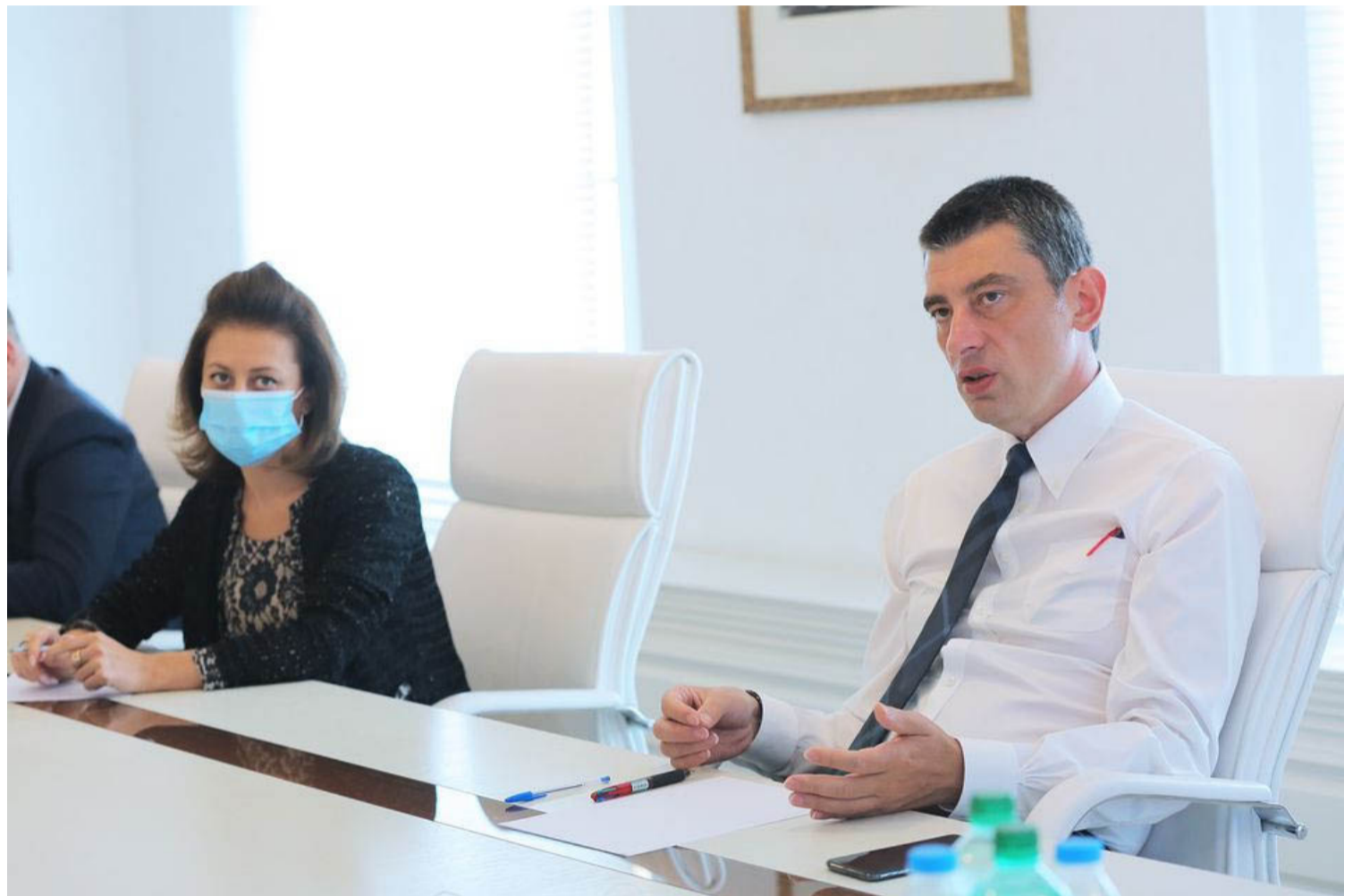
Government will likely impose further restrictions,