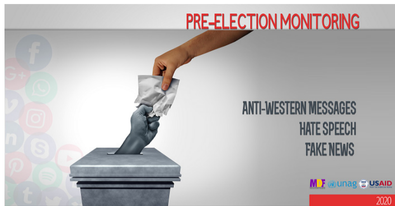
The monitoring of hate speech and anti-Western narratives covers the period from August 1 to October 25, 2020, while the monitoring of fake information includes cases revealed in a period between August 1 and November 10.