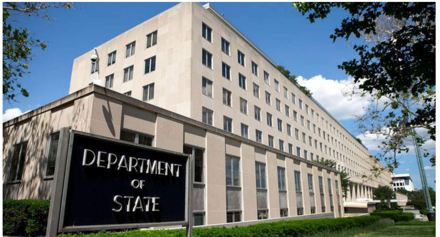
► "The Secretary's last stop in Europe will be Tbilisi...to express our support for Georgia's sovereignty and territorial integrity, to urge further progress in democratic reforms."

Interagency Coordination Council, PM Gakharia commented on the visit of the US Secretary of State and stressed that "it is yet another demonstration of the importance and all-time high level of Georgia-US strategic partnership." Gakharia noted that despite the COVID pandemic and all the other challenges