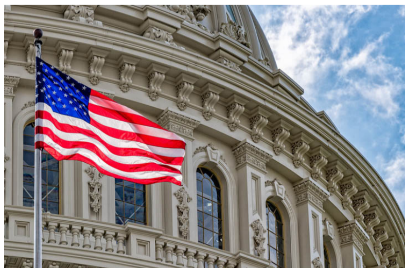
▶ In July, the US House Appropriations Committee Announced External Finance Financing Bill for Fiscal Year 2021, which also discussed Georgia.