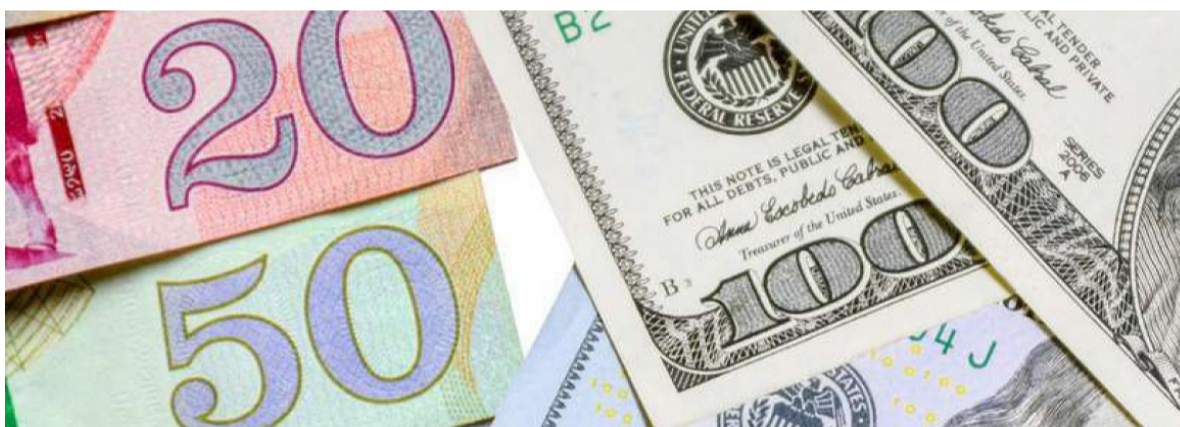
▶ Georgia will receive $112 million from the IMF

sand. Most of these visitors were in the country before the border was closed and Lockdown was declared earlier this year.