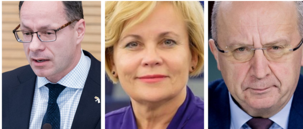
► Members of European Parliament Andrius Kubilius and Rasa Juknevičienė, also a member of Parliament of Lithuania Žygmantas Pavilionis express readiness to play a 'constructional role' in dialogues between the government, opposition, and people.