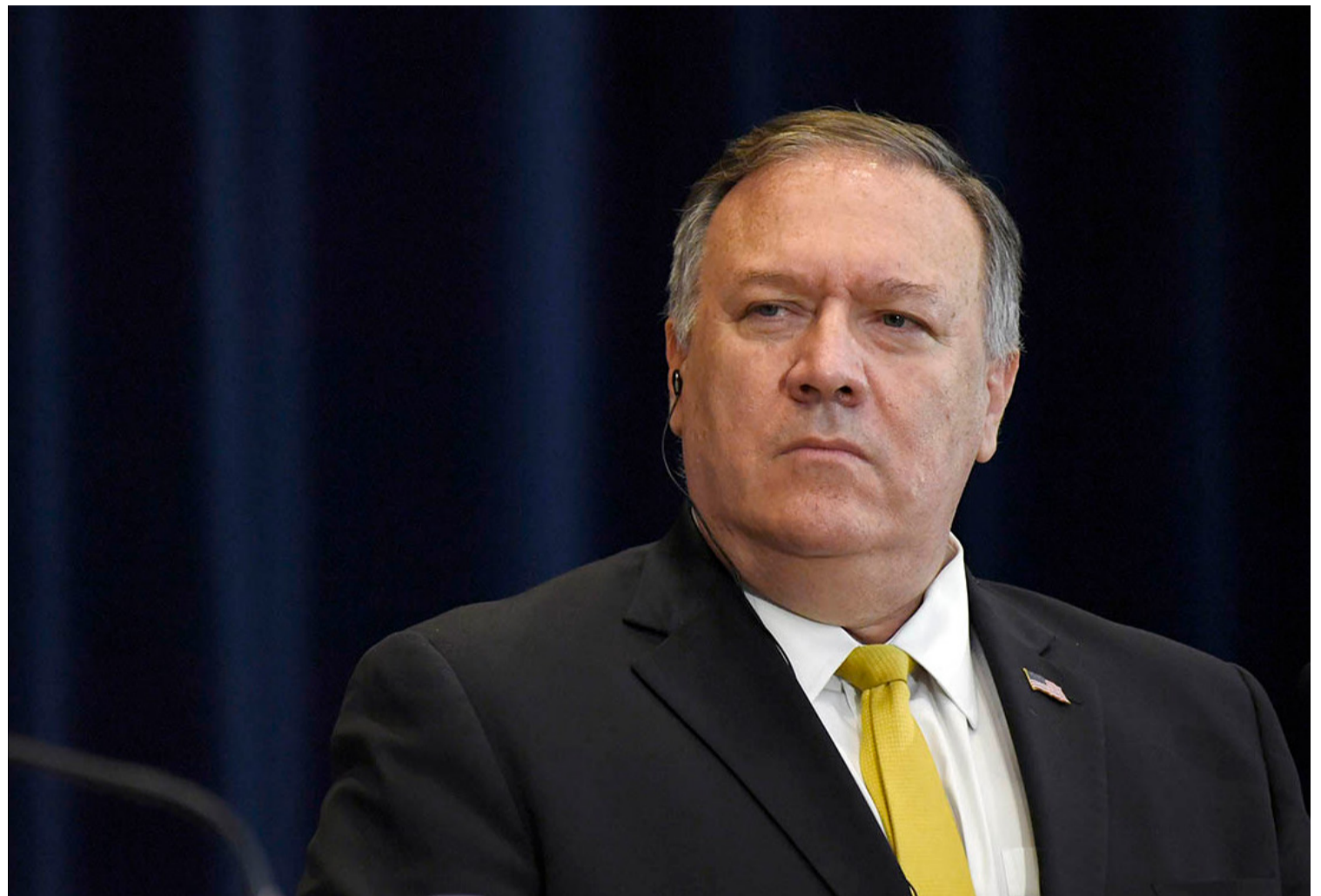
► US secretary of state Mike Pompeo