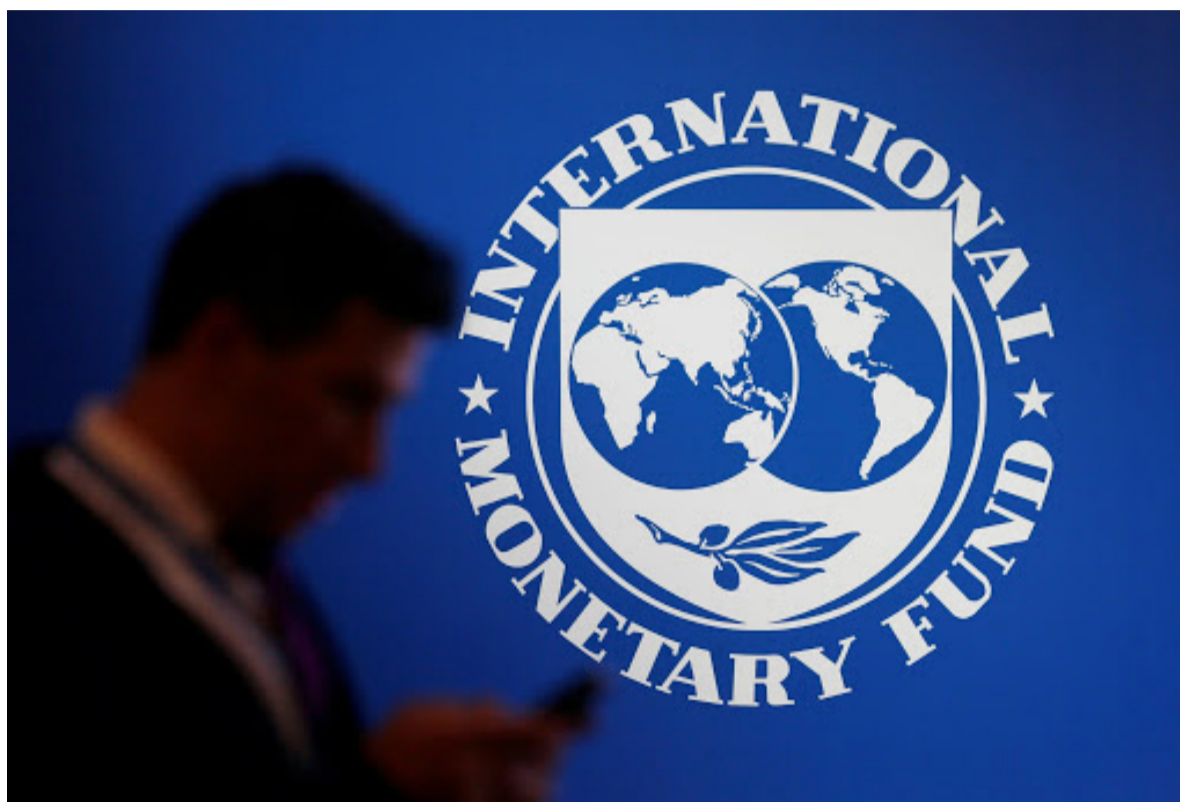
▶ IMF says the tourism in Georgia will return to the 2019 level by 2024

According to the National Tourism Administration, 1.37 million international visitors visited Georgia in the first 9 months of 2020, which is 77.1% less than in the same period of 2019. The flow of visitors from the EU decreased by 83% this year and amounted to 66 thou-