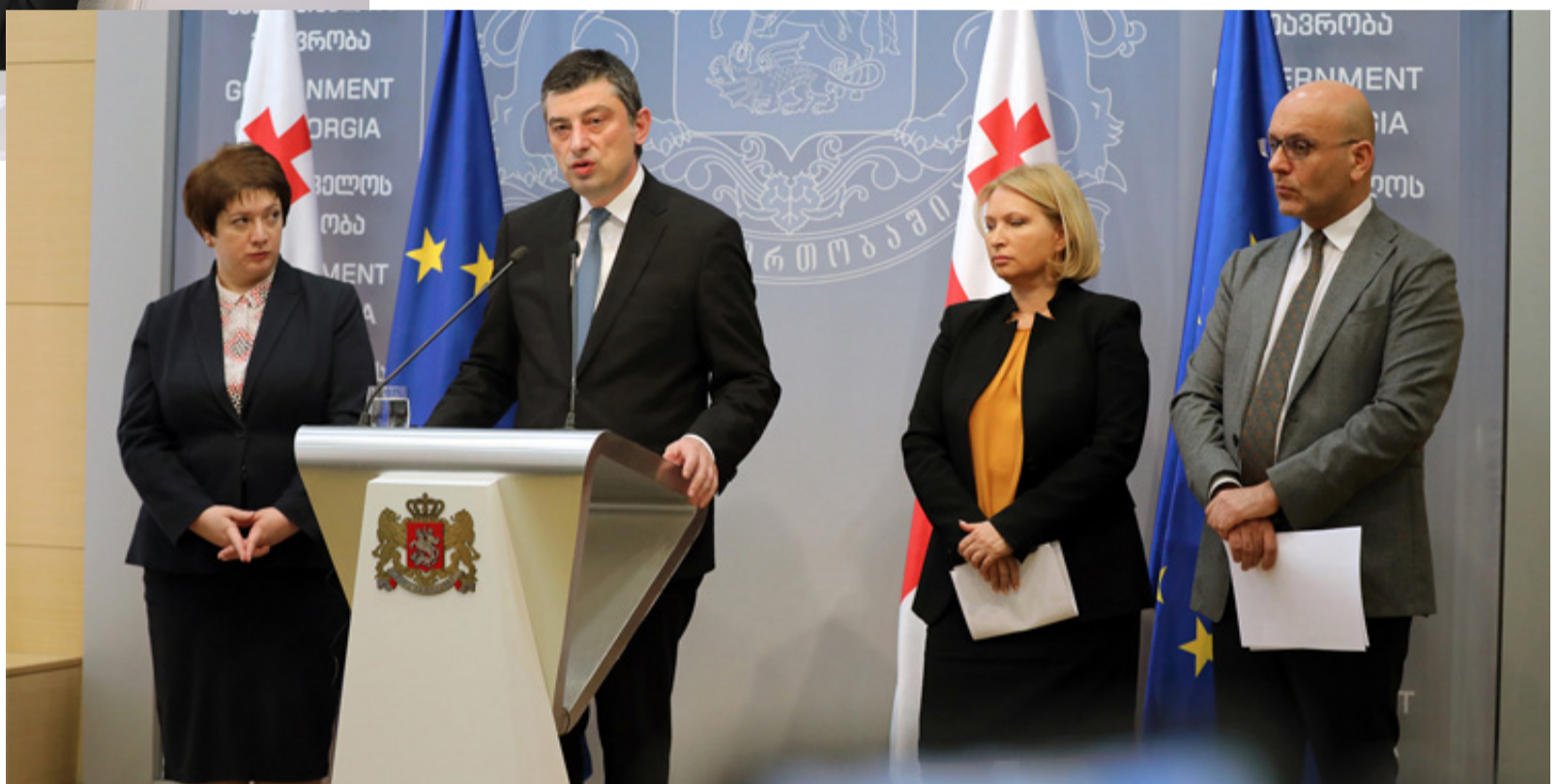
Gakharia spoke about the state strategy at the stage of adaptation to the virus

we have to follow the basic rules, be it a shop, restaurant, hotel, market, public transport, or enterprise..These rules will be very strictly monitored." The PM also noted that Georgia "has one of the best positions in terms of post-crisis recovery" and called on businesses to prepare for attracting new investments and create additional jobs, for which they "will have special support from the state."