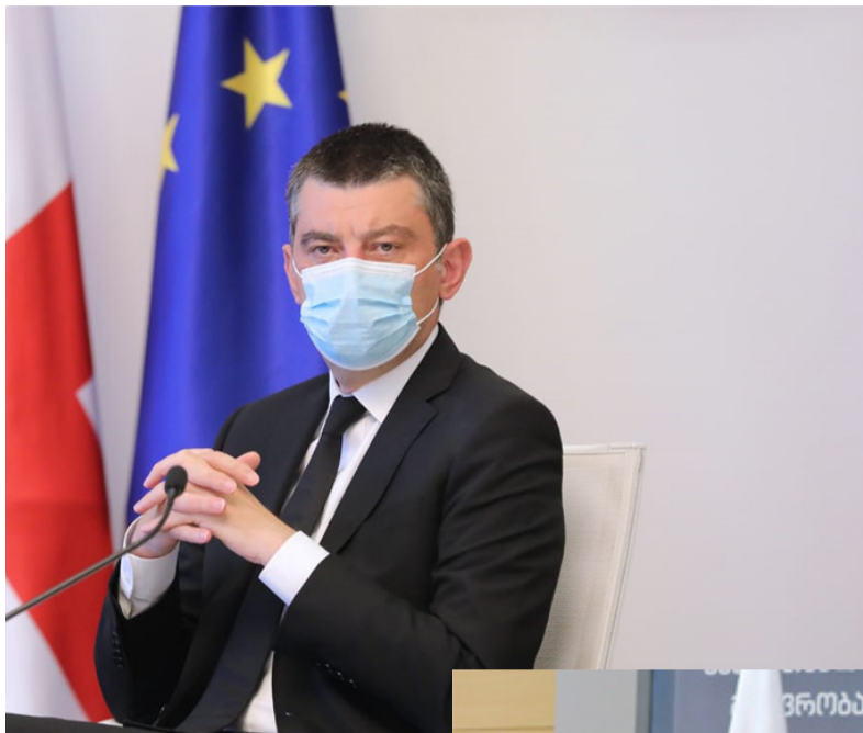
The meeting was held to come up with new ideas to help the business sector in Georgia