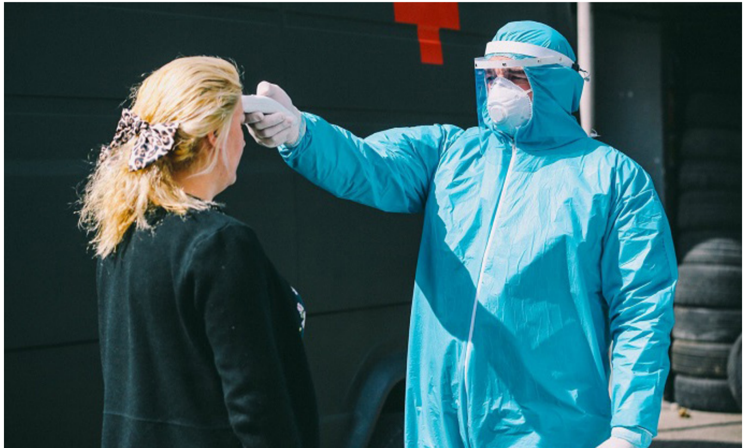
Number of Covid-19 cases in the country have increased significantly, especially in Tbilisi, Adjara, and Imereti