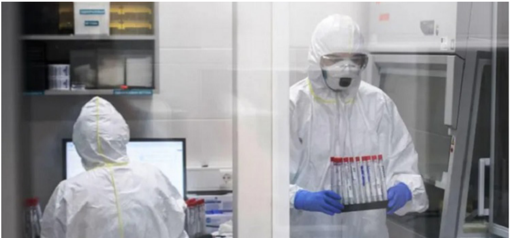
Over the weekend, a total of 3869 new cases of the Coronavirus was reported in Georgia

As of now, the government isn't planning on another lockdown or further tightening of restrictions.