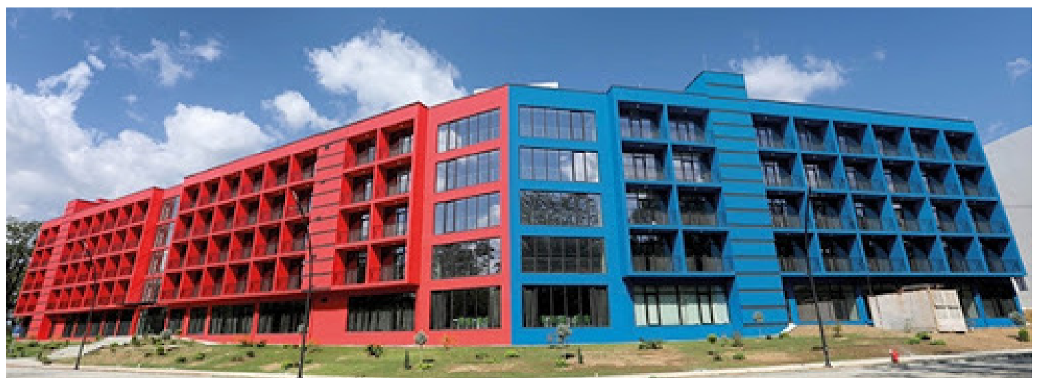
► KIU includes three academic buildings, student dormitories, a residential building for the staff, a library, cafés, indoor and outdoor recreational spaces, electric transport, and bicycle lanes.

€1 million worth projects of KIU were officially presented on September 8, 2016, and has been established under