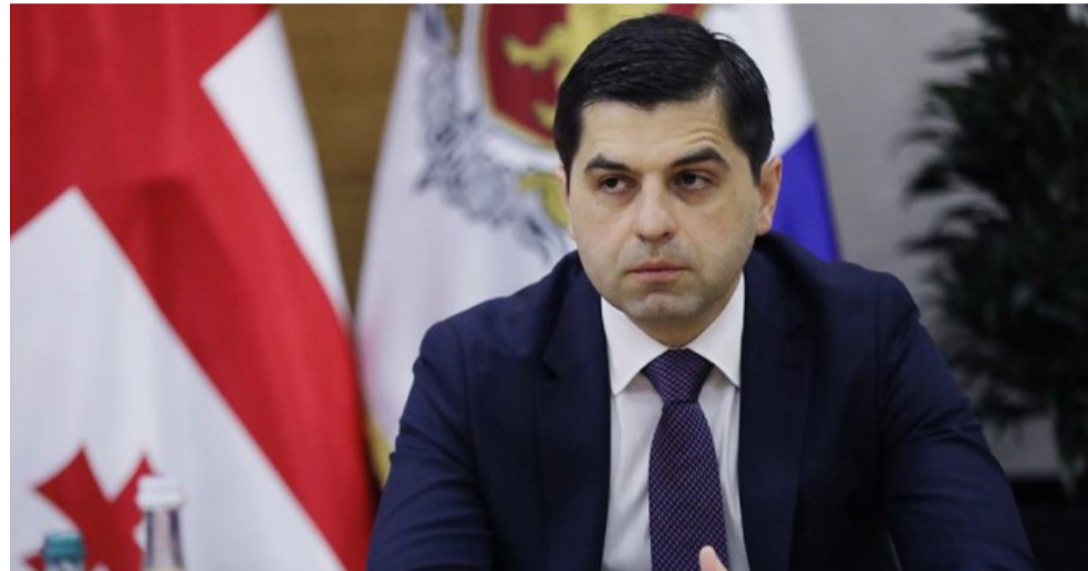
► "The Ministry of Internal Affairs is doing its best to protect the health and safety of the hostages in Zugdidi and to release them in time," says Sabanadze.