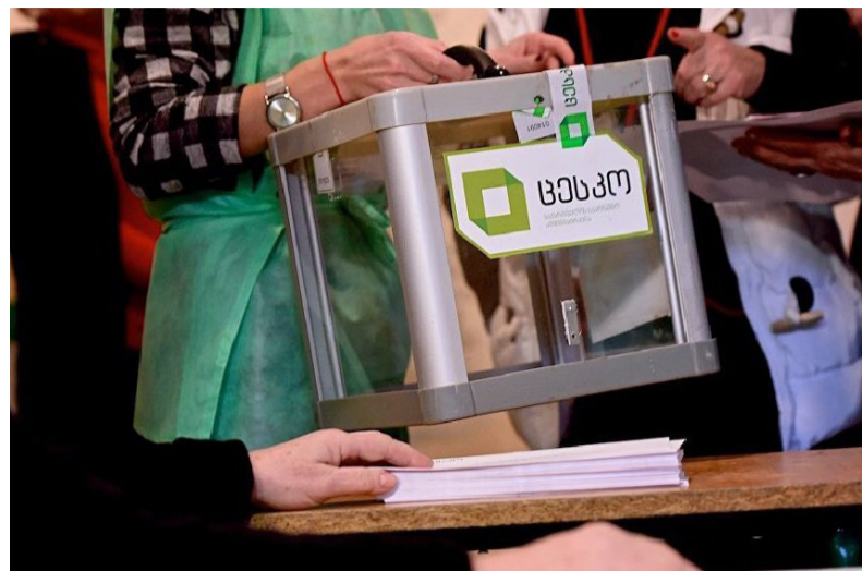
“For the safety of the process, the special groups and polling stations will have no contact with ordinary ones.”