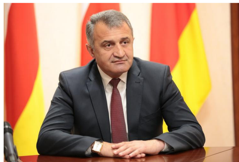
A few days ago, the so-called President of the Russia-occupied Tskhinvali region of Georgia Anatoli Bibilov tested positive for COVID-19.

The statement is signed by Human Rights Education and Monitoring Center – EMC, Human Rights Center (HRC), Georgian Young Lawyers' Association (GYLA), Democracy Research Institute (DRI).