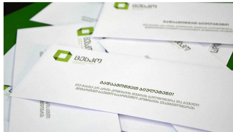
Observers, media, and representatives of election entities will be able to follow the mobile ballot box and observe the process of voting as well as vote counting.

CEC notes that according to the law, observers, media and representatives of election entities will be able to follow the mobile ballot box and observe the process of voting as well as vote counting.