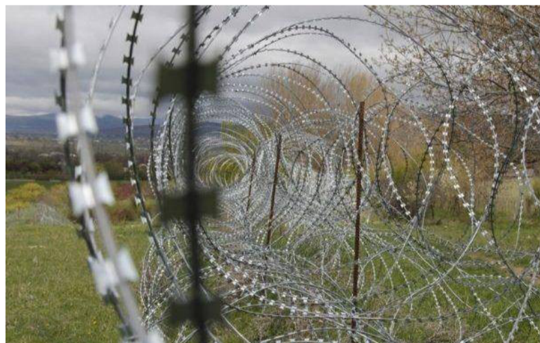
NGOs demand prompt restoration of freedom of movement in the Tskhinvali region.

According to the statement, the epidemiological situation in the Tskhinvali region has deteriorated, the number of infected people has increased and there are no more beds available in the Tskhinvali Hospital for infectious Diseases. According to the NGOs, hospitals of Tskhinvali experience a shortage of medi-