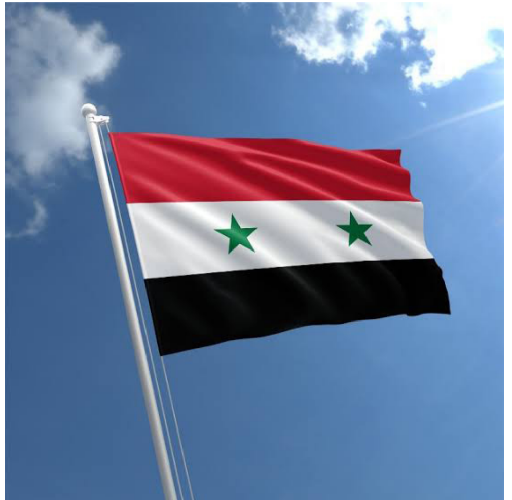
A delegation of the de facto government of Abkhazia occupied by Russia is in Syria.

"The entire international community, leading European countries, the United States, and international