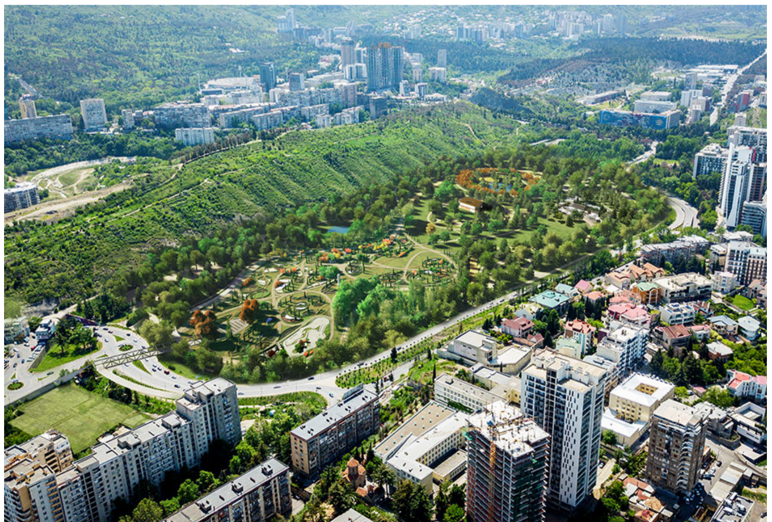
City Hall presented the photos of what Tbilisi Central Park will look like.