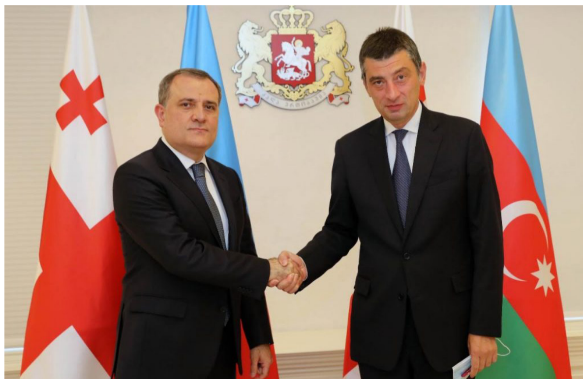
► PM Giorgi Gakharia met with the Minister of Foreign Affairs of Azerbaijan.

Within the framework of the visit, the minister will hold official meetings with the President of Georgia Salome Zurbishvili and the Vice-Speaker of the Parliament of Georgia Kakhaber Kuchava.