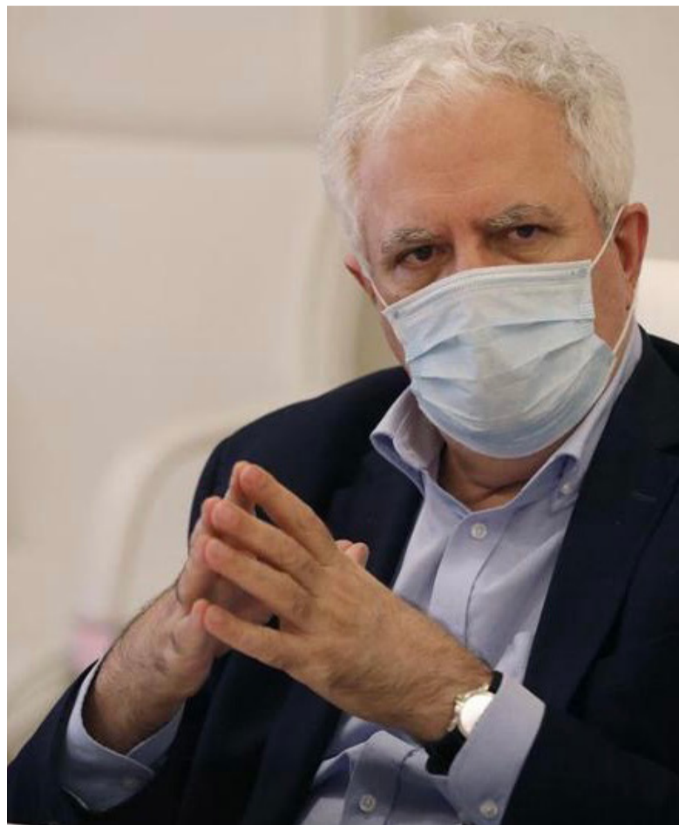
Amiran Gamkrelidze notes that the dynamics of testing has not decreased. Caption 2: The number of people infected has increased, 5 people die in the last 48 hours.

AMIRAN GAMKRELIDZE, DIRECTOR OF THE NATIONAL CENTER FOR DISEASE CONTROL, CAME FORWARD WITH A STATEMENT AT THE BRIEFING AFTER THE END OF THE COORDINATION COUNCIL ON SEPTEMBER 24TH, TO SPEAK ABOUT COVID-19 RELATED ISSUES.