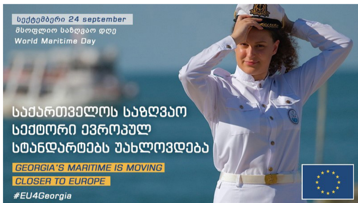
► According to 2019 data, Georgia ranked 13th in terms of the supply of officers on EU ships.

standards: Institutional and legislative reforms Safe, secure and efficient international shipping industry is an important com-