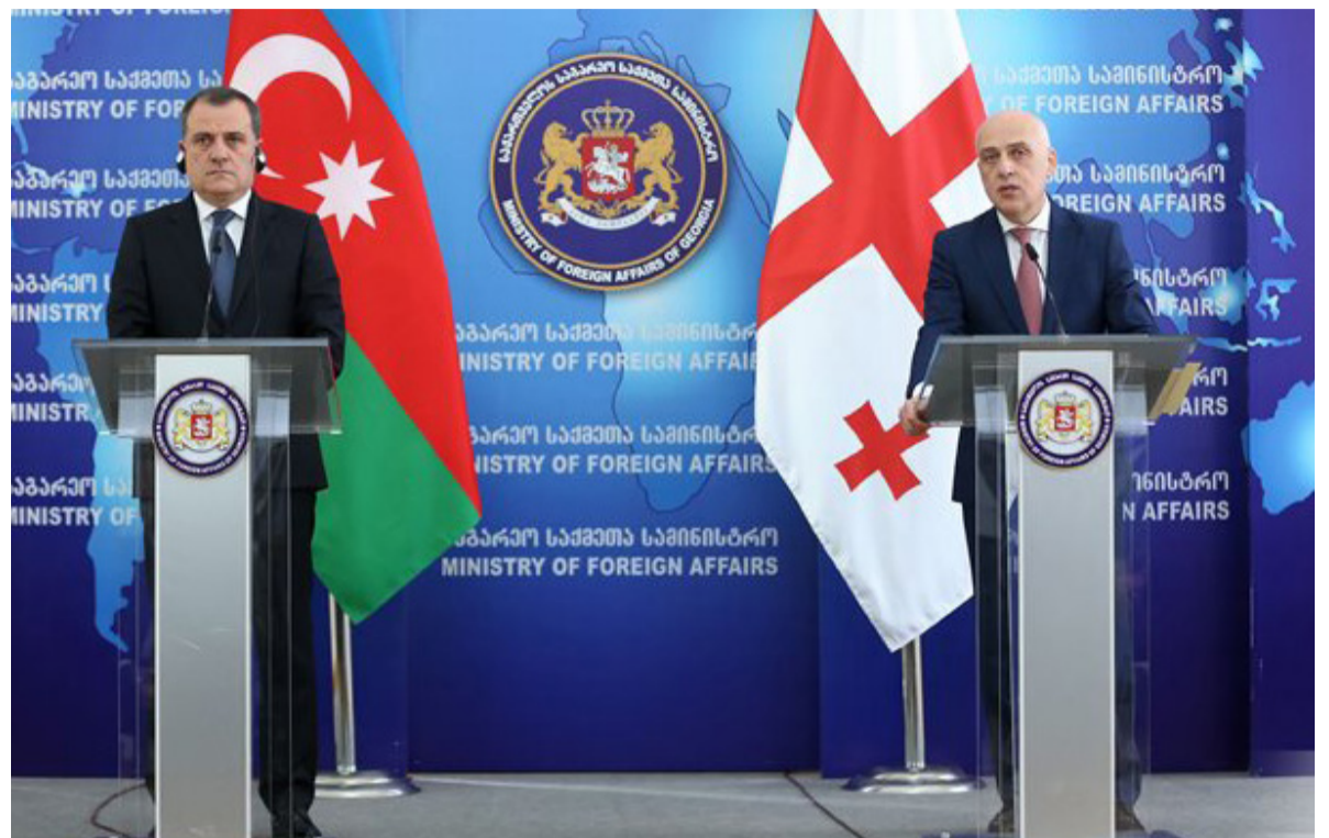
► “There are no unresolved issues between Georgia and Azerbaijan, I am sure the issue of delimitation will be resolved soon,” announced Bairamov.

The conversation also touched upon the importance of deepening cooperation between Georgia and Azerbaijan in various formats. Special attention was paid to the success-