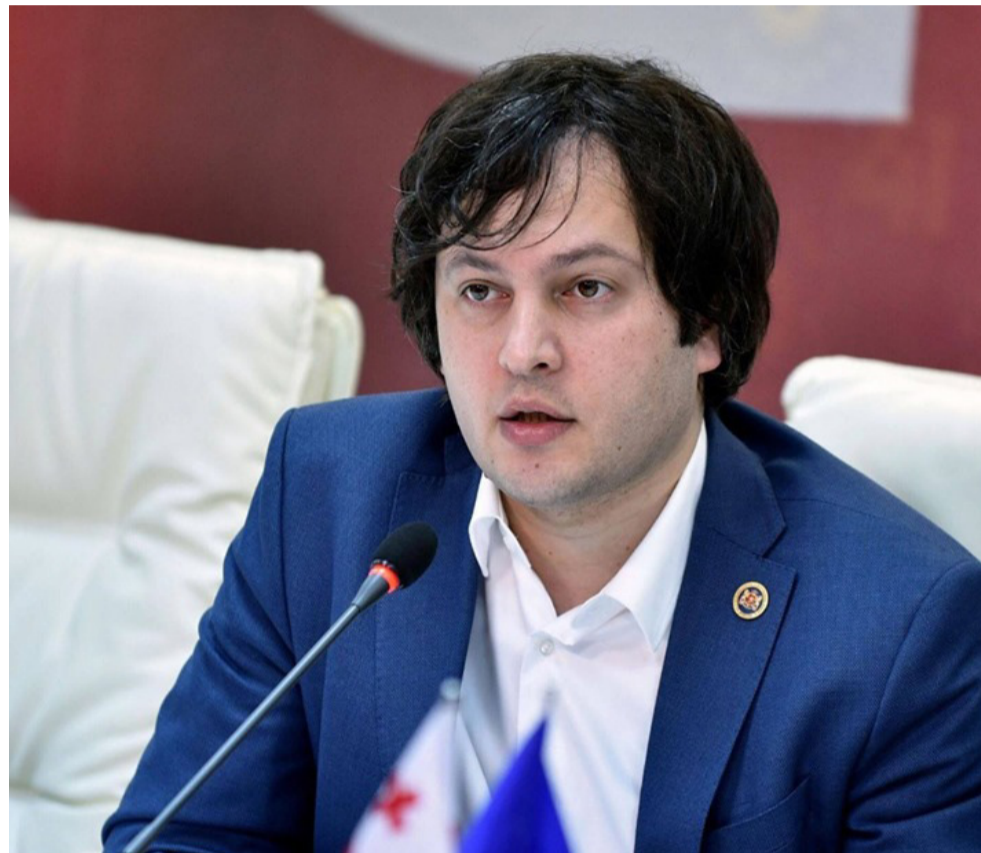
► Irakli Kobakhidze.

affiliation - 15%. Platform/program/promises were named by 14%.