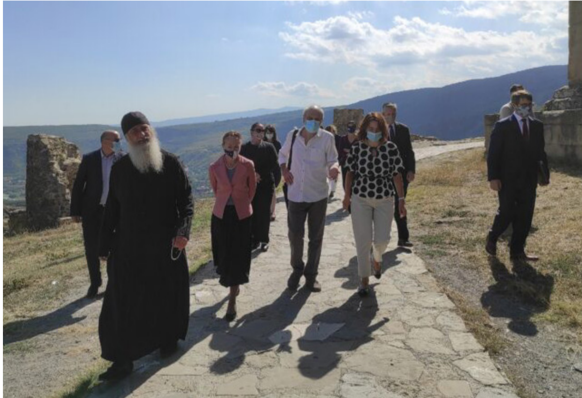
► U.S. Ambassador Kelly Degnan visits Jvari Monastery.

In 2020, the US Ambassador’s Cultural Heritage Foundation supported the continuation of the project and allocated more than half million dollars for the second phase, which involves physical work under a prepared conservation project. This phase