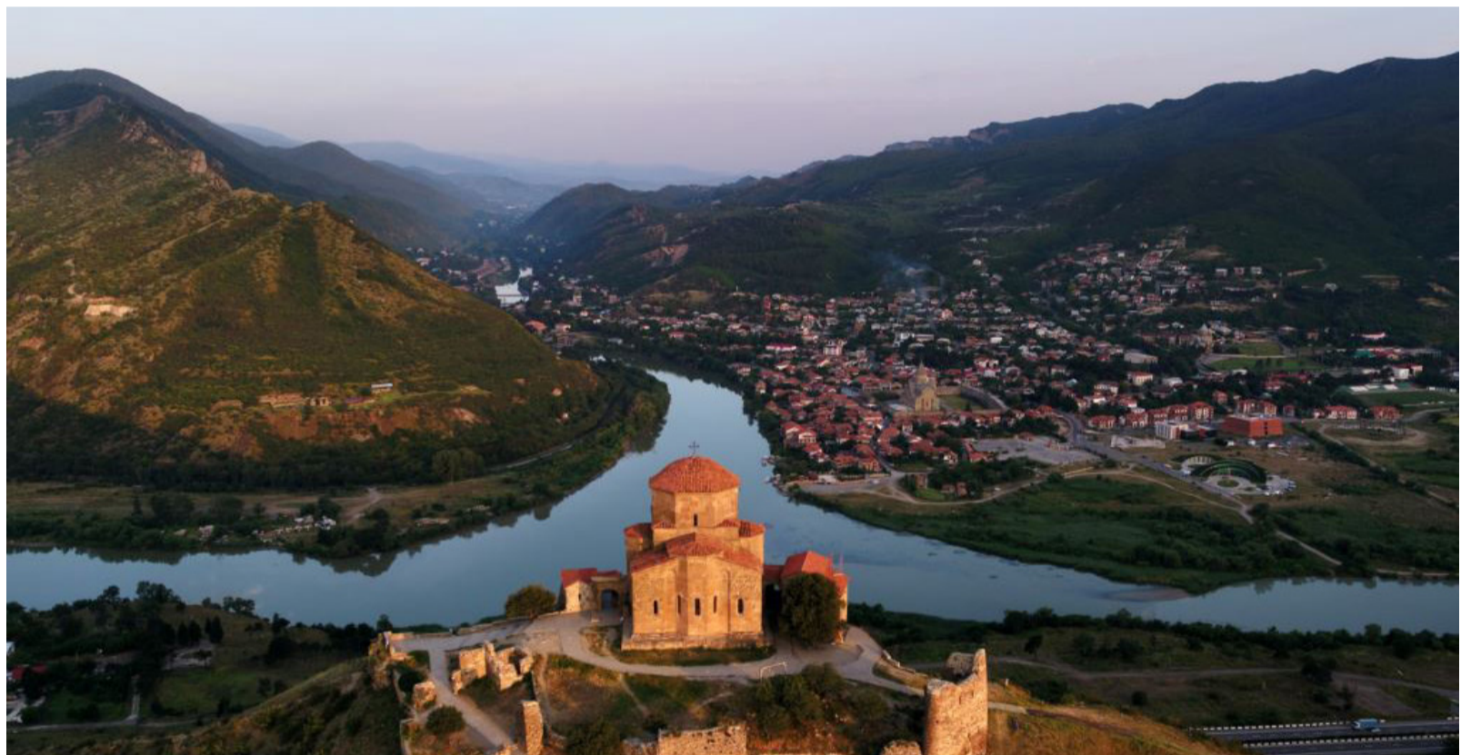
► Jvari Monastery Project won Ambassador’s Fund for Cultural Preservation large grant.

The Jvari Monastery is one of 3 monuments included in the UNESCO World Heritage Site entry entitled Historical Monuments of Mtskheta. The monastery overlooks the confluence of the rivers Mtkvari and Aragvi outside the historical city, around 20km north of capital Tbilisi.