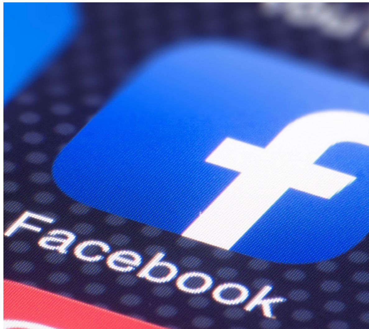
► Facebook has more than 70 partners around the world working on fact-checking in 50 languages.