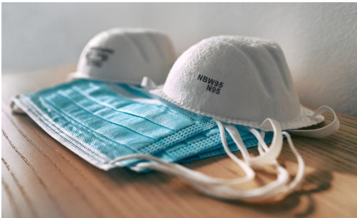
Wearing masks will be compulsory on Election Day.