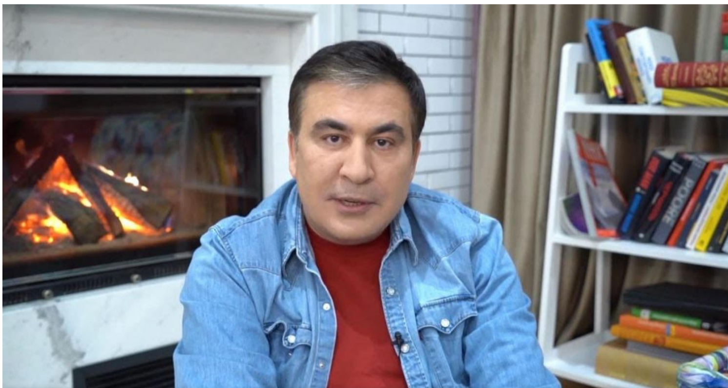
Ex-president of Georgia, Mikheil Saakashvili

As Saakashvili says in the video, the reason for his candidacy for the PM's post is not because he wants to be back to the government.