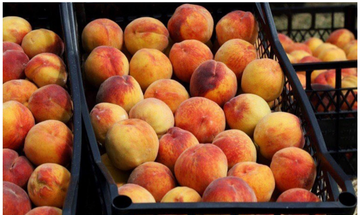
As of September 5, 24,240 tons of peaches and apples were exported from Georgia.

According to the data of the National Wine Agency on September 5, 5,000 tons of different varieties of grapes have been processed in the Kakheti region. According to the agency, at this stage, 160 wine companies are registered in the coordination headquarters, 30 wineries have already been involved in the grape processing process.