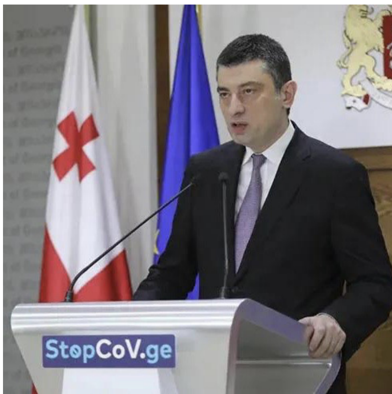
According to Giorgi Gakharia, the control of social events and gatherings in closed spaces will be way stricter.

Also, according to the decision of the Coordinating Council of the Government, schoolchildren and students in Batumi and Kobuleti will start studying remotely during the first two weeks. Gakharia talked about it as well at the briefing held after