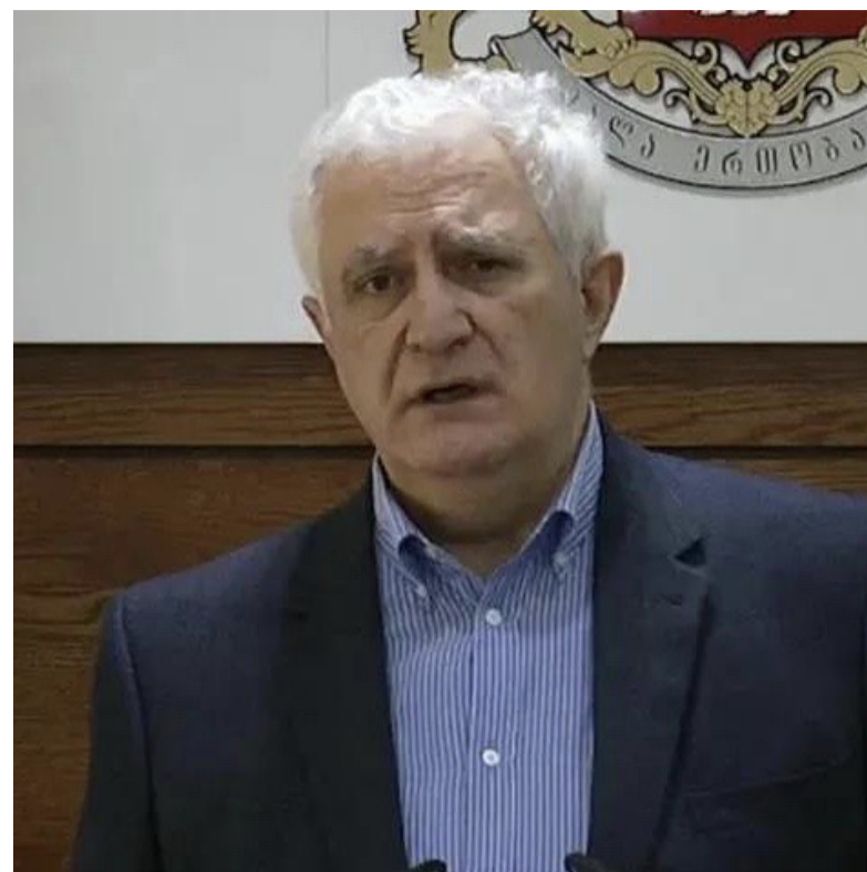
Amiran Gamkrelidze claimed that in Batumi, one case of Coronavirus has been detected at the Khopa market and testing will be starting tomorrow.

At the same time, as the Deputy Minister of Health Tamar Gabunia said, in case the quarantine period is reduced to 8 days, the quarantine or self-isolated person will have to un-